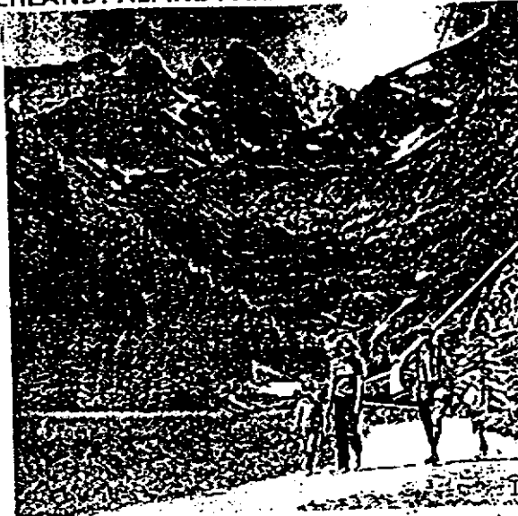
Wildhaus in Eastern Switzerland. The amateur player carries his alphorn, which can be heard from miles away.

Traveling by rail can be the easiest way for a family to see Switzerland. Frequent service to even the smallest village by train or postal motor-