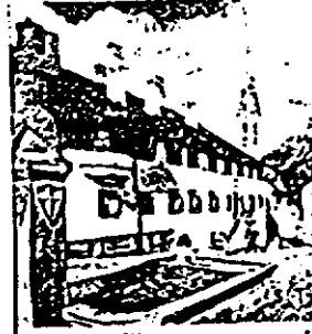
The village square in Zuoz, considered an architectural gem.

The Upper Toggenburg Valley in Eastern Switzerland, where Wildhaus is lo-