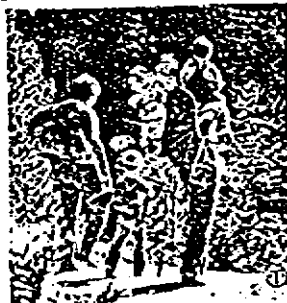
Miles of scenic hiking trails make for marvelous outings.

coach makes it possible to roam a lofty plateau by day, descend to a farmland and a village in the evening and dine in a city restaurant at night. The Swiss Holiday Card provides unlimited travel for up to a month on railroads, buses and steamers at very advantageous rates.