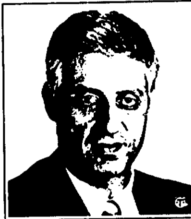
Meir Buber Israel Trade Commissioner to the U.S.

"El Al, Arkia and CAL provide 80 percent of air freight service to Israel, so there is no problem of absorbing cargos that would have been carried by other airlines that can-