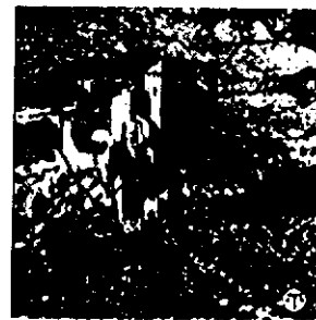
The fortress-like Romanesque-early Gothic St. Catherine's Church in Sion, now a museum.

In 1992, The Swiss National Tourist Office plans to offer a Castle Pass, a listing of castles open to the public, of those housing museums or special events, suggestions for hikes from