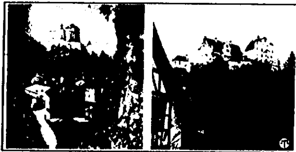
Two of the more than 2,000 stunning castles of Switzerland: Tarasp (left); Castle Altenklingen in Northeast Switzerland, an ancestral castle until 1586 (right).

There are over 2,000 castles and fortresses in Switzerland, an astonishing number for a country that small. Most of these strongholds bear testimony to the centuries when the Swiss had to defend their country against foreign rule and to protect their vital Alpine passageways. Others are reminders of the feudal lives of the privileged few.