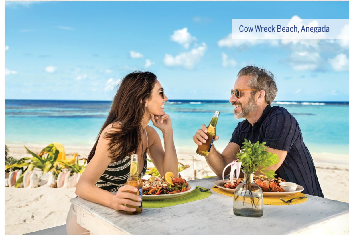
Cow Wreck Beach, Anegada