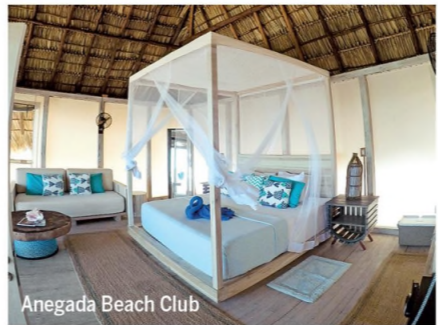
Anegada Beach Club

Renowned for hospitality and authenticity, 15 islands offer a full range of accommodations reserved just for you. You're certain to find the perfect fit among the BVI's choice of luxury boutique resorts, vacation homes, and more.