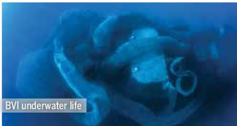
BVI underwater life