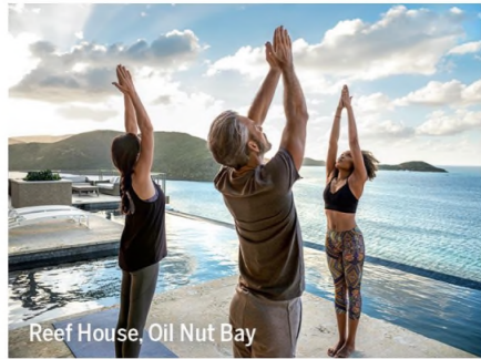
Reef House, Oil Nut Bay

It's no secret that salt-kissed air, calm breezes, and balmy waters can rejuvenate your body and soul.