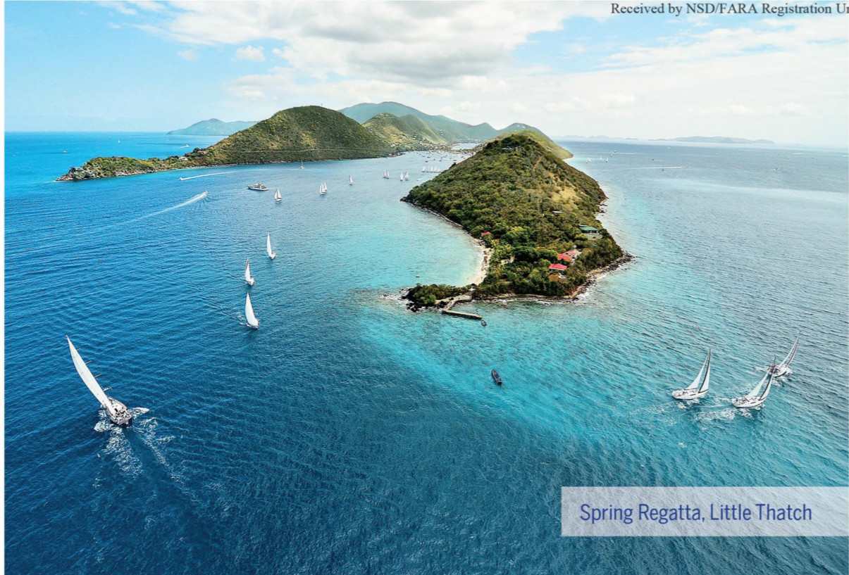
Spring Regatta, Little Thatch

Make the most of the welcoming waters at lively events like the SUP Painkiller Cup, the BVI Spring Regatta and the Anegada Kite, and Paddle Festival.