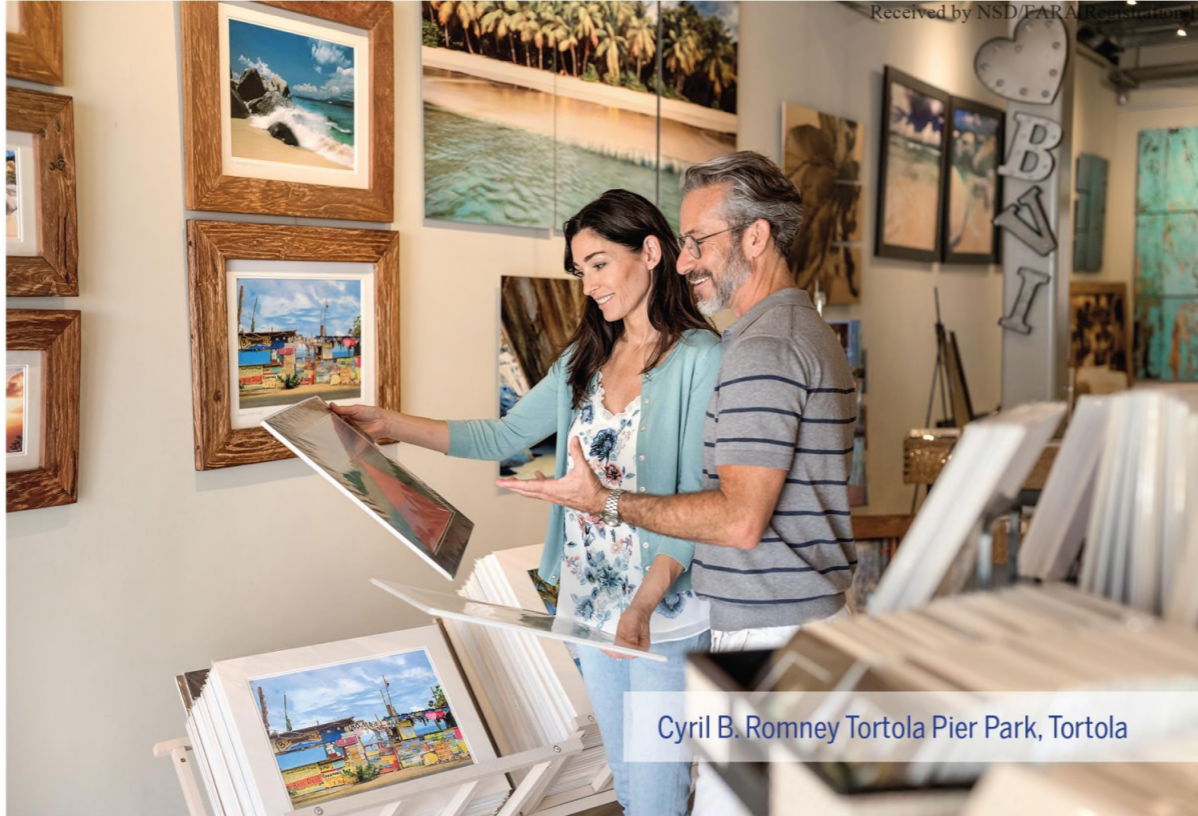
Cyril B. Romney Tortola Pier Park, Tortola

A one-day tour of Tortola, Anegada, Virgin Gorda, or Jost Van Dyke showcases the A.D. 300 to 20th-century history of these picturesque Islands. Take a trip back in time with a visit to one of the local museums, which intricately capsulizes some of the many unique aspects of our true Virgin story. Immerse yourselves further in our culture with a local dish of fish and fungi with a cold glass of mauby for lunch! Not to be missed is BVI's Emancipation Festival – a colorful celebration of our freedom and continuous push toward growth.