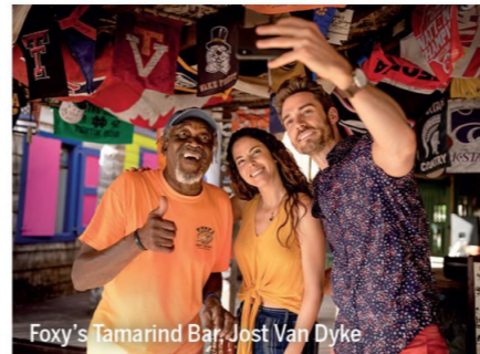
Foxy's Tamarind Bar, Jost Van Dyke

There's always something to celebrate in the British Virgin Islands. Party alongside the Islanders to honor their local culture, from music festivals to sailing regattas and even a deep-sea fishing jamboree.