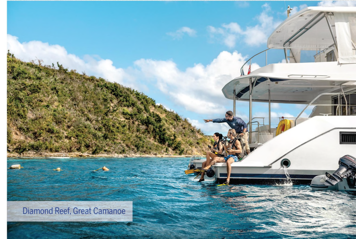
Diamond Reef, Great Camanoe