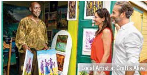
Local Artist at Craft's Alive

Spectacular scenery provides the perfect canvas for couples to say "I do" with options to include secluded beaches, historic ruins, island landmarks, or a gala reception at sea. Multiple venues and exquisite surroundings, including private island buyouts, afford couples the opportunity to create the vision of their dreams for a lifetime of memories.