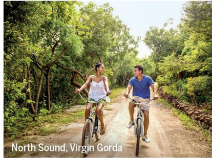
North Sound, Virgin Gorda

With 21 national parks on more than 60 islands, the best-kept secrets are in the BVI's hidden coves, tucked-away beaches, and hushed forests. Ascend Tortola's Sage Mountain for a breathtaking view of the islands scattered like jewels. On Virgin Gorda, The Baths is an astonishing collection of granite boulders and natural tide pools. Wreck divers flock to a marine national park to explore the remains of RMS Rhone , a sunken mail ship teeming with sea life. Jost Van Dyke invites all outdoor lovers, even if you prefer strolling barefoot along White Bay.