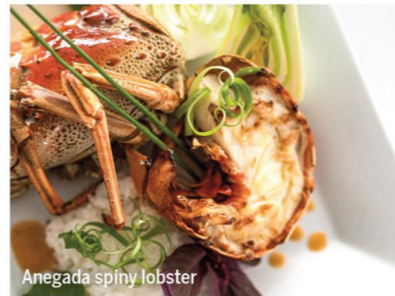
Anegada spiny lobster

From local cuisine to fine dining, every meal is connected to the spirit of the islands.