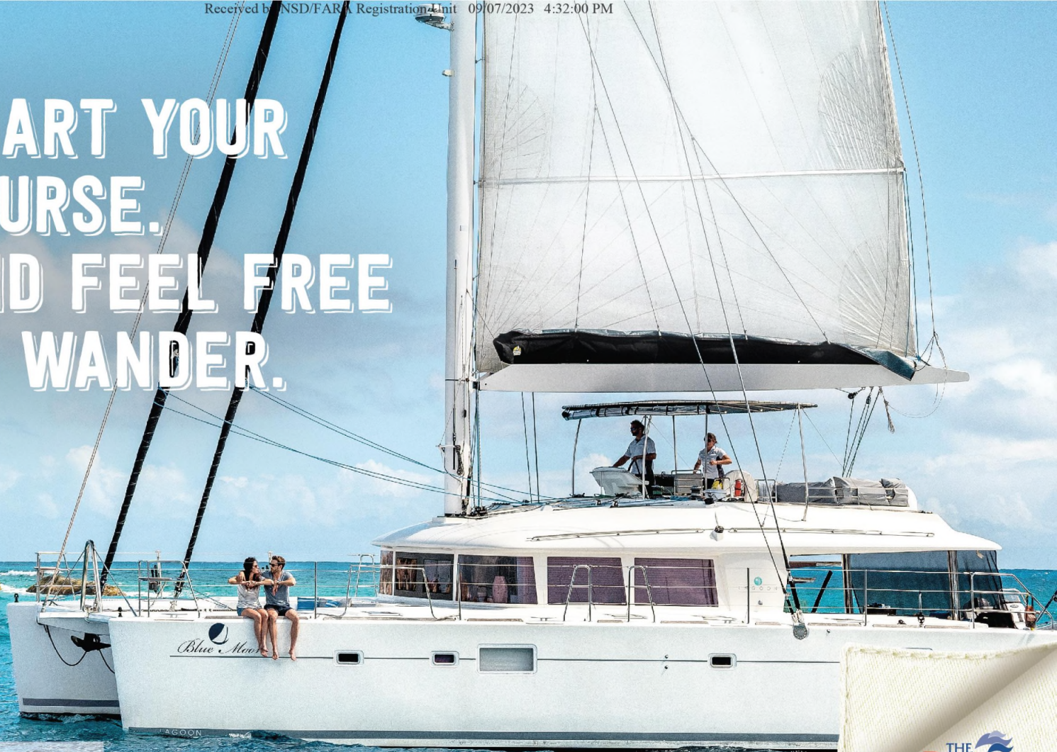
CHART YOUR COURSE. AND FEEL FREE TO WANDER.