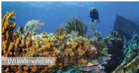
BVI underwater life