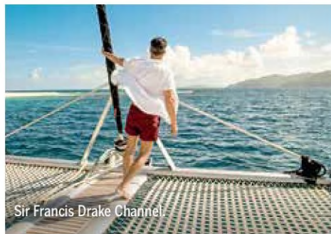
Sir Francis Drake Channel.

There is 10% hotel accommodation tax + 15% of service charges payable by guests who stay for six months or less in hotels, apartments, cottages, villas and similar accommodations. A service charge of 10–15% is common on restaurant bills and in some instances, may be included in the bill.