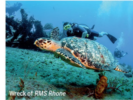
Wreck of RMS Rhone

The essence of the BVI lies in its endless water activities. With more than 100 spectacular dive sites, you may swim among dazzling sea life and sunken shipwrecks or snorkel through colorful coral gardens and reefs. More than 160 varieties of fish live in these waters, offering some of the most diverse catch in the Caribbean.