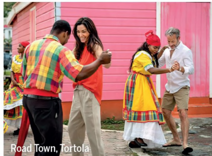
Road Town, Tortola

The past is tied to the present in the British Virgin Islands. Discover the secrets of notorious pirates, including Blackbeard and Captain Kidd, who sought refuge in the sheltered coves. Explore the legacies of early settlers, from ancient Arawak tools to a 19th-century Cornish Copper Mine.