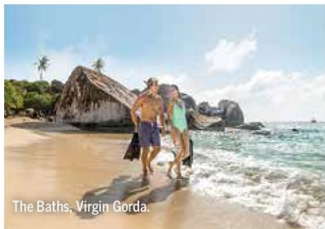
The Baths, Virgin Gorda.

The BVI is always on Atlantic Standard Time as there is no daylight saving time.