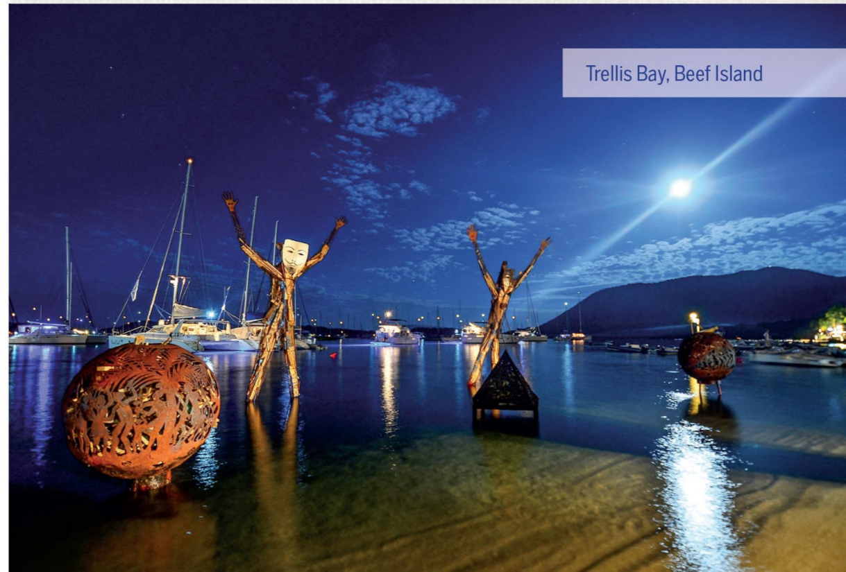
Trellis Bay, Beef Island