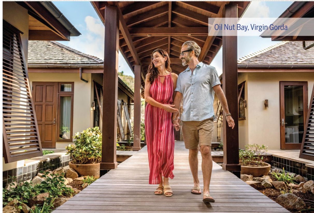
Oil Nut Bay, Virgin Gorda