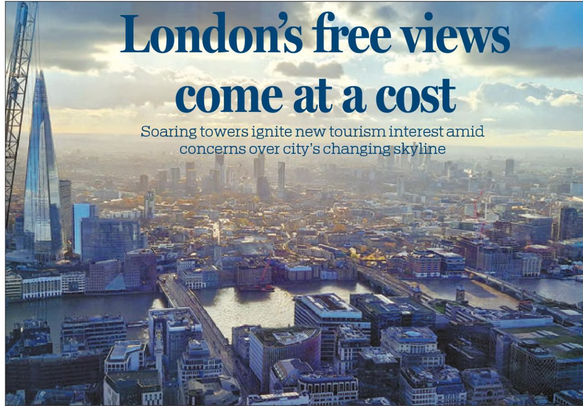
Towers in the City of London provide stunning views looking out across the river to south London.

"The (62-meter-high) Monument, commemorating the Great Fire of London, opened in 1677 and was the