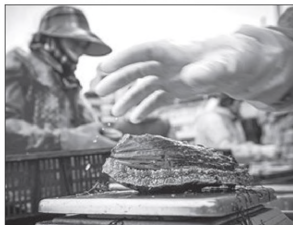
A palm-size abalone.

“The color is very special. It's blue-green, even with a little purple. We hope to provide a new product for China's seawater pearl industry.”