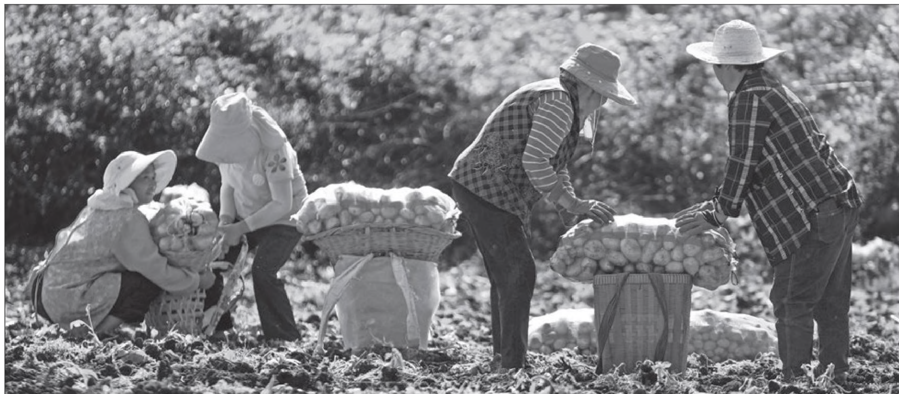
Farmers carry early maturing potatoes and load them onto trucks in Qianxi county, Guizhou province, on May 3. The county has been working on developing early maturing potatoes to meet the needs of the market, bringing stable income for local farmers. Potatoes hold significant importance as a staple food in China.