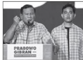
Indonesia's Defense Minister and leading presidential candidate Prabowo Subianto (left) delivers a speech with his running mate Gibran Rakabuming Raka in Jakarta on Wednesday.

Widodo, who has been serving as president for 10 years, is stepping down from his post later this year