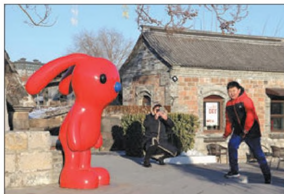
Tourists visit Yanshen Ancient Town, home to 13 abandoned ancient round kiln sites, on Jan 23.