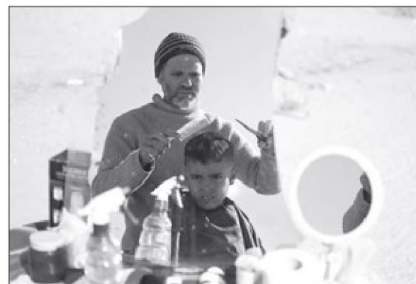
A child gets a haircut in Rafah, Gaza, on Wednesday as Israeli strikes displace Palestinians from their homes.

German Foreign Minister Annalena Baerbock said before talks with Netanyahu that people in Rafah with nowhere to go "cannot simply vanish into thin air".