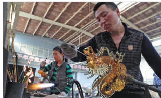
Left: Workers at Jinxiang Glass Studio soften and reheat glass on Jan 23. Right: Workers at Xiye Workshop create dragon-shaped glass art pieces on Jan 23.

G lass art is a precious cultural heritage in Zibo's history and a vibrant calling card for the city in East China's Shandong province. "World-class glass art is found in China, and the best of China's glass art is in Boshan," referring to the exquisite, delicate, and subtle nature of Boshan's glass art in Zibo, which uses similar materials to create glass that looks like pearls and jade, with colors like flowing clouds. In 2008,