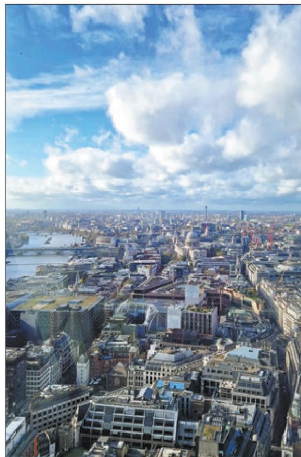
The panorama shows the River Thames snaking westward to Westminster and the Houses of Parliament.

Soaring towers ignite new tourism interest amid concerns over city's changing skyline