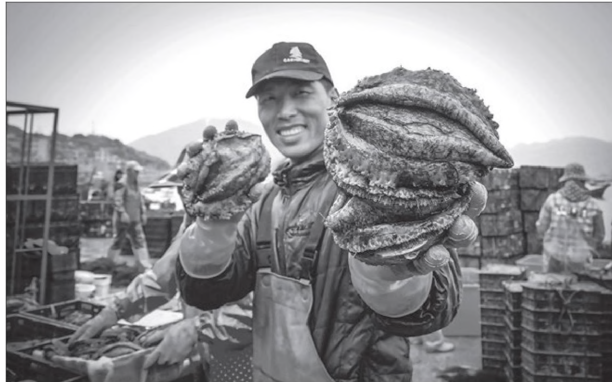
Fisherman showcases abalones in Lianjiang county, Fujian province.

According to a report by the Huajiang Industrial Research Institute, abalone consumption in China