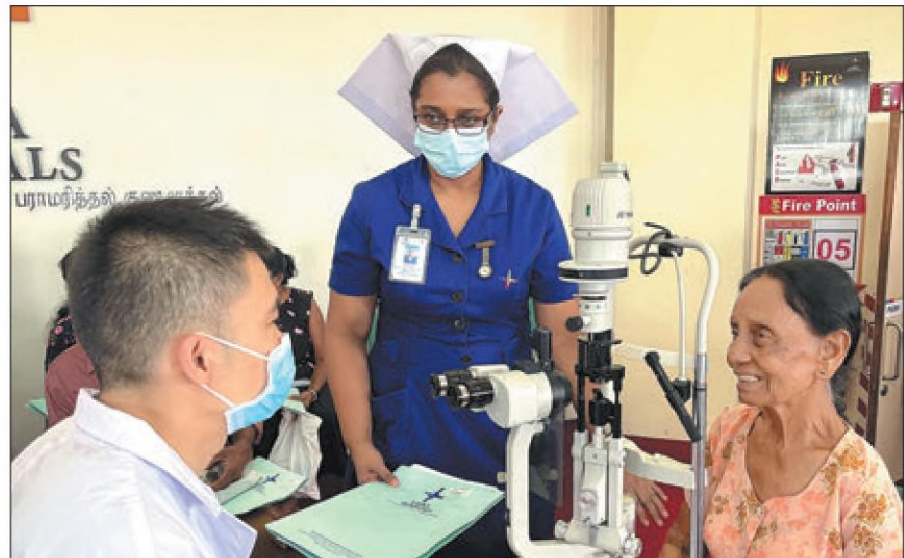
A Chinese doctor talks with a patient before a cataract operation in Sri Lanka.

jects, participants in the small ones are more diverse, as they involve government agencies, overseas Chinese companies, civil society organizations and non-governmental organizations.