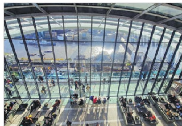
A view of an always-busy bar at the top of the Sky Garden, also known as the Walkie Talkie.

it was "just a bit of coincidence that we've had so many so tall buildings go up in such a short time that we now have a cluster."