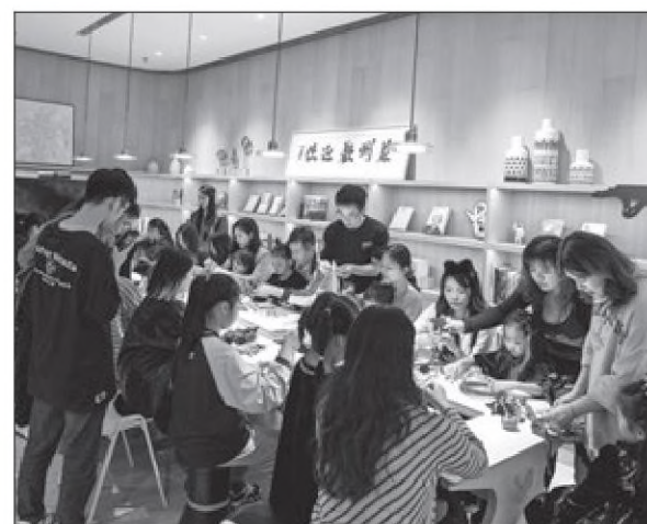
Right: Nio car owners participate in an event in Suzhou, Jiangsu province, in October.

He said the online platform has distinguished producers of new energy vehicles from traditional automobile enterprises.