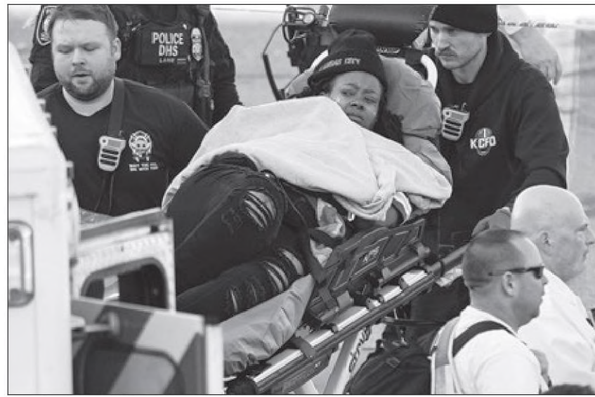
An injured person is taken to an ambulance following a shooting at a Super Bowl celebration event in Kansas City, Missouri, on Wednesday.

Contact the writers at prime@chinadailyapac.com.