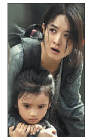
A poster for the film Article 20 shows actress Zhao Liying portraying a deaf-mute mother. The movie has sparked discussion about the legal concept of justifiable self-defense.

www.chinadailyglobal.com Member of ANN ASIA NEWS NETWORK