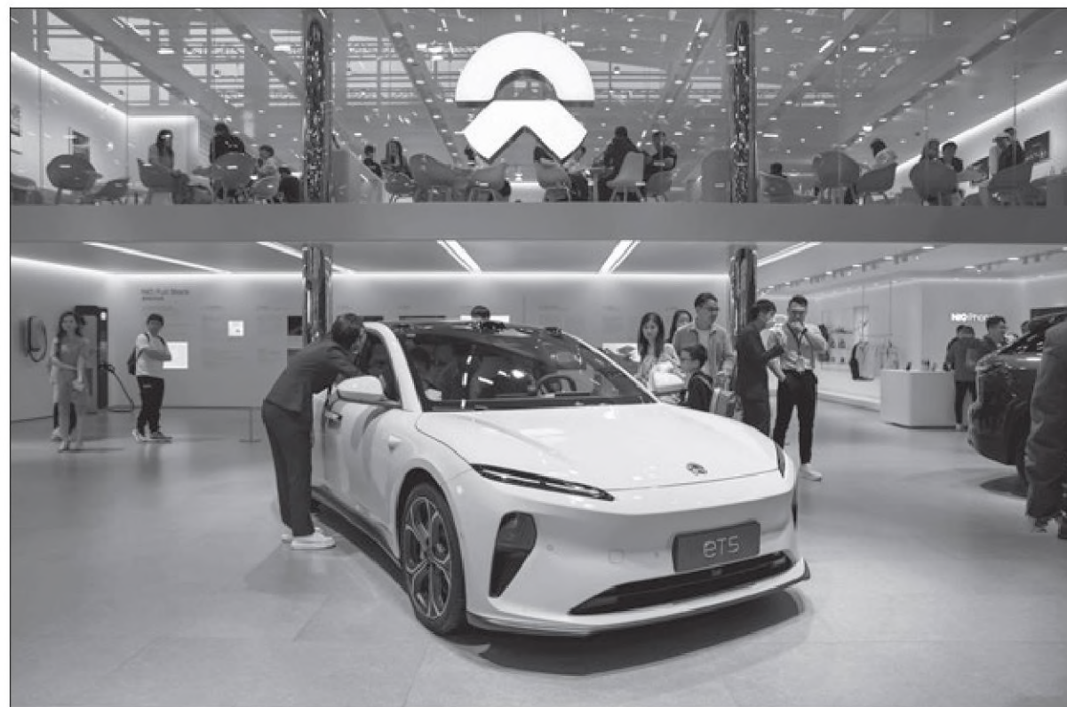
Visitors check out a Nio electric vehicle during an auto expo in Guangzhou, Guangdong province, in November.