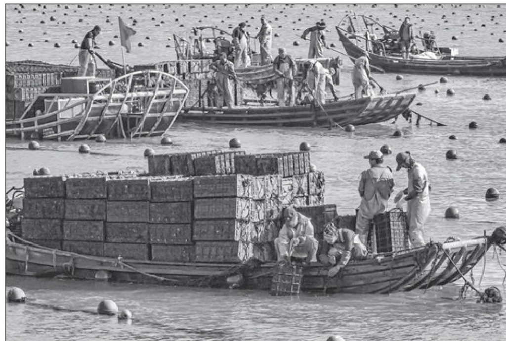
Workers load abalones onto a ship bound for Fujian for the winter in an aquaculture area in Lidao township, Rongcheng city, Shandong province, on November 15, 2023.

Lianjiang county in Fujian province has revolutionized farming of the mollusk to create a thriving industry and affordable delicacy