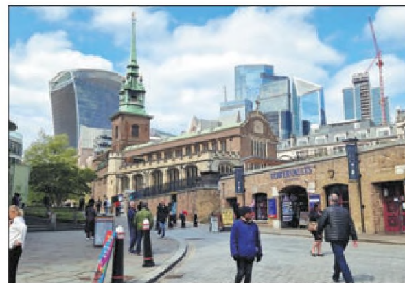
The skyline around the once-prominent Tower of London has become increasingly crowded in recent years.