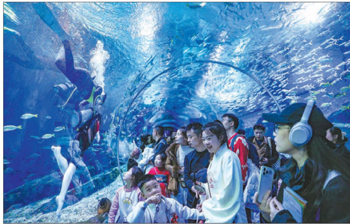
Tourists enjoy the underwater wonderland at an ocean park in Wuhan, the capital of Hubei province, on Tuesday. Consumer spending during the ongoing Spring Festival holiday is setting a vibrant tone for the year ahead.