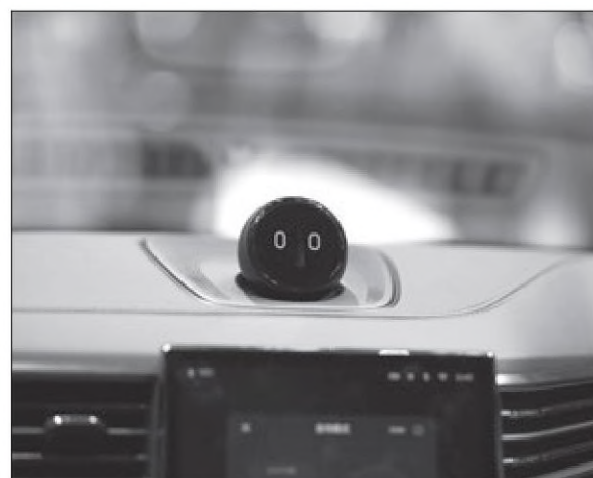
Left: Nio's in-vehicle smart assistant is seen during an auto expo in Beijing in September 2020.