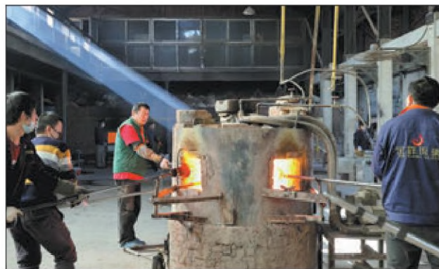
Above: Workers at Jinxiang Glass Studio shape glass art pieces on Jan 23.