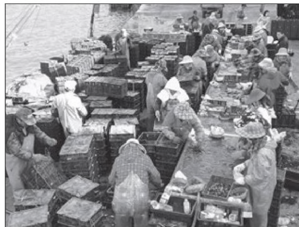
Abalone seedlings in Lianjiang county, Fujian province, in January 2022.

"It's a must-have dish during Spring Festival. In the high-end market in Jinan, abalone costs 120 to 140 yuan per kilogram, with four