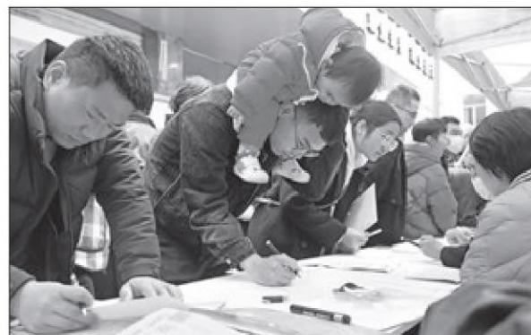
Job seekers, including a father with his baby, register for work positions at a job fair held in Taizhou, East China's Zhejiang province, on Thursday.