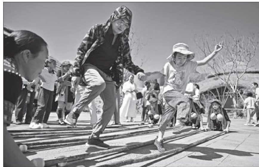
Tourists experience the local bamboo dance with residents of Maona village, Hainan province, on Wednesday, in celebration of Spring Festival.

Contact the writers at tanyingzi@chinadaily.com.cn