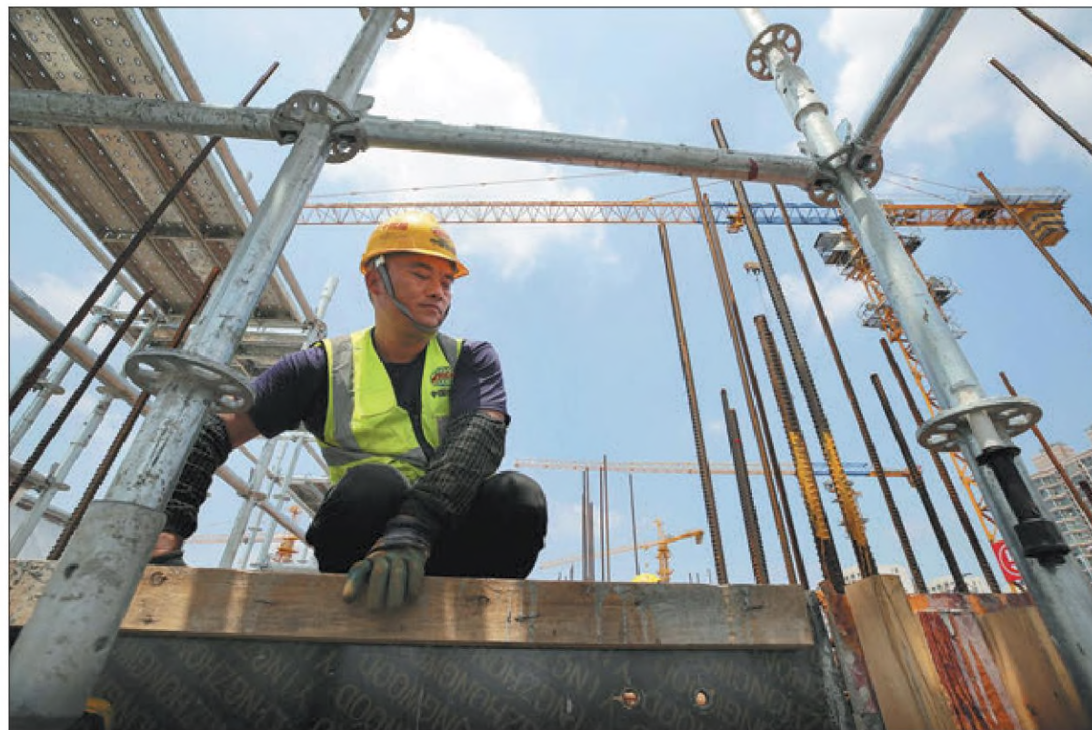
A worker seen at a housing redevelopment project at the Pengyi Community in Shanghai.

With the nation's high-quality development progressing steadily, Tao's Peach Blossom Spring could well be acquiring dimensions of reality.