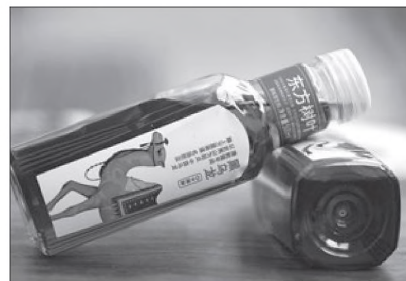
A file image of Oriental Leaf, a sugar-free tea beverage of Nongfu Spring, a Chinese beverage company. Sugar-free products such as Oriental Leaf have been gaining popularity in China in recent years.

Hong Kong-based Jebsen Group entered the wellness beverage market in China last year with the introduction of Remedy Kombucha, a sugar-free tea-based beverage.