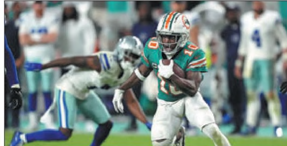
Tyreek Hill (left) of the Miami Dolphins and Patrick Mahomes of the Kansas City Chiefs are among the NFL stars that have expressed an interest in playing flag football at the 2028 Los Angeles Olympics.

The standard style of the game is five-on-five with no linemen. It's played on a field that's 50 yards (46 meters) long — along with 10 yards