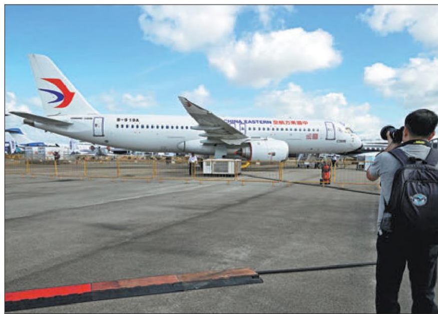
A C919 passenger jet is displayed at the Singapore Airshow in Singapore.

"By demonstrating the good performance of the aircraft models to its potential customers, COMAC hopes to gain more potential