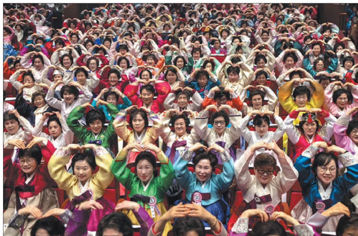
Graduates make heart signs with their hands at a high school graduation ceremony in Seoul, South Korea, on Tuesday. The school offers elementary and secondary education courses to female learners over the age of 40 who were unable to complete their studies on time for various reasons.