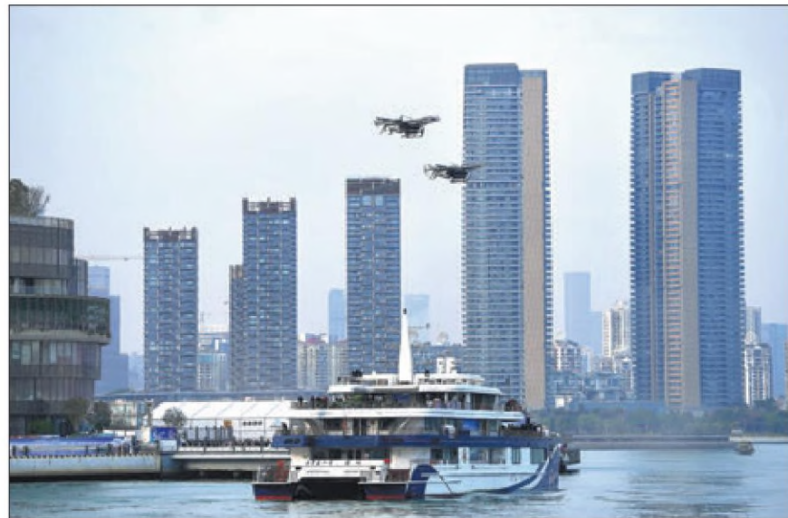
Two five-seater Shengshilong electric aircraft fly from a port in Shenzhen, Guangdong province, on Tuesday. After a 20-minute flight, they arrived in Zhuhai, marking the first demonstration flight of the cross-sea and cross-city route for vertical takeoff and landing electric aircraft.