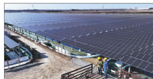
Technicians check photovoltaic power facilities in Yixing, Jiangsu province.

The company will also accelerate the construction of hydropower projects in the country's southwest regions this year, to further alleviate local supply-demand imbalances while optimizing the local power structure and ensuring stable power supply, it said.