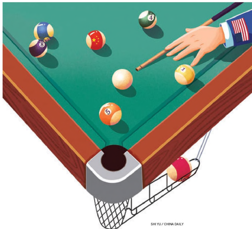
SHI YU / CHINA DAILY

The ROK is a "structural power" which endows the nation with an influence that's beyond its real strength. The country's policy decisions have a big impact on the relations among regional nations and combination of power. The ROK has deep-seated political divisions, with the progressive party and the conservative party having taken divergent stances on many issues such as the control of its military forces in times of war, the transformation of