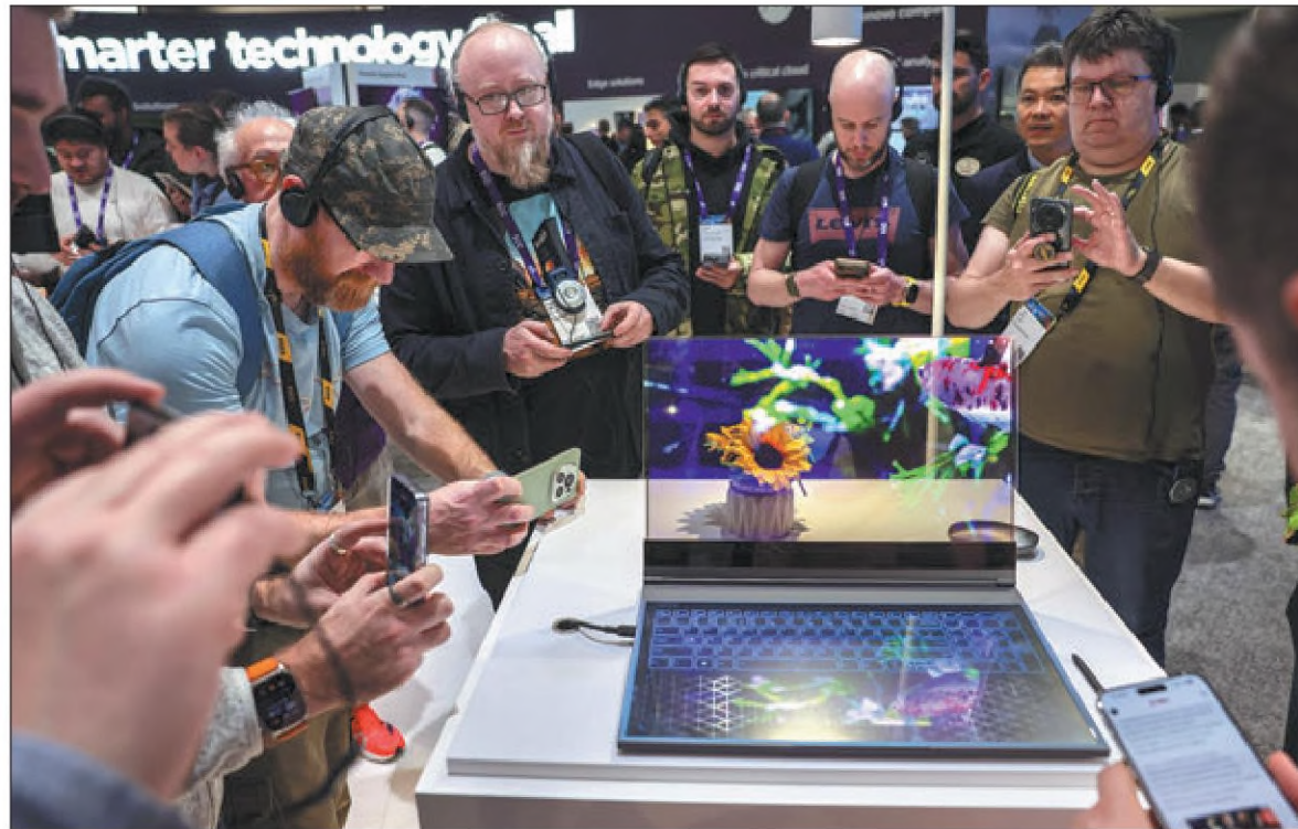
Visitors photograph a concept model of a ThinkBook laptop featuring a transparent display at the Lenovo Group booth during the Mobile World Congress in Barcelona, Spain, on Monday. The event runs from Monday to Thursday.

GLOBAL EDITION 中国日报 WEDNESDAY, FEBRUARY 28, 2024