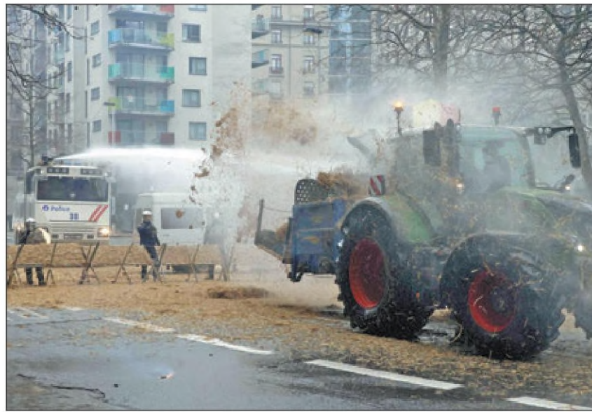
A tractor discharges hay onto Belgian riot police officers in Brussels on Monday during a protest called by farmers' organizations.

Xinhua and agencies contributed to this story.