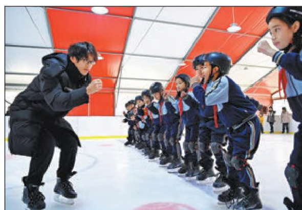
Students take skating lessons on an ice rink at a primary school in Tianjin on Jan 10.

"I really enjoy seeing the promotion of winter sports. There are many young talents in China. Keep going. It will be exciting."