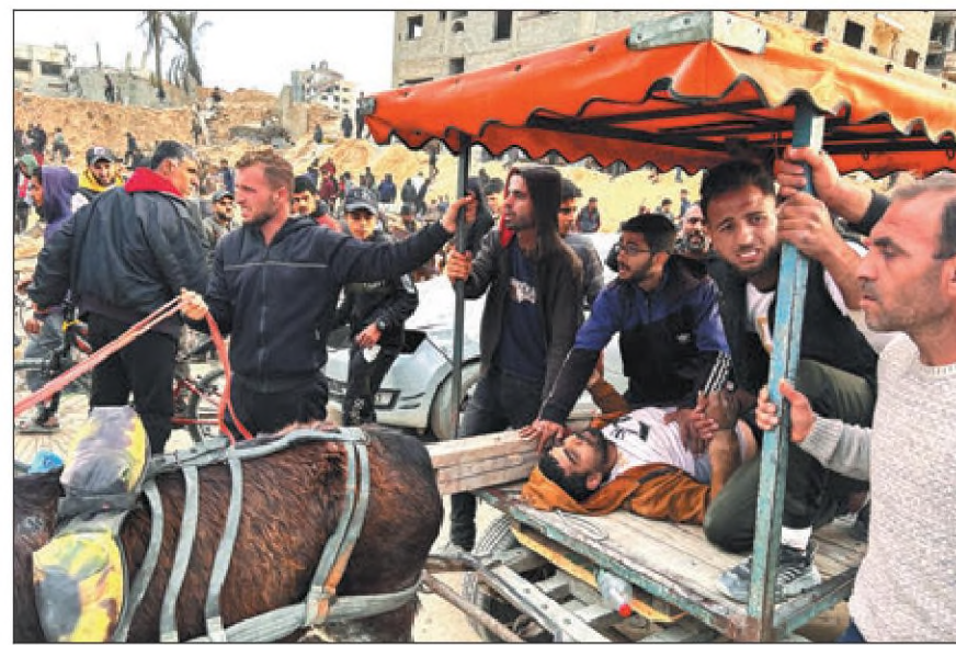
A wounded man lies on a cart as Palestinians gather to wait for trucks carrying bags of flour to arrive near an Israeli checkpoint in Gaza City on Monday.

Some of the profits from the restaurant go toward conservation of the creek's wildlife and mangroves.