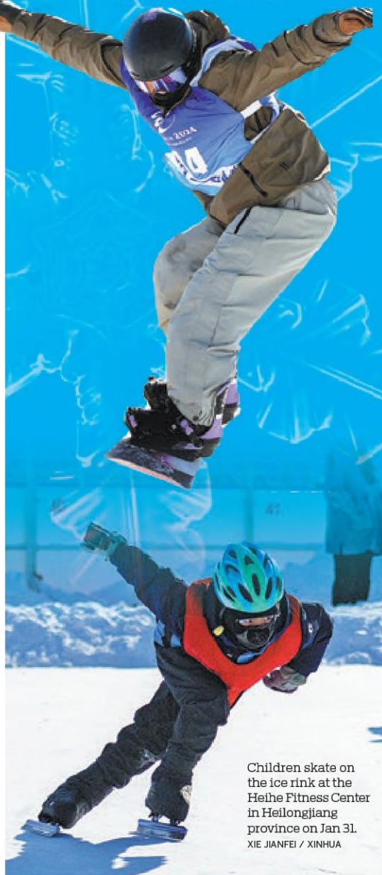
China's reigning Olympic champion Su Yiming and snowboarder Liu Haoyu compete during the recent 14th National Winter Games.