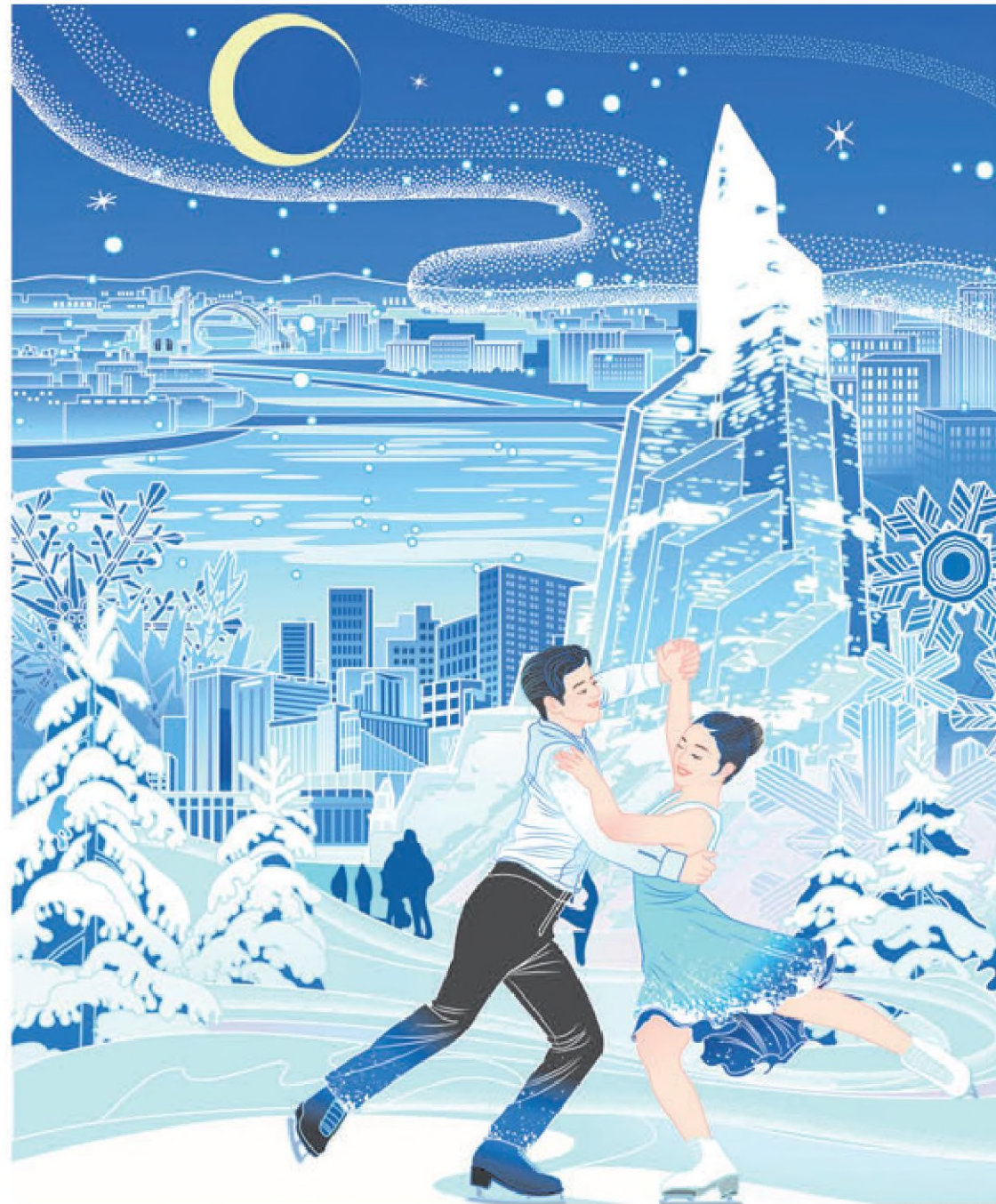
SHI YU / CHINA DAILY

A survey report from the Ministry of Commerce reveals that over 60 percent of consumer spending now happens during the night. Sales