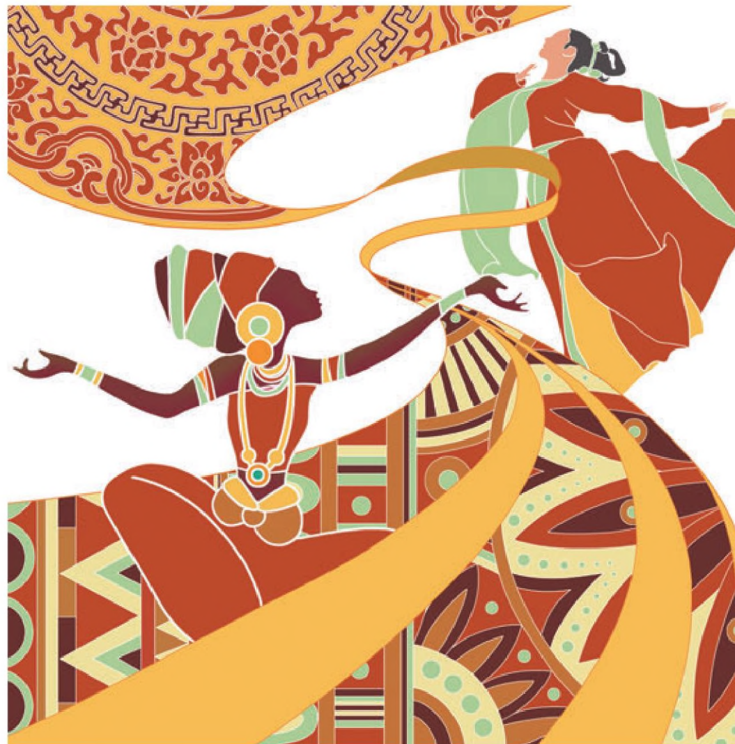
JIN DING / CHINA DAILY

The result will be a strengthened partnership, deeper bilateral cooperation, and a shared commitment to achieve development goals.