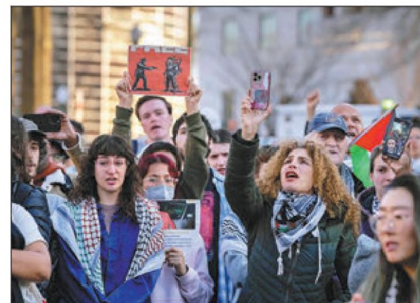
Demonstrators gather for a vigil outside the Israeli embassy in Washington, DC, on Monday. An active-duty member of the United States Air Force died after he set himself ablaze outside the embassy while declaring that he "will no longer be complicit in genocide". See story, page 7