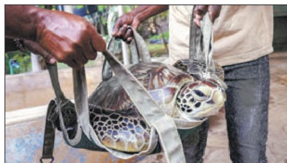
A rescue team releases an endangered sea turtle into the sea at the Watamu National Marine Park in Kenya in August.