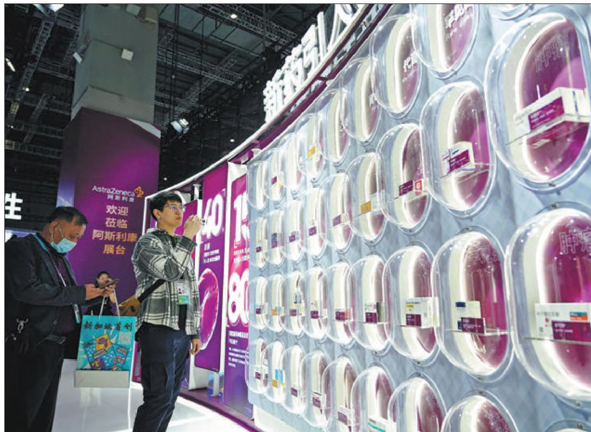
Visitors check out AstraZeneca products during the sixth China International Import Expo in Shanghai in November.