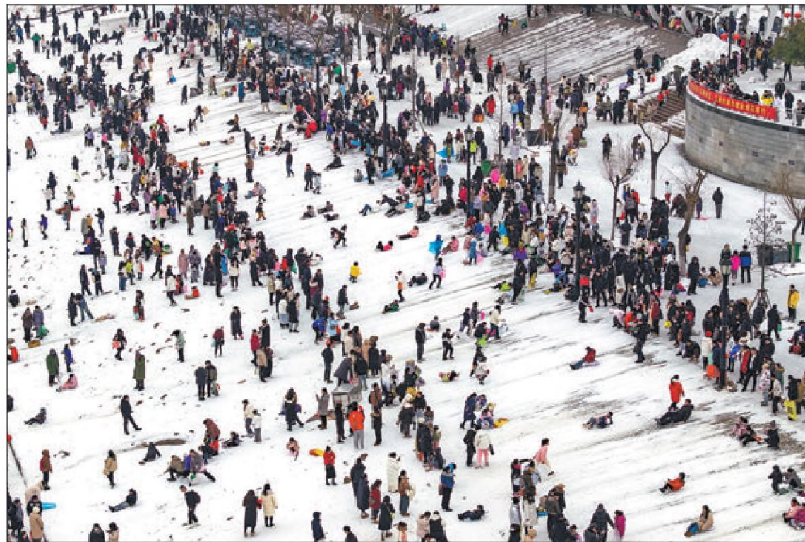
Thousands of people enjoy themselves on the waterfront of the Hanjiang River, a major tributary of the Yangtze River, in Wuhan, the capital of Hubei province, on Saturday after several days of heavy snowfall across the city.

challenged in Friday's final by runner-up Yang Wenlong from Anhui, an eastern province little known for its winter sports, shows that the gap between the best athletes and the chasing pack is closing fast.