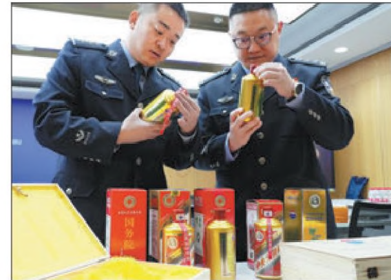
Police officers display seized counterfeit Moutai liquor at a news conference in Shanghai on Tuesday. Shanghai police disclosed a major case of producing and selling counterfeit Moutai liquor, arresting 52 suspects.