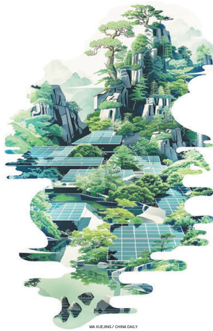
MA XUEJING / CHINA DAILY

By bowing to protectionist lobbying pressure, the US administration also signals that parochial commercial interests override existential planetary ones.