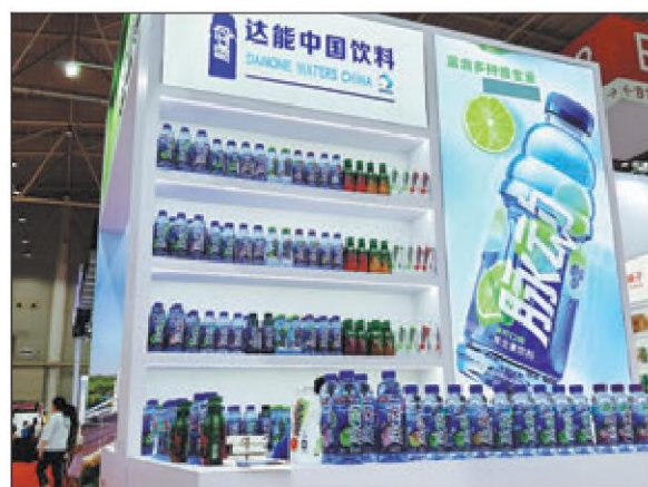
Danone's booth is seen during an expo in Wuhan, Hubei province, in June.

In 2023, the region of China, North Asia and Oceania saw Mizone bottled water and beverage sales of 692 million euros, up 14.1