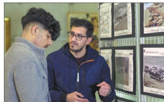
Two survivors of the Feb 26, 2023, shipwreck visit a photo exhibition on the disaster in Crotona, Italy, on Saturday.

On Feb 26 last year, a wooden boat departed from Türkiye carrying about 200 migrants and sank just a few meters off the coast of