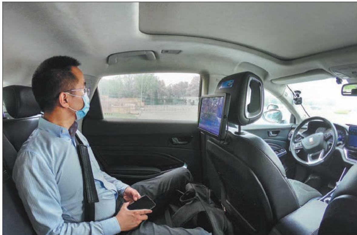
A passenger experiences a self-driving vehicle at Beijing Economic-Technological Development Area in Beijing on April 25, 2022.