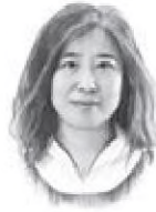
The author is director for Regional Cooperation and Integration and Trade, Asian Development Bank.

Given the complex workings of deeply interconnected global value chains, protectionist measures such as export bans, tariffs and subsidies create uncertainty, which in turn will discourage investments. They can also distort business incentives, create supply chain bottlenecks, and disrupt the flow of