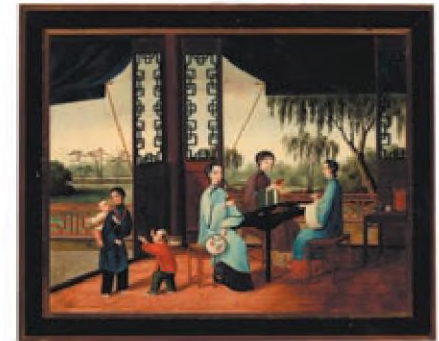
Poker Playing, by an anonymous painter.