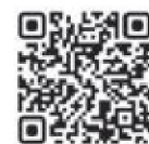
Scan the code to get Guide to Payment Services for International Visitors in Chengdu.