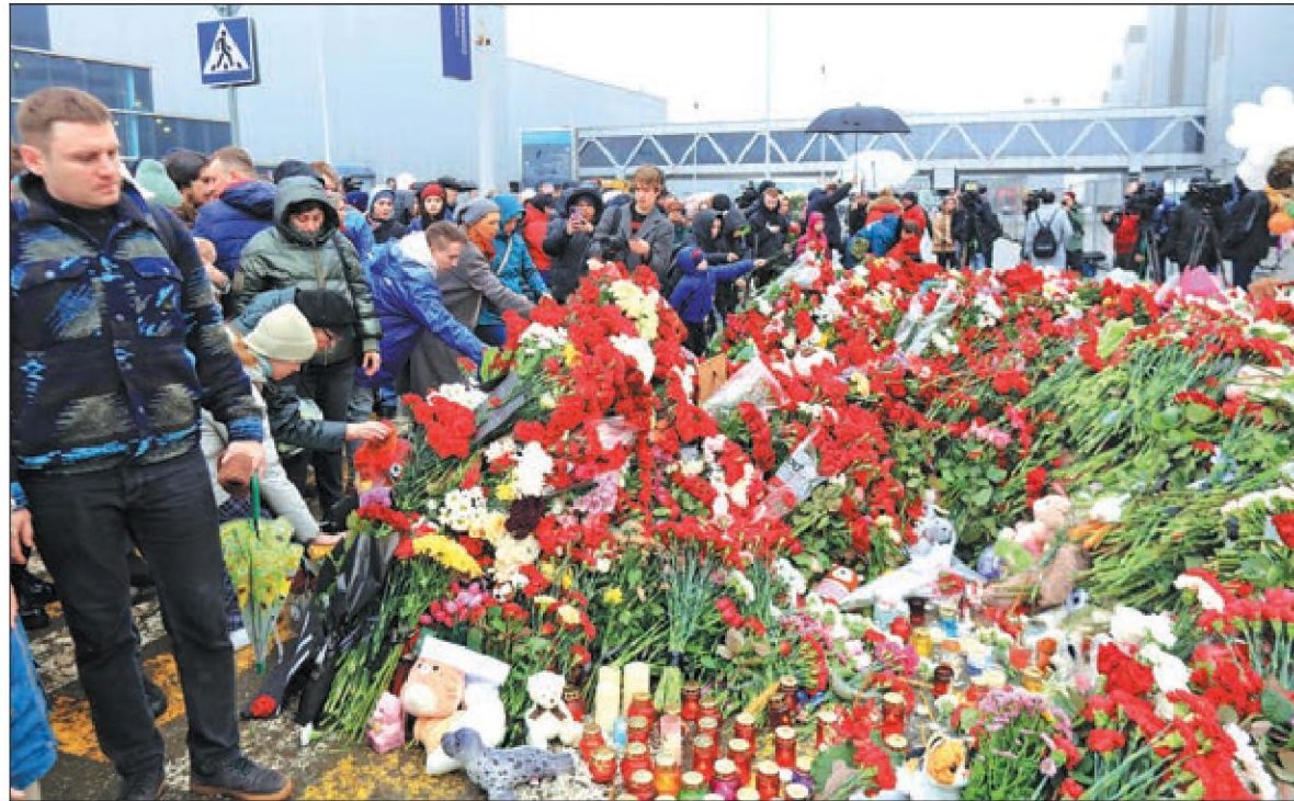
People lay flowers and mourn for victims near Crocus City Hall in suburban Moscow, Russia, on Saturday.

According to Russian state media Tass, four suspects were