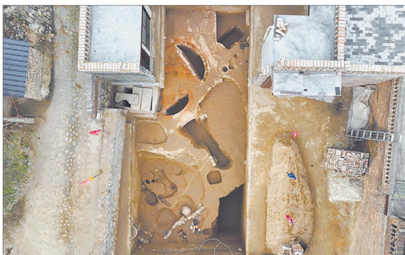
Left: An aerial view of the archaeological site in Chencun village.

Contact the writer at caihong@chinadaily.com.cn