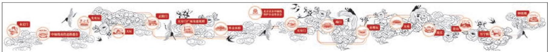
Seal carving illustrations of 15 heritage sites along the Central Axis of Beijing — such as the Palace Museum, Jingshan Park, and the Temple of Heaven — the core of the capital that stretches 7.8 kilometers from south to north. Unique stamps for these 15 sites have been designed and are included in a newly released “Beijing Central Axis passport”.