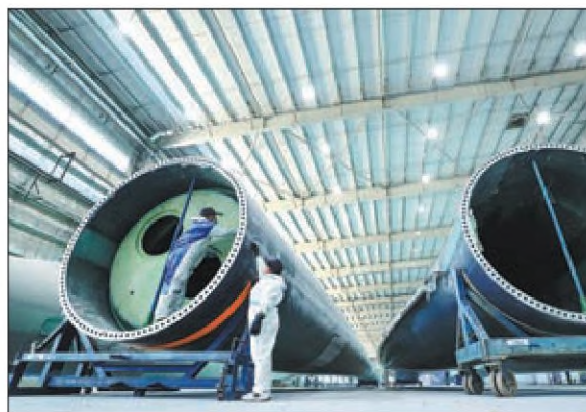
Employees use intelligent detection technology for quality-control tests on a rotor blade of a wind turbine at an industrial park in Zhangye, Gansu province, on March 7.

Report stated that China will give top priority to modernizing its industrial system and developing new quality productive forces at a faster pace.