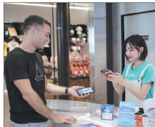
From left: Jiaozi Avenue in Chengdu in Southwest China's Sichuan province. A foreign tourist uses mobile payment while shopping in Chengdu.