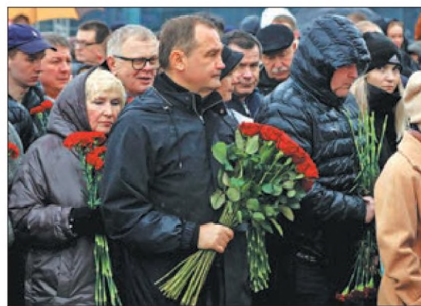
Russian citizens line up to pay tribute at the site of the attack in the northwest of Moscow on Sunday.

"Russia has assumed a pivotal role in the global fight against terrorism,