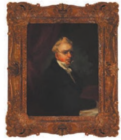
Self-portrait, by George Chinnery.