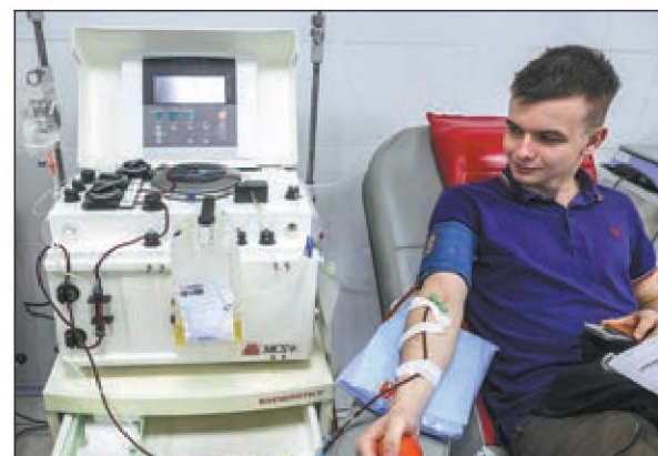
A man donates blood for people injured in the concert hall attack at a blood center in Moscow on Saturday.

By midday on Saturday, medical authorities said enough blood had been collected to help the wounded