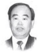
The author is a research fellow at the Chinese Academy of International Trade and Economic Cooperation.

Leading ROK tech companies such as NAVER and Samsung are demonstrating their technological prowess with innovative products like NAVER's HyperCLOVA X, which can be applied to search engines, online shopping, res-