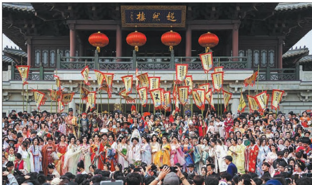
Hanfu enthusiasts pose in front of the Chaoran Tower during the Huazhao Festival in Jinan, Shandong province, on Saturday. A parade of hanfu fans that was part of the festival attracted people wanting to experience the charm of traditional Chinese culture. The Huazhao Festival, also known as the Flower Festival or Flower Deity Festival, is a traditional Chinese festival.