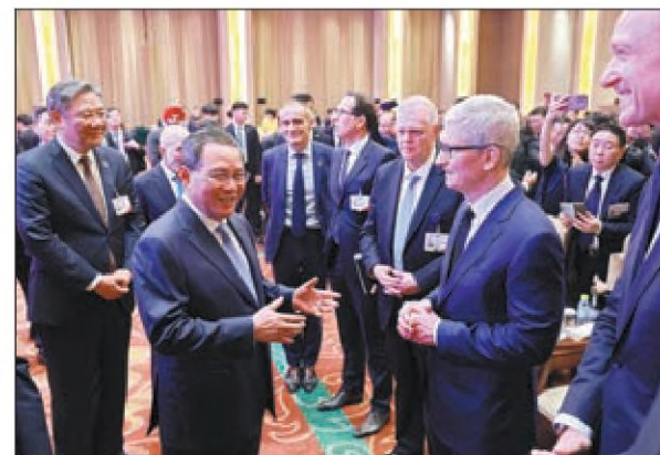
Premier Li Qiang (front, left) talks on Sunday with Apple CEO Tim Cook after the opening ceremony of the China Development Forum 2024 in Beijing. The theme of the two-day forum is "The Continuous Development of China".