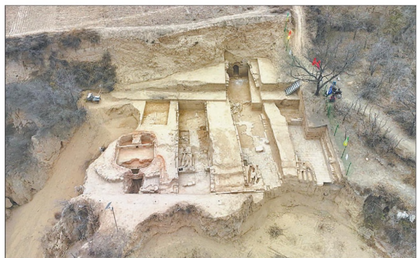
Right: Archaeological findings in Chencun shed light on porcelain kilns from the Ming Dynasty (1368-1644).