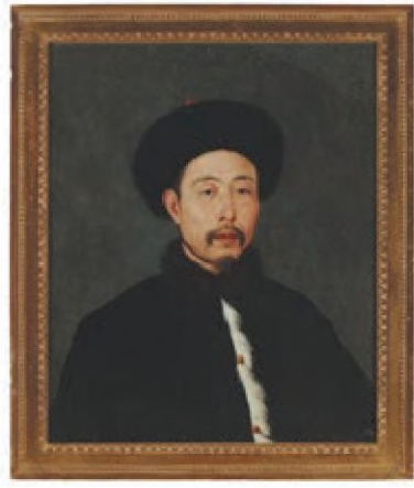
Portrait of Emperor Qianlong in Winter Suit, by Giuseppe Castiglione.