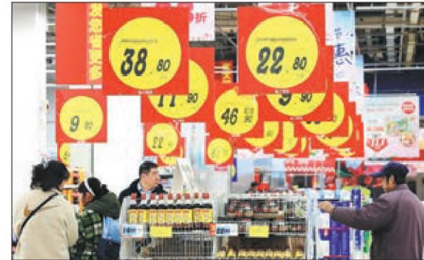
Consumers choose groceries at a supermarket in Nanjing, Jiangsu province, on March 9.