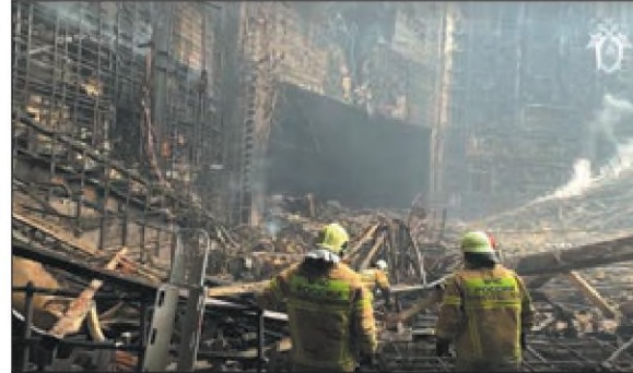
Firefighters work inside the gutted Crocus City Hall concert venue in suburban Moscow, Russia, on Saturday. Search operations continued inside the damaged building.

and their families during this tragic time," she said.