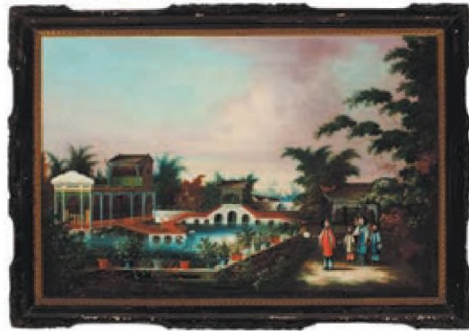
The Garden, by an anonymous painter.