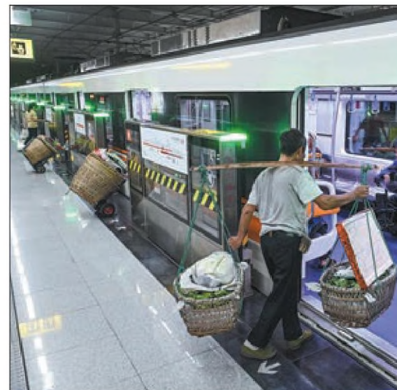
A farmer carrying baskets full of agricultural produce gets on a Line 4 subway train at Shichuan Station in Chongqing on Sept 20. The line has been dubbed the "Vegetable Basket Line".

Contact the writers at dengrui@chinadaily.com.cn