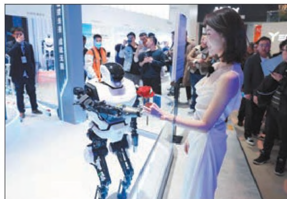
An AI-powered humanoid robot hands a rose to a visitor during the Appliance & Electronics World Expo in Shanghai on March 14.