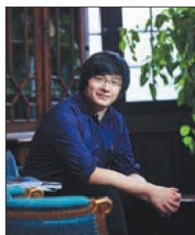
Top and above: Yu Lu conducts Beethoven's nine symphonies in five consecutive days, with the Ningbo Symphony Orchestra, in 2020.