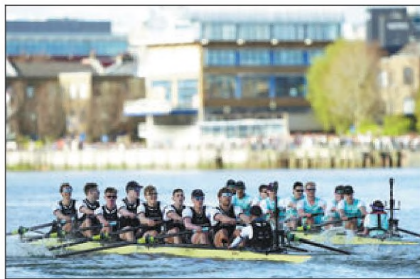
The Oxford and Cambridge rowing teams compete on Saturday during the 169th Men's Gemini Boat Race 2024 on the Thames River in London, the United Kingdom.