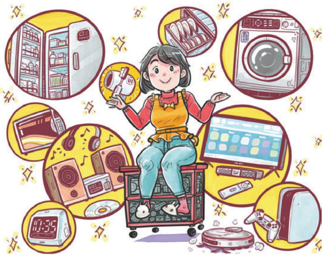
CAI MENG / CHINA DAILY

The rapid development of the digital economy is giving rise to new infrastructure