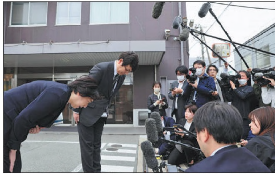
Employees of Kobayashi Pharmaceutical bow after government health officials inspected the plant in Osaka, Japan, on Saturday over deaths linked to the company's health supplements.

China could transparently show that Beijing, not Washington, is the victim of noncompliant trade and investment measures and back its political narrative with a third-party legal finding of impeccable authority, the WTO panel's legal finding, he said.