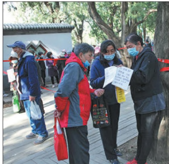
Parents review the resumes of their adult children in an effort to find suitable partners for them at a matchmaking corner inside Zhongshan Park in Beijing on April 16.