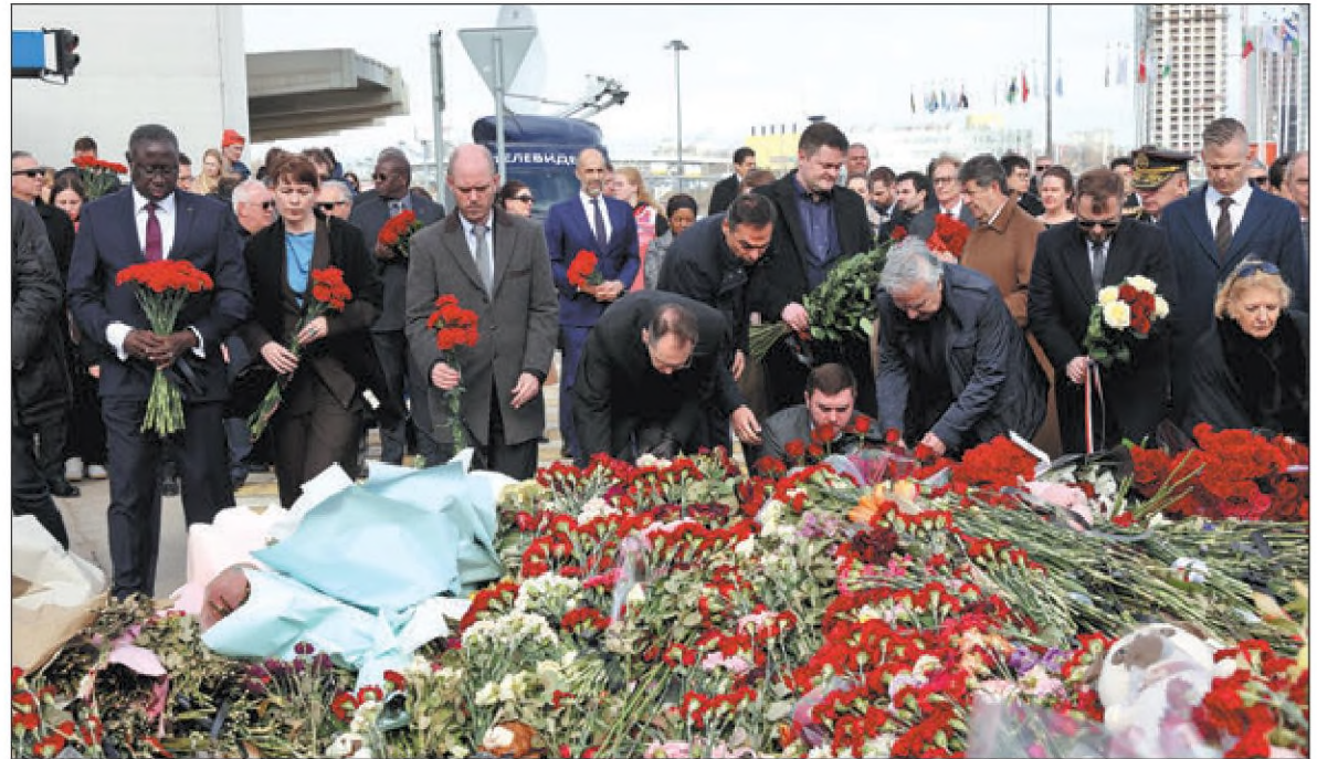
Ambassadors and other staff members of foreign diplomatic missions in Russia attend a flower laying ceremony on Saturday at a makeshift memorial in front of the Crocus City Hall on the western outskirts of Moscow, in memory of the victims of the March 22 terrorist attack at the concert hall.