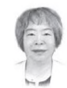
The author is a professor at the Japan Institute of Hebei University.

First, the concentration of higher education institutions in the capital makes their relocation to Xiong'an a scientific decision. Beijing is home to more than 90 universities, including 34 universities included in the "doubled world-class project" that account for nearly a quarter of the national total. These universities are concentrated in Haidian, Chaoyang and Changping districts of Beijing, with the three districts collectively accounting for 60 percent of the universities in the capital and hosting most of the universities directly affiliated with the Ministry of Education. As such, the establishment of branch campuses of the 15 universities in