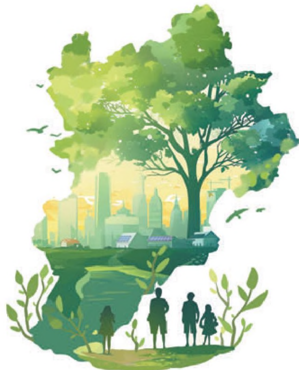
MA XUEJING / CHINA DAILY

As for Xiong'an, the investment in the development of the "city of the