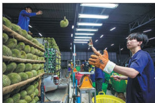
Workers sort durians on Sept 18 in Chumphon, Thailand. According to Thailand's Commerce Ministry, China was Thailand's largest export market for durians in 2023.