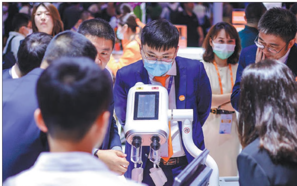
Visitors gather at the booth of Carestream Health Inc during a medical equipment exhibition in Shanghai in 2023.