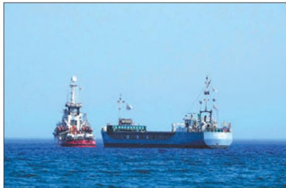
A cargo ship (right), and a ship loaded with food destined for Gaza prepare to set sail outside a Cypriot port on Saturday.