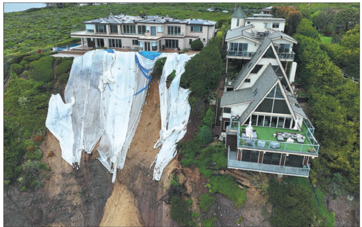
An aerial view reveals protective tarps attempting to thwart continued landslides below three cliffside homes in Southern California, where a landslide occurred in early February as winter storms brought more heavy rain to the region on Saturday.