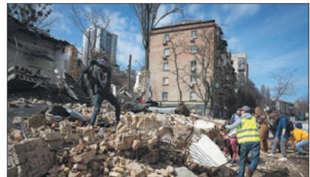
Volunteers and students clear the rubble of destroyed buildings in Kyiv on Saturday.

Ukrainian President Volodymyr Zelenskyy said in an interview published on Friday that if Ukraine does not get promised US military aid blocked by disputes in Congress, its forces will have to retreat "in small steps". France's defense minister said