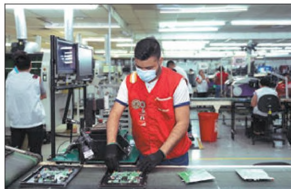
Top: Visitors try out Huawei products during a new product release in Barcelona, Spain. XINHUA Above: Employees work on the TV production line of TCL in Brazil.