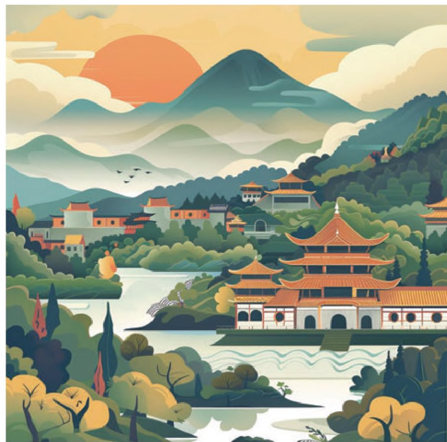
WANG XIAOYING / CHINA DAILY

First, it should speed up the construction of major international corridors. Special attention should be given to transport, logistics, energy and digital connection with its southern neighbors so Yunnan can play a role as a gateway to the vast market of South and Southeast Asian nations. The good momentum of the operation of the China-Laos Railway should be maintained and connectivity in norms and standards with the China Railway Express should be promoted so as to accelerate the improvement of passenger and cargo transportation capabilities. The China-Myanmar and China-Vietnam railways and expressways, as well as the development of China-Myanmar land-water intermodal transport corridors, should be advanced to create multi-dimensional international corridors. Yunnan can also build Kunming into a hub city for international trains and create an international comprehensive transportation gateway