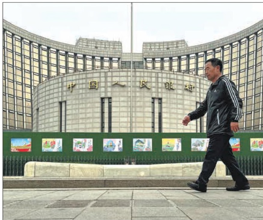
A pedestrian walks past the headquarters of the PBOC in Beijing.

Hong said the ultra-long-term special treasury bond issuance represents a meaningful expansion in the fiscal deficit that the market is looking for, which will help rejuvenate the