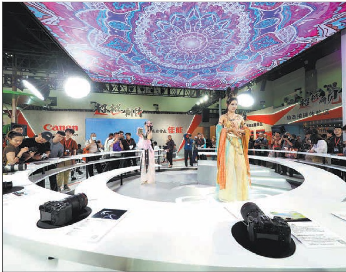
Visitors check out Canon products while performers wearing traditional Chinese apparel stage a performance during a camera expo in Beijing on Friday.