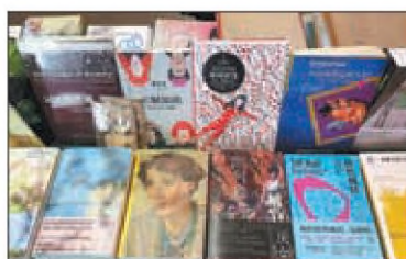
Above: Two women embrace following a talk event in the bookstore. Left: Book titles on display in La Otra.

where numerous gender barriers need to be broken down," the 29-year-old says.