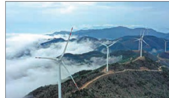
A view of a wind farm in Taizhou, Zhejiang province.

Notably, China's exports to regions such as Southeast Asia, Latin America and Central Asia have maintained rapid growth since the beginning of the year, effectively