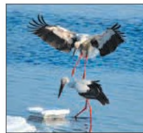
The two storks feed on fish in the Songhua River in Harbin.

Because the drone could only carry 0.4 kg of fish at a time, Yang had to repeat the process more than 10 times to feed the birds. The task was especially difficult because of the frigid cold. "Temperatures could