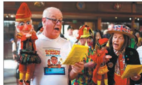
Puppeteers attend the May Fayre Puppet Service at St Paul's Church in Covent Garden, London, on Sunday. It is a traditional puppet show in the country.