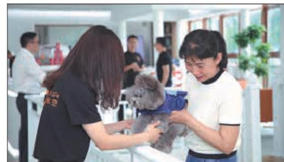
Workers look after a dog at the pet lounge at Shenzhen Bao'an International Airport in Guangdong province.

Subtropical Guangdong is the largest litchi base in China, producing 1.3 million tons of litchi a year — more than 50 percent of the country's output.