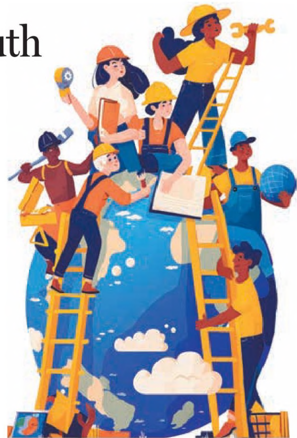
MA XUEJING / CHINA DAILY

The countries of the Global South could consider not only stepping out the training of globally competent talents, but also actively provide international organizations, transnational corporations and NGOs with excellent talents in global governance, so as to enable them to represent the Global South in the reform and construction of the global governance system at all levels and in all areas of the international community.