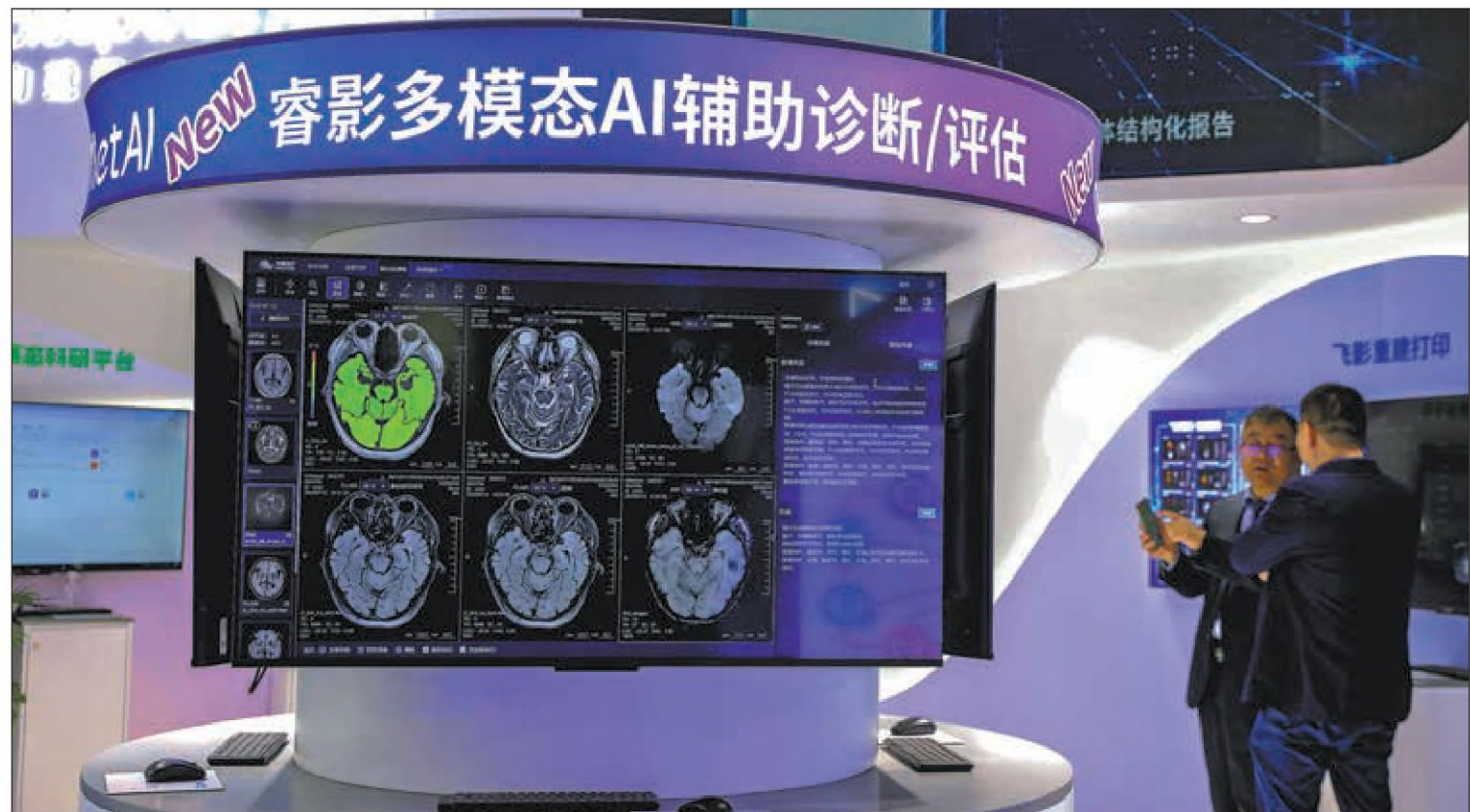
An artificial intelligence-aided diagnostic system is displayed during the 2024 China International Medical Equipment Fair in Shanghai in April.

The academy also aims to combine efforts to develop innovative topic studies and conceptual models ranging from screening and diagnosis to treatment. AI solutions are