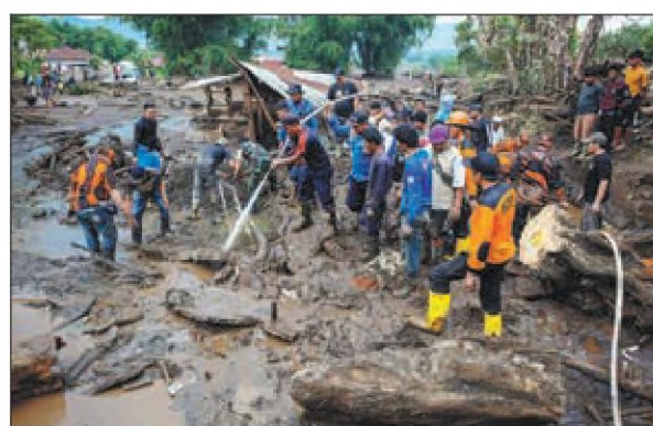
Rescuers work in a damaged area after a cold lava flood in West Sumatra, Indonesia, on Sunday.