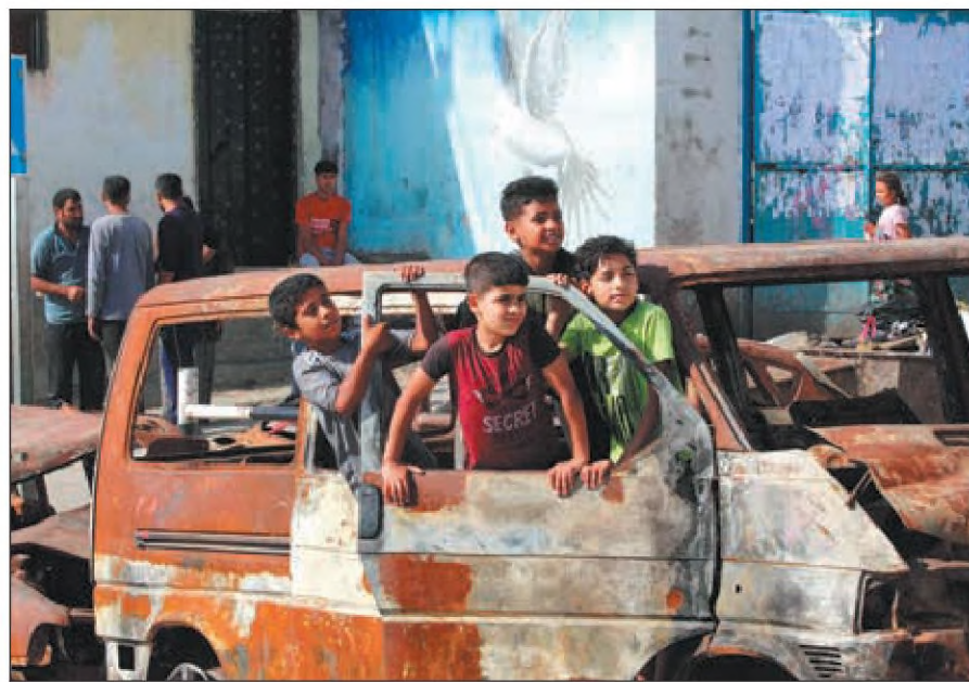
Children play in a charred van in Rafah in the southern Gaza Strip on Sunday amid the ongoing conflict between Israel and the Hamas militant group.

The Gaza conflict, he added, provided an opportunity for China to find common ground with other