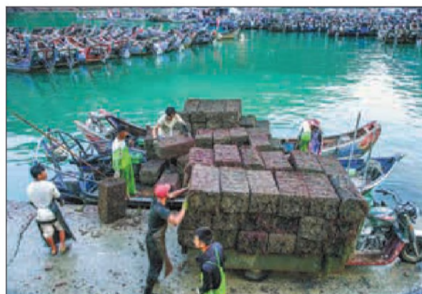
Farmers harvest abalone bred at a fish farm in Lianjiang county, Fujian province, in 2022.