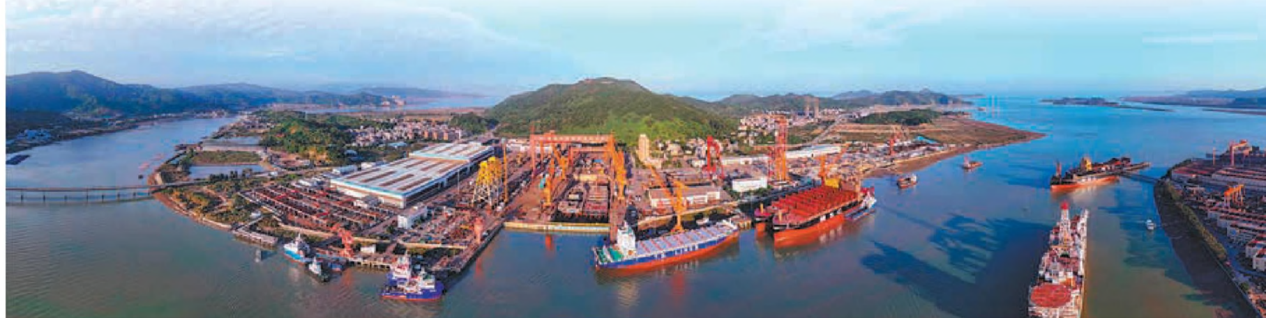
A national fishing industry base is seen in Lianjiang. Officials are now looking at locating fish farms farther off shore to keep shipping lanes clear and protect the environment.

Contact the writers at lilei@chinadaily.com.cn