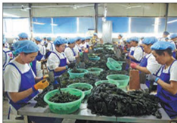
Workers sort kelp for processing at a factory workshop in Ningde in March.