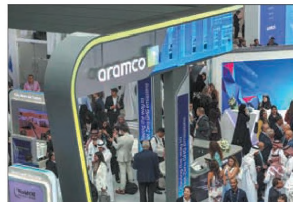
Visitors gather at Saudi Aramco's booth during an expo in Abu Dhabi, the United Arab Emirates.

"In line with Saudi Vision 2030 as well as the Belt and Road Initiative, we expect additional investments and an enhanced presence to meet the demand for refined products, chemicals and lubricants. This also includes entering into new partnerships in logistics, procurement and supply chain, among other areas of investment," he said.