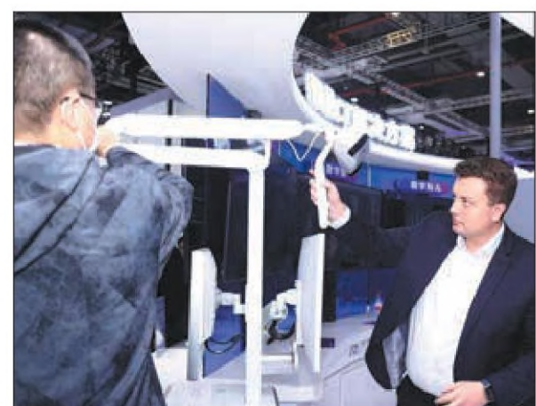
A visitor (right) checks out Shukun Technology's artificial intelligence assisted diagnostic system at the 2024 China International Medical Equipment Fair in Shanghai in April.

"Industry-university-research institutions are encouraged to