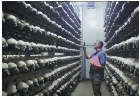
From left: A fish farmer selects fish for his customers in Ningde, Fujian province; in a smart incubator in Gutian county, Fujian, silver ear fungi grow on cultivation rods made from cottonseed shells; a visitor takes photos of silver ear fungi on shelves in the incubator in Gutian.