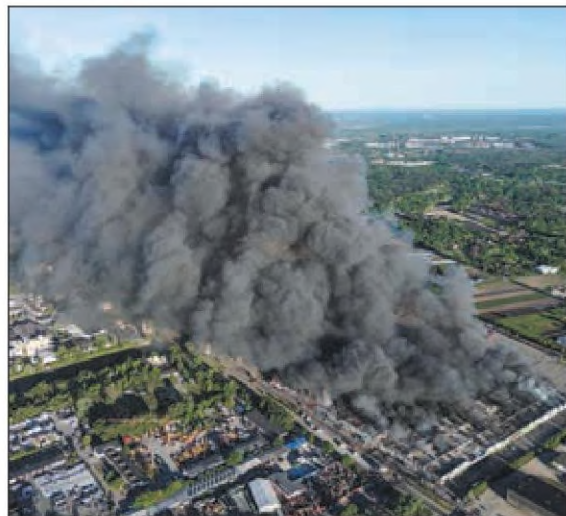
A fire burns out of a vast shopping complex in Warsaw, Poland, on Sunday. The fire broke out on Sunday morning in the complex that housed some 1,400 shops and service outlets.