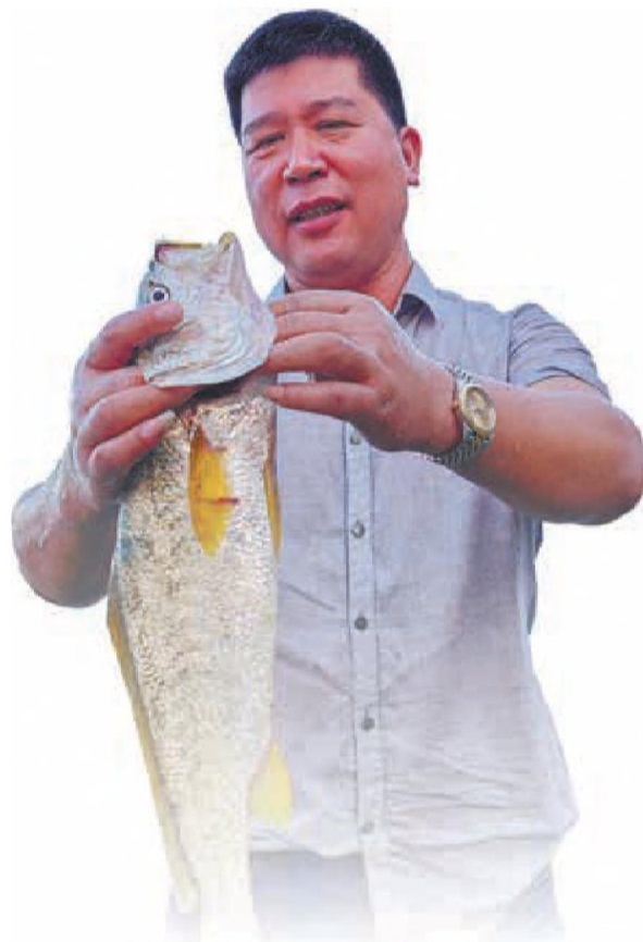
A large yellow croaker cultivated in Ningde is displayed.

Thanks to new technologies and other improvements, Ningde now produces 440,000 tons of silver ear fungus each year — more than 90 percent of the national yield.