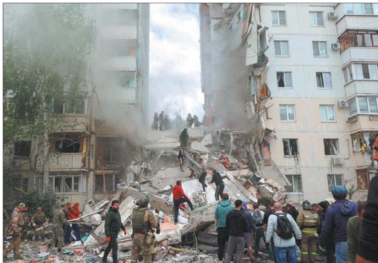
Rescuers search for survivors on Sunday in the debris of a partially collapsed residential building in Belgorod, Russia. At least 15 people were killed and many others injured when the 10-story apartment block in the border region was struck by a missile fired by Ukraine, Russian authorities said. AFP See story, page 7