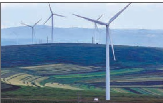
Rows of wind turbines stand on the Huitengxile Grassland in Chahar Youyi Zhongqi, Ulanqab, Inner Mongolia autonomous region, in August.

"Inner Mongolia is the primary battleground for combating desertification and the front line defense