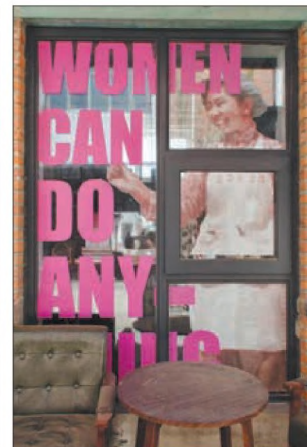
From left: The illustrated book We Are Artists is on display on a corner table in La Otra, a bookstore in Beijing. Images of remarkable women, who have defied social expectations and made extraordinary contributions, adorn the bookstore wall. At the entrance of the bookstore is an image of a working woman and an inspirational quote, "women can do anything", on the window.