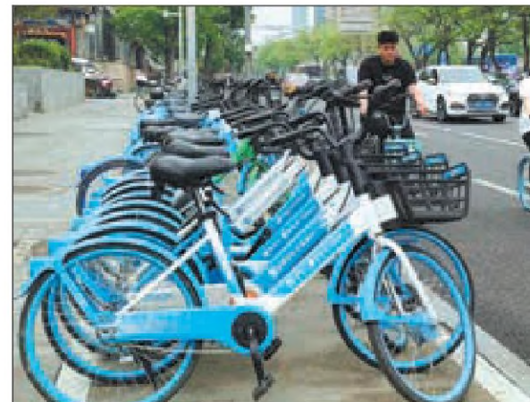
People ride past a row of Hellobike shared bikes in Beijing in April.

"Our core users are aged between 20 and 45 and the main usage scenarios include commuting, connecting to public transportation, and leisure and entertainment," said Chu.