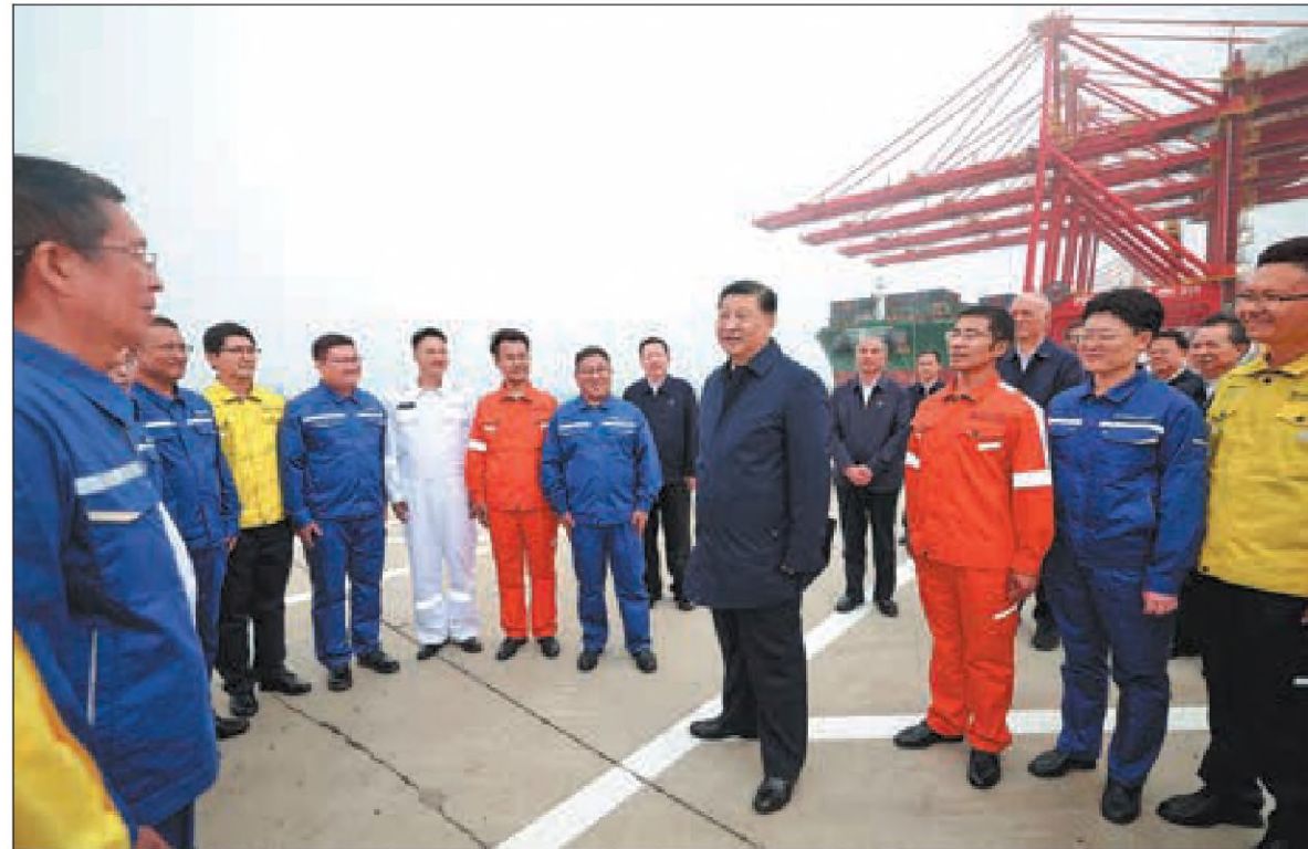
President Xi Jinping interacts with workers of Rizhao Port on Wednesday during a visit to Rizhao in Shandong province. He inspected the port and learnt about local efforts to promote the port's smart and green development.

Nine representatives and experts spoke at the symposium, offering opinions and suggestions on developing venture capital investment, upgrading traditional industries,