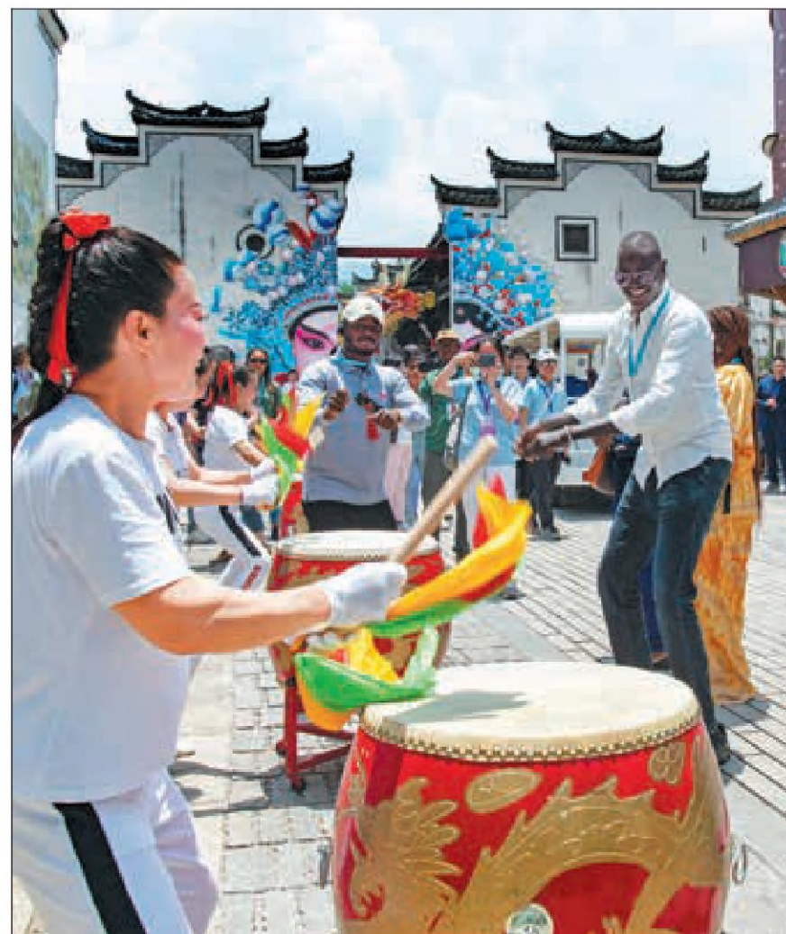
African youths dance as drummers play at the 8th China-Africa Youth Festival in Jinhua, Zhejiang province, on Thursday. The event, held from May 19 to 26 in Beijing and Jinhua, attracted nearly 100 African youths to see the progress China has made since the launch of the nation's reform and opening-up policy, thereby advancing exchanges and cooperation between China and Africa.