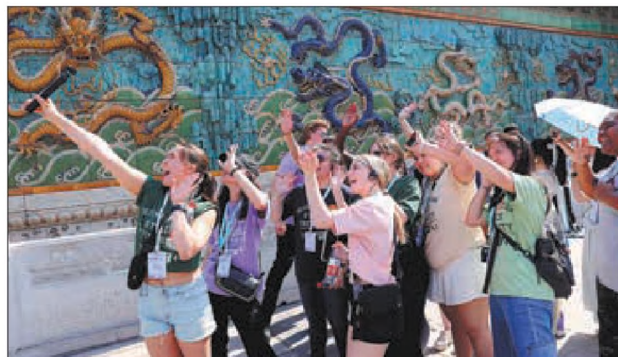
US students pose for a selfie in front of the Nine-Dragon Screen at the Forbidden City in Beijing on May 17.