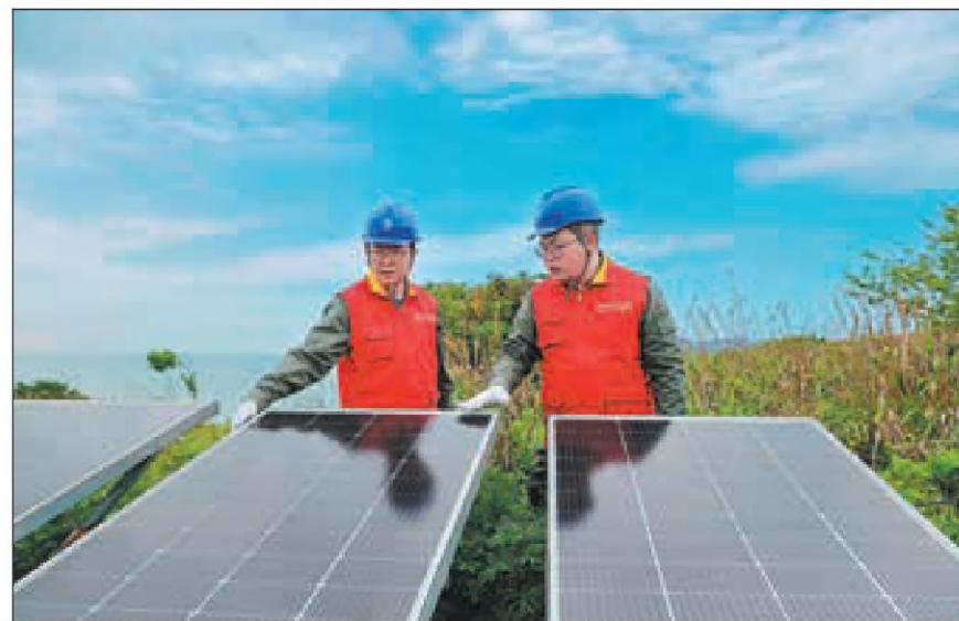
Employees of State Grid Wenzhou Electric Power Co inspect photovoltaic panels on Nanji Island, Zhejiang province, on Tuesday to ensure reliable clean energy supplies.