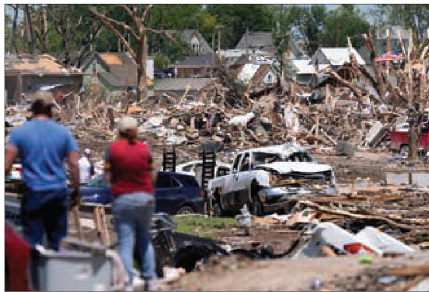
People survey tornado-damaged neighborhood on Thursday in Greenfield, Iowa.