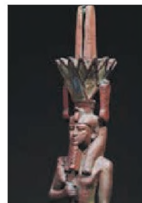
Left: An animal statue and another artifact of ancient Egyptian civilization to be showcased at the Shanghai exhibition. Above: A statue among the 788 artifacts from various eras of ancient Egyptian civilization to be on display.