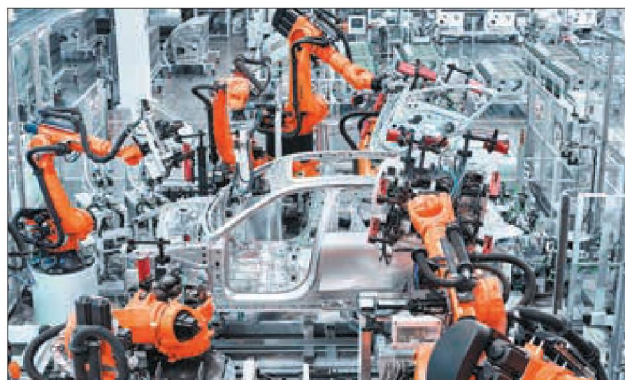
Robots operate an automated assembly line of Nio vehicles in Hefei in October.