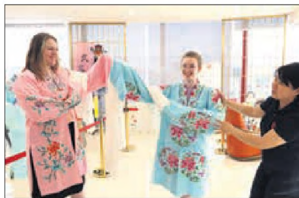
College students from the United States try on Peeking Opera costumes at Jixiang Theatre in Beijing on May 17.

optimism and potential, which was truly exciting, he said.