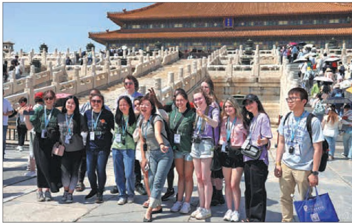
Students from the Indiana University of Pennsylvania in the United States visit the Forbidden City in Beijing on May 17.