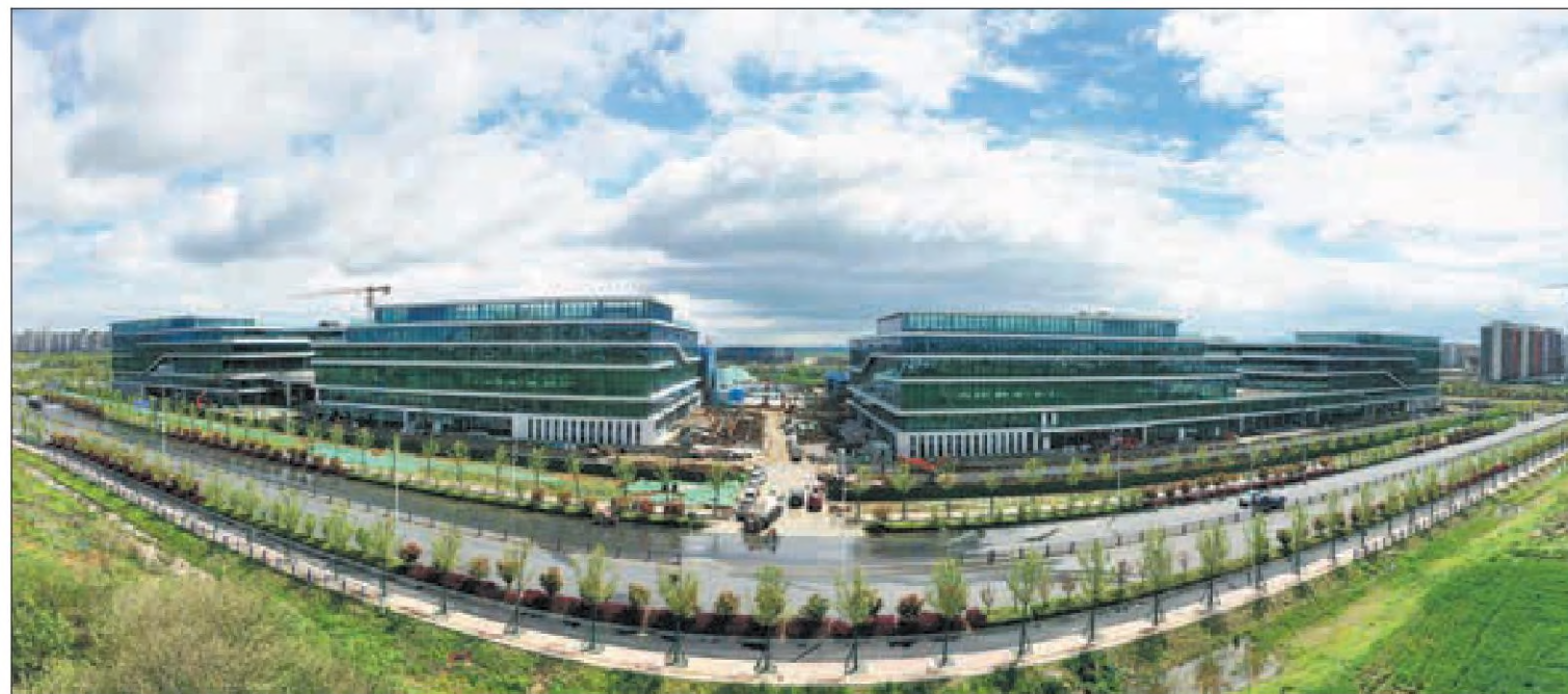
Sungrow Power Supply's new energy tech center is seen in Hefei, Anhui province, in April.