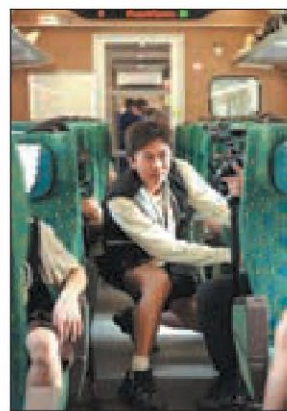
Top: The fourth season of the outdoor travel reality show HAHAHAHAHA , featuring entertainment stars and celebrities, ventures abroad with Laos as its first stop.