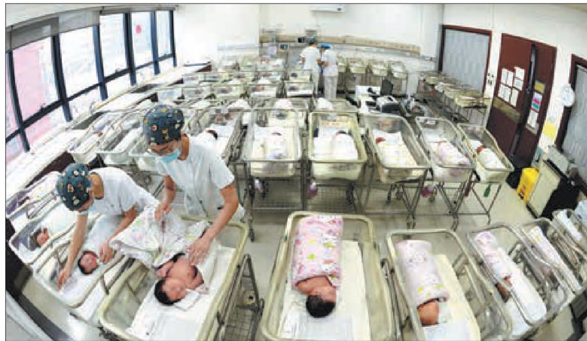
Medical staff take care of "dragon babies" at the provincial maternal and child health hospital in Lanzhou, Gansu province, on Feb 28.