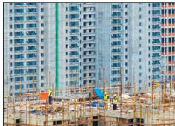
A view of a property construction site in Nanjing, Jiangsu province.

Some commercial banks in Central China's Wuhan went further by lowering the first-home loan inter-