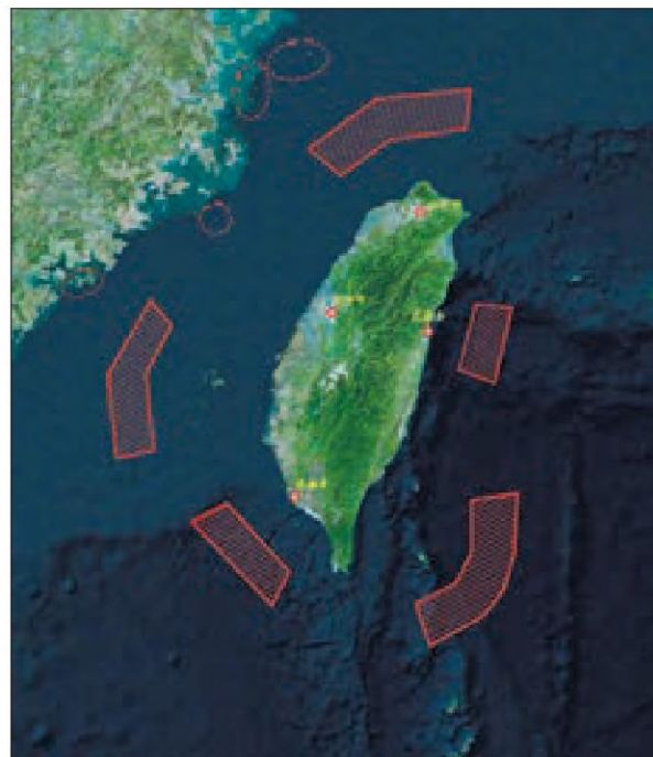
A schematic map shows the area where the two-day joint military drills that started on Thursday are being conducted by the Eastern Theater Command of the People's Liberation Army around the Taiwan island. PLA EASTERN THEATER COMMAND

However, observers said, in view of the global economic slowdown and intensifying geopolitical and economic friction in the region, difficulties and challenges still lie ahead for the three countries in economic and trade cooperation.