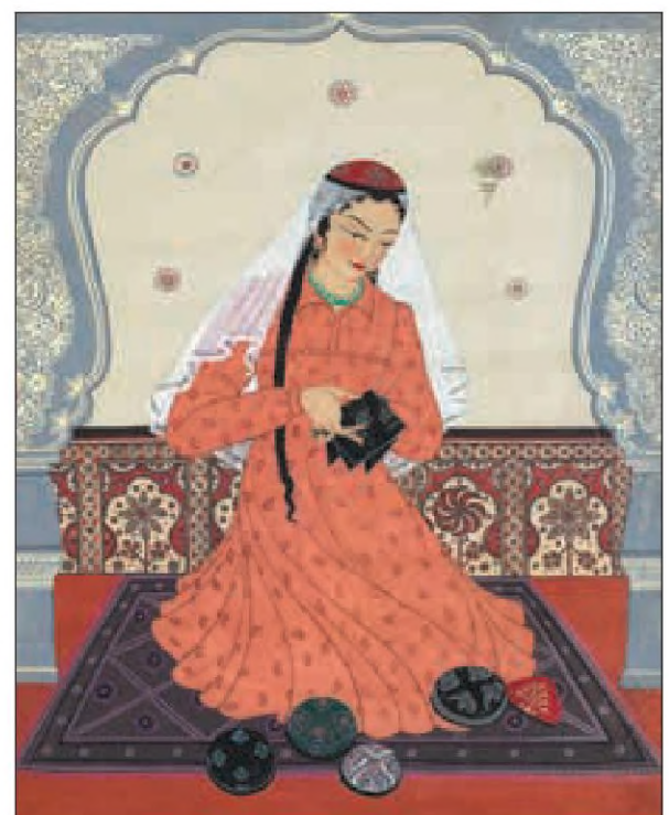
Clockwise from top left: Artist Chang Shana's works on display at a touring exhibition, Everlasting Beauty of Dunhuang, in Beijing, including Bougainvillea and Butterflies, Deity and Incense Burner, The Guardian King of the South, Nine-Color Deer and Woman in Xinjiang.