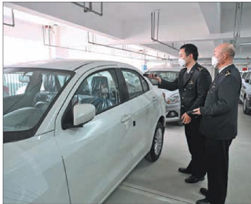
Customs officials check imported cars in Shanghai.

Cooperation in areas such as renewable energy, technology and infrastructure can bring about transformative changes that extend beyond the Gulf region to the entire world, said UAE Vice-President Sheikh Mansour bin Zayed Al Nahyan.