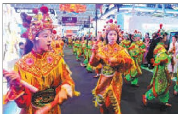
A women's Yingge dance team dressed as legendary heroines Mu Guiying and Hua Mulan perform at the international cultural industries fair in Shenzhen, Guangdong province, on Thursday.

Miniseries produced by Reelshort, a video-streaming platform of California-based Crazy Maple Studio that is owned by Chinese digital content provider COL Group and made its debut at the exhibition, have garnered a sig-