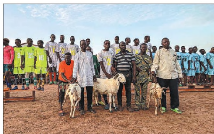
From left: The Park 7 team in a pep talk before the final of the first African Village Super League competition. The awards ceremony after the final, won by Barrage Village.