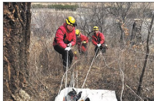
Firefighters from the Beijing Mountain Rescue Team participate in rescue training in Beijing.

Zhang said implementing such a system will need a legal basis as well as coordination and cooperation between multiple government departments.