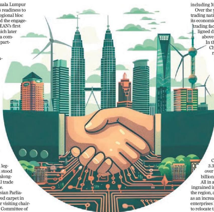
MA XUEJING / CHINA DAILY

In 1993, the Malaysian Parliament rolled out the red carpet in greeting the first ever visiting chairman of the Standing Committee of the National People's Congress, inaugurating the engagement of people representatives borne out of diverse political systems of governance. This further signifies the disparity of political governance has never been a stumbling block to fostering symbiotic cooperation in pursuit of shared aspirations. This became increasingly real and relevant in the globalized world as the new millennium was ushered in.