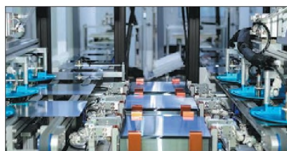
The production lines of photovoltaic cells by Jinery are fully automated.

"To further promote the low-cost application of photovoltaics, in 2019, we began to develop the more advanced TOPCon cell technology.