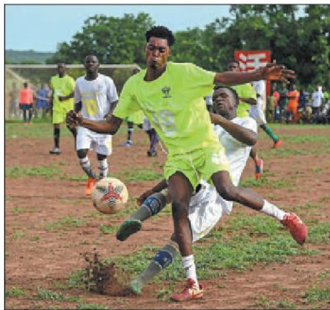
Players of team Park 7 and team Barrage Village vie for the ball during the final game of the first African Village Super League in Parakou.

Last summer, videos of some soccer matches in Rongjiang county, Qiandongnan Miao and Dong autonomous prefecture of Southwest China's Guizhou province, went viral and attracted tourists from around the globe. Inspired by this, the Village Super League in Parakou includes cultural performances during halftime, featuring Chinese martial arts and Beninese dance.