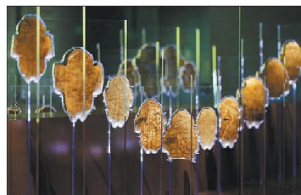
Left: Oracle bone inscriptions displayed at the new hall of the Yinxu Museum in Anyang, Henan province.