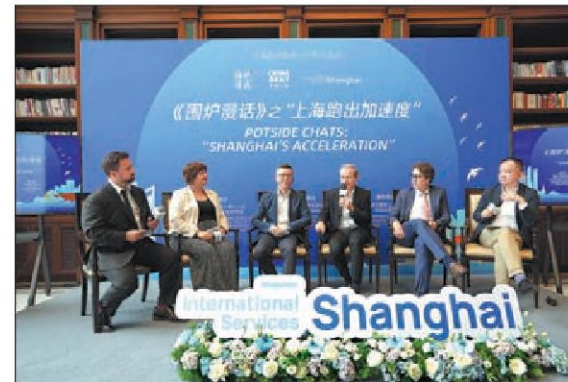
Guests discuss urban transformation and the business environment at the Shanghai's Acceleration salon in Shanghai on Thursday.