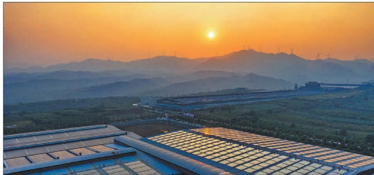
With photovoltaic panels installed on its rooftops, a company in Yuanqu county supplies clean power to local grids.