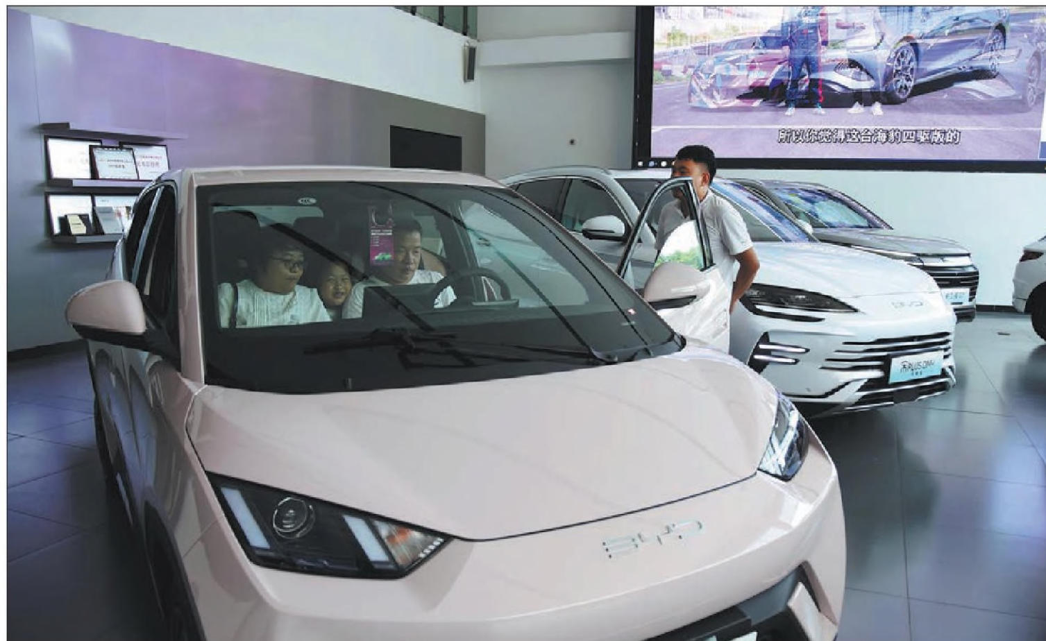
Consumers experience a BYD electric vehicle at a dealership in Mengzi, Yunnan province, in May.