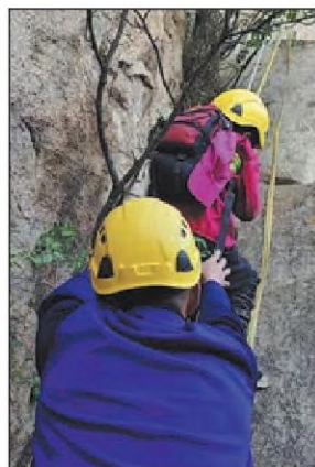
A firefighter rescues a boy trapped on a mountain in Huairou district, Beijing, in May.