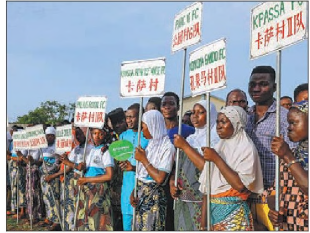
From left: Children gather around a promotional board of the first African Village Super League. Dancers perform after the final game of the inaugural competition. Teams line up at the closing ceremony.