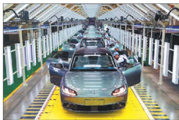
Dayun's high-end new energy vehicles roll off the production line in Yuncheng.

That year, Yuan Qinshan, chairman of Dayun, conceived of the idea to enter the new energy passenger car market. After years of research and development, in September 2020, Dayun's first pure electric small SUV and MPV models rolled off the production lines.