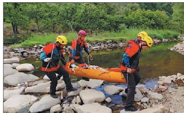
Firefighters from the Beijing Mountain Rescue Team in Huairou carry an injured tourist on a stretcher in September. The tourist had injured his waist and legs when picking chestnuts on the mountain.