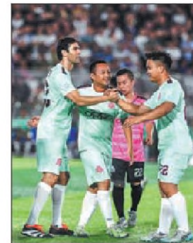
Kaka (left) celebrates with teammates at a charity soccer game in Rongjiang, Guizhou province, on Monday.

The Chasing Dreams girls' soccer championship charity project was launched last July in Rong-