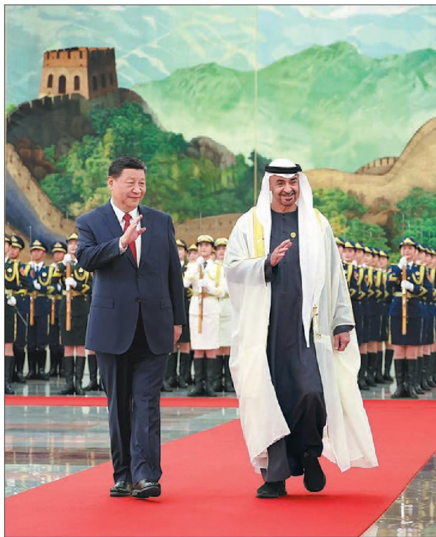
President Xi Jinping and President of the United Arab Emirates Sheikh Mohamed bin Zayed Al Nahyan attend a welcoming ceremony at the Great Hall of the People in Beijing on Thursday.

Noting that Middle East countries are an important part of developing countries and a significant force in