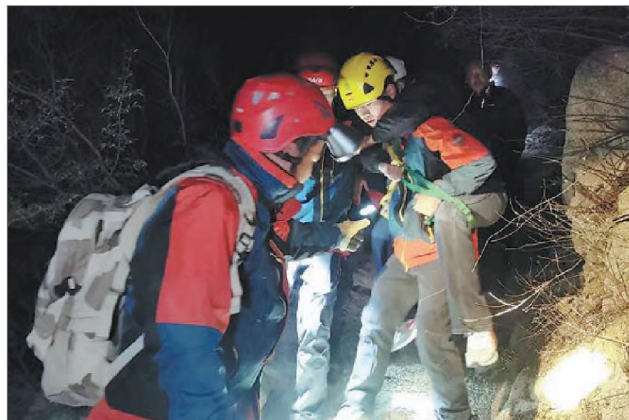
Left: Firefighters from Beijing's Huairou district rescue a hiker from an animal trap in March. Right: Firefighters rescue an injured hiker in December who was unable to walk.