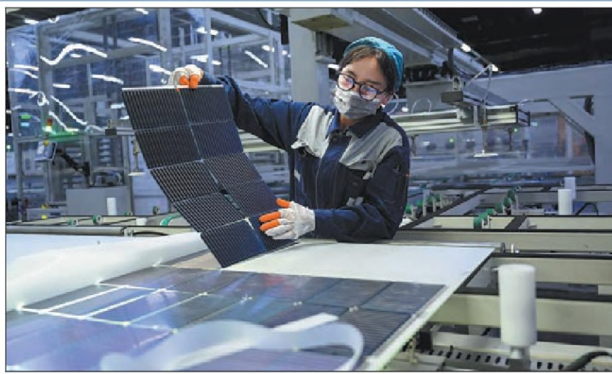
An employee works on a solar panel production line in Baotou, Inner Mongolia autonomous region.

"China's NEV industry has been continuously offering affordable, high-quality capacity, which will make a significant contribution to global green development," she said.