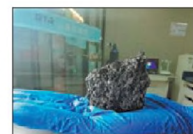
New anode material developed by Shanxi BTR.

Last year, Shanxi BTR's synthetic graphite facility became operational in the Pingding. Other projects put into operation that year also