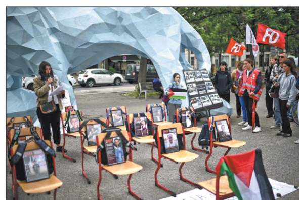
Protesters gather in Bordeaux, France, on Wednesday next to photos of children said to be victims of Israeli offensives in Gaza, during a rally in support of Palestinians.

The weekend Israeli strike and ensuing fire, which tore through the camp for displaced Palestinians in Rafah, killed 45 people, according to