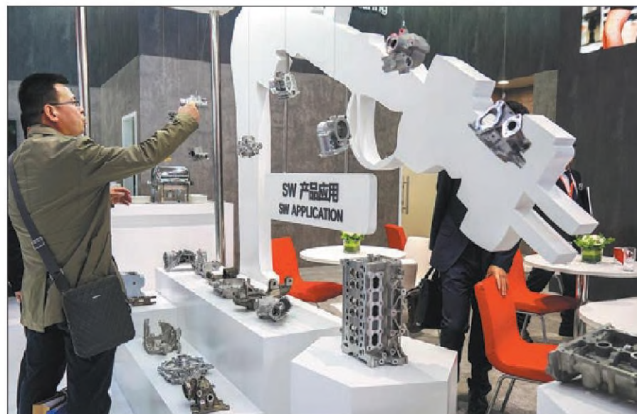
Visitors check out SW products during a machine expo in Shanghai in April 2018.