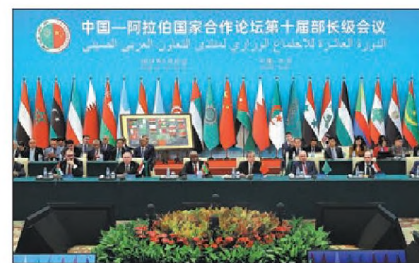
Foreign Minister Wang Yi (center) and representatives of Arab countries attend the opening ceremony of the 10th Ministerial Conference of the China-Arab States Cooperation Forum in Beijing on Thursday.

Jabbour added that China's position on the Palestinian question is historical, consistent and principled, and conforms with international law.