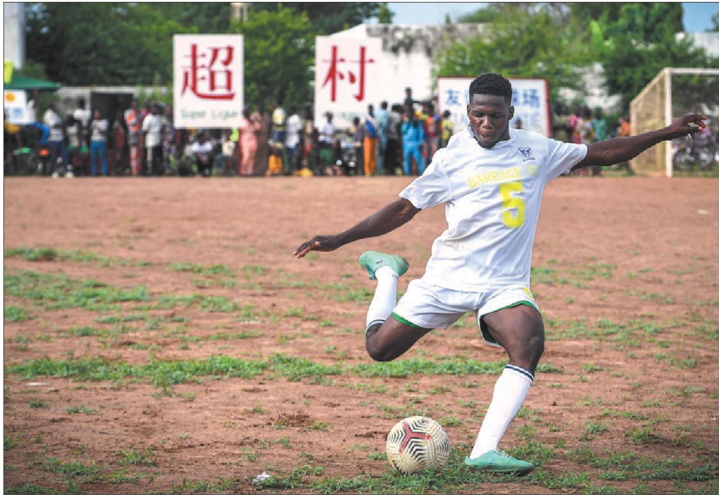
A member of team Barrage Village takes a shot during the final game of the first African Village Super League in Parakou, Benin, on Saturday.