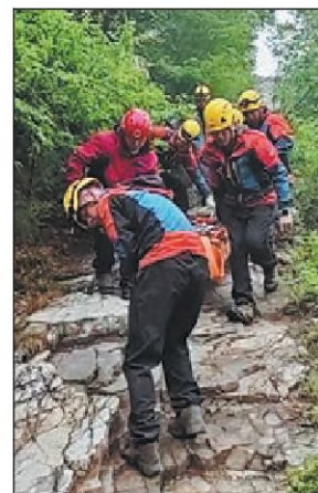
Firefighters rescue an injured hiker from a steep mountain in Huairou, Beijing, in May.

Team carries out searches and rescues at the request of the police, and almost the entire operation is government-funded.