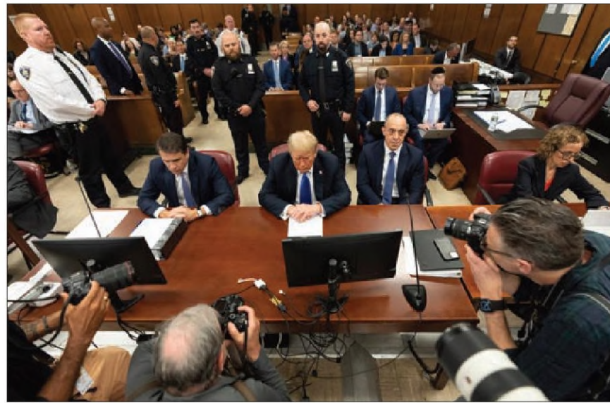
Former US president Donald Trump appears in Manhattan Criminal Court during jury deliberations in his hush money trial in New York on Thursday.