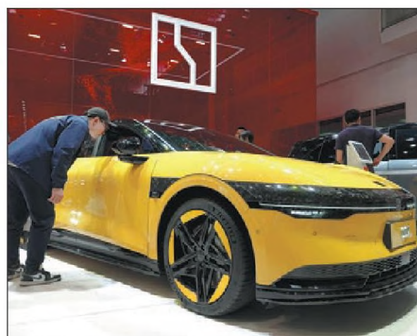
A Zeekr 007 vehicle on display during an auto expo in Beijing.