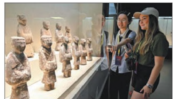
A member of a US high school student delegation from Iowa visits the Hebei Museum in Shijiazhuang on June 9.