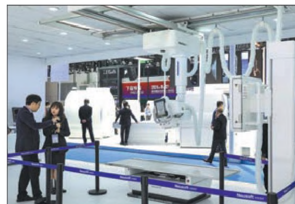
Visitors check out digitalized X-ray equipment during a medical supply expo in Shanghai in April.

Additionally, TCM's external treatments, such as acupuncture and massage, depend on the practitioner's hands-on skills, and thus cannot be easily replaced by automated AI equipment either, he said.