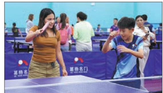
A US student learns how to play table tennis with a Chinese student in Baoding on July 15.