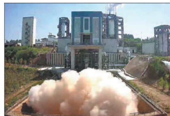
The ignition test of the new type of rocket engine designed to propel the third stage of the Long March 10 rocket is carried out at a newly built engine test facility in Beijing.

The Supreme People’s Court has instructed courts nationwide to maintain robust efforts against gambling-related crimes and to be vigilant in identifying gambling activities during the handling of other cases, with the aim of curbing all criminal activities associated with gambling.