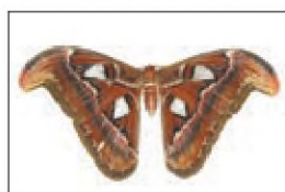
Attacus atlas , the world's largest moth

It was stumbled upon by a team of entomologists from Guangxi Normal University during an insect diversity survey in the city's Guangxi Daguishan Crocodile Lizard National Nature Reserve.