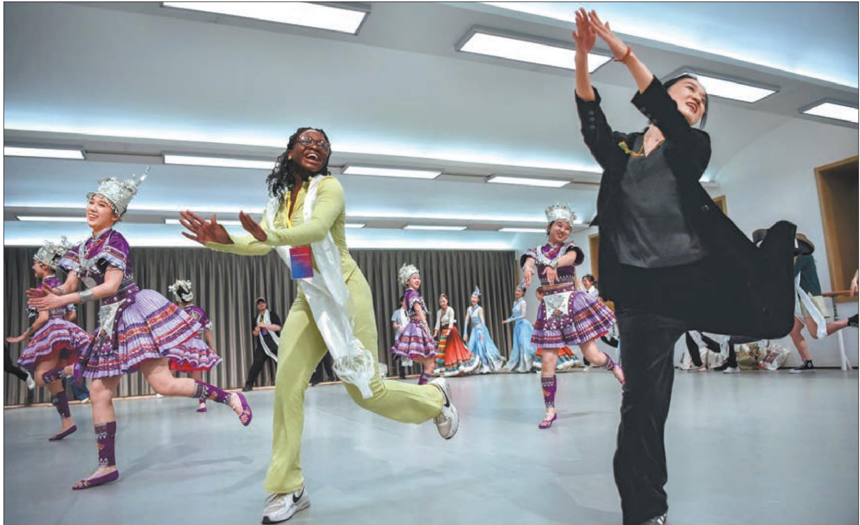
A student from a US tour group enjoys dancing with Chinese students while visiting the Affiliated School of Beijing Normal University on April 18.