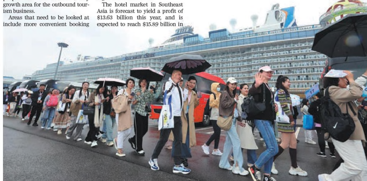
Chinese tourists on a group tour aboard the ocean liner Spectrum of the Seas arrive at Incheon Port, South Korea, on May 7.

Zhou believes Chinese hotel brands should continue strengthening their capabilities to improve their competitiveness in overseas markets.