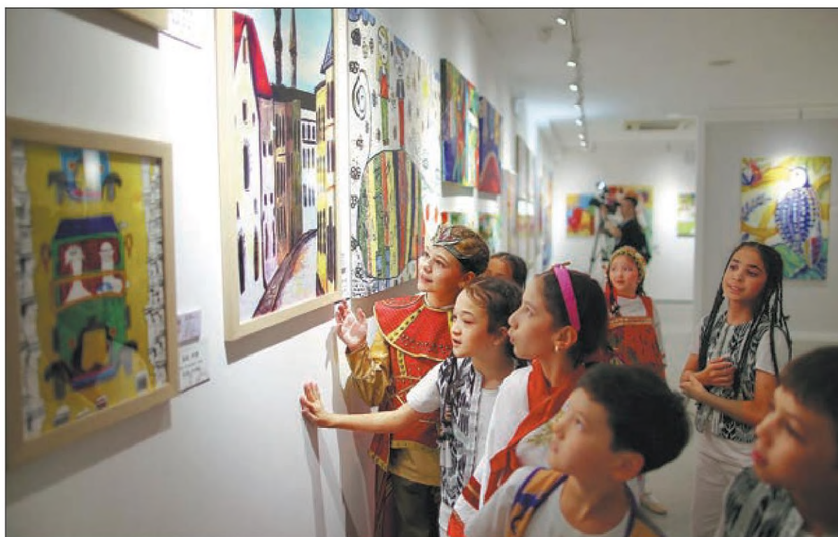
Children tour an art exhibition in Tianjin on Monday, the opening day of an international children's art festival. The event, which will continue until Friday, attracted over 400 Chinese children on Monday and more than 700 others from 20 countries, including Canada, Egypt, France and Germany.