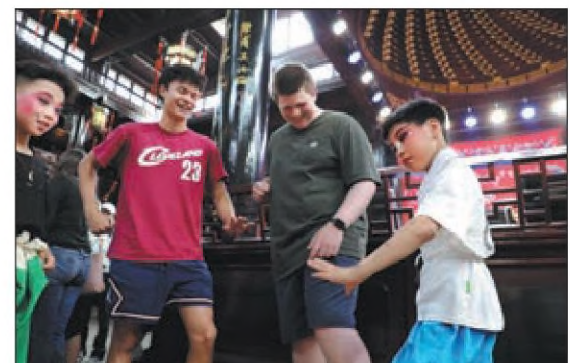
Two students (center) from the West Contra Costa Unified School District learn opera movements from Peking Opera performers in Baoding on July 11.