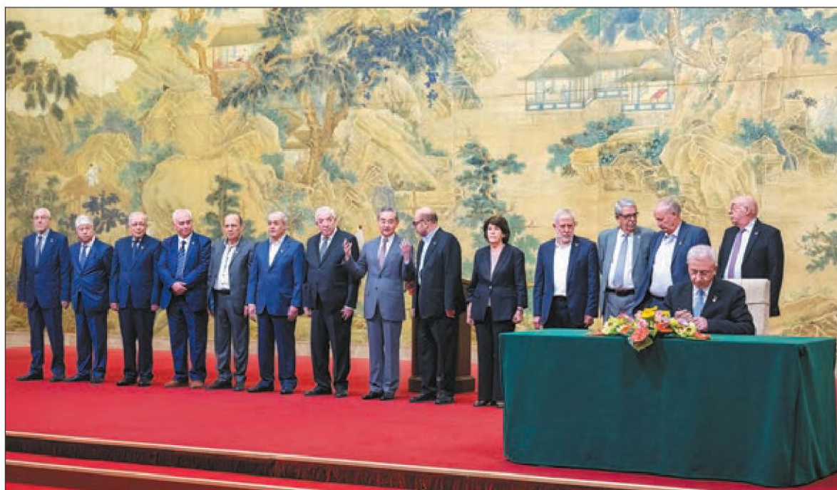
Foreign Minister Wang Yi (center) attends on Tuesday the closing ceremony of the reconciliation talks between 14 Palestinian factions in Beijing. He witnessed the signing of the Beijing Declaration on Ending Division and Strengthening Palestinian National Unity by the representatives of the factions, including the Hamas and Fatah who met in Beijing in a renewed bid for reconciliation.

Energy cooperation is an essential part of the China-Russia comprehensive strategic partnership of coordination for a new era. Russia surpassed Saudi Arabia to become China's largest crude oil supplier last year.