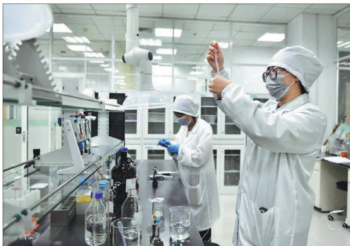
Above: Employees examine drug samples at a laboratory in Shenyang, Liaoning province, in May. Below: Technicians run drug experiments at a pharmaceutical company's lab in Haikou, Hainan province, in May.

In fact, due to the significant market size of innovative drugs, the US and European markets have become prime targets for such drugmakers. The US accounted for over half of global innovative drug sales in 2021, with Europe at 16 percent, while China stood at merely 3 percent, far below that of developed countries, according to a report by consultancy Market Monitor.