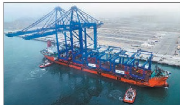
Container cranes and rail-mounted gantry cranes shipped from China arrive on June 27 at the Chancay Port in Peru.

Contact the writers at vivienxu@chinadailyapac.com