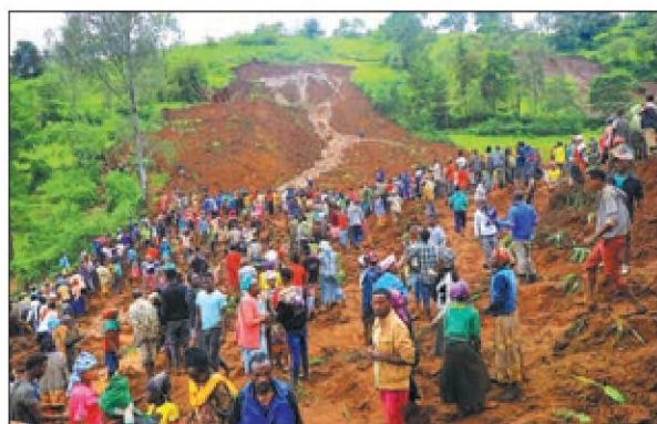
People gather around an area on Monday where deadly landslides occurred between Sunday evening and Monday morning, in Gofa zone, southern Ethiopia. The landslides, triggered by heavy rains, have so far killed 229 people. The death toll is expected to rise.