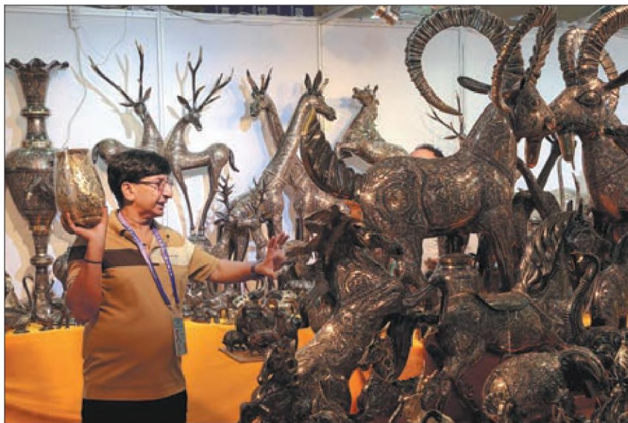
An exhibitor from Pakistan introduces handicrafts at the China-South Asia Expo, which opened in Kunming, Yunnan province, on Tuesday.

MORE NEWS WHENEVER YOU WANT IT · CHINADAILY.COM.CN/BUSINESS