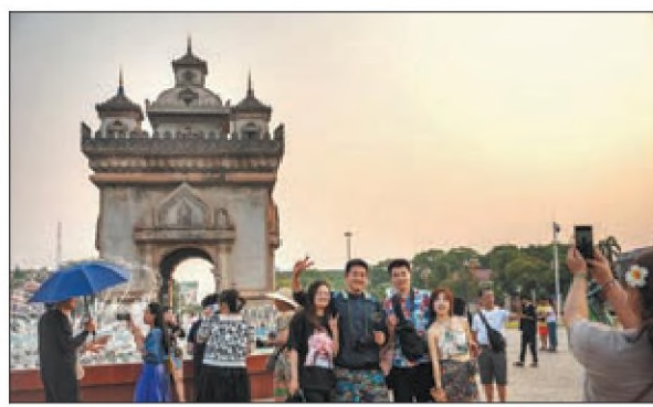
Chinese tourists visit the Patuxai Park in the Lao capital Vientiane on May 1.

Areas that need to be looked at include more convenient booking