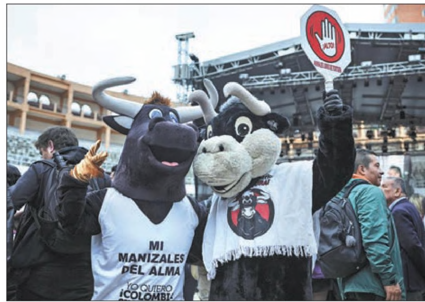
People dressed as bulls attend the signing ceremony of a law that bans bullfighting at Santamaria Cultural Square, Bogota, Colombia, on Monday. Colombian President Gustavo Petro signed the bill in front of hundreds of animal rights activists at the capital's bullring, ending a practice that had been constitutionally recognized as part of the country's culture.