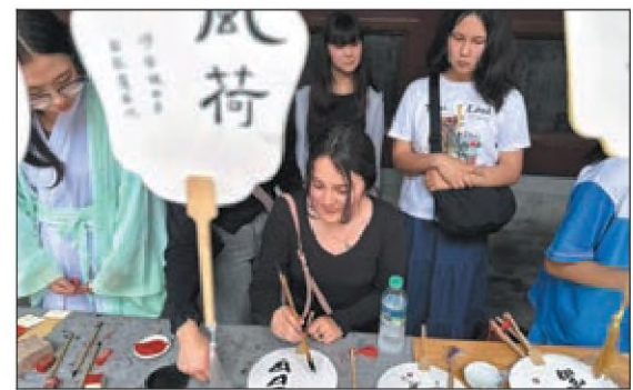
A US student from the West Contra Costa Unified School District experiences writing Chinese calligraphy on a fan in Baoding on July 11.

Since then, several US delegations have visited China, traveling to cities such as Shanghai and Xi'an, Shaanxi province.