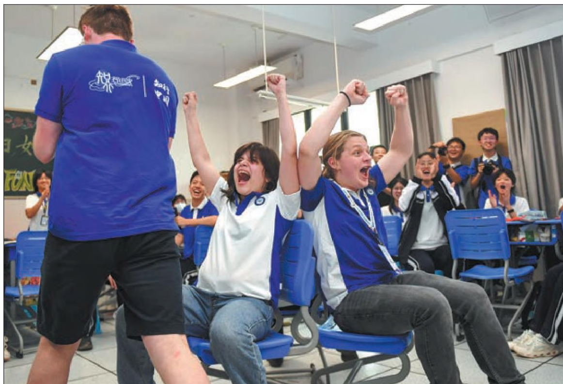
High school students from Washington state play a game with Chinese students at the Shenzhen Nanshan Foreign Language School in Guangdong province, on March 25. A series of US delegations have visited China this year.