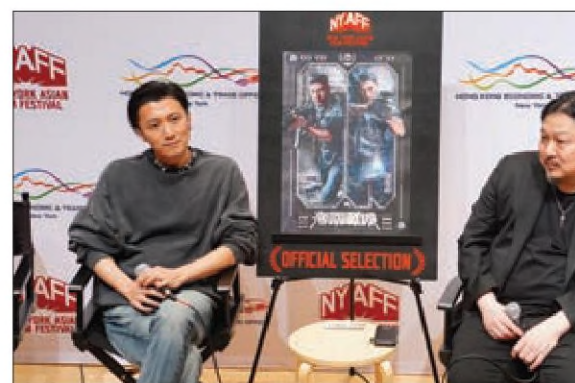
Hong Kong actor Nicholas Tse (left) talks to the media on July 17 in New York, where he was honored with this year's Screen International Star Asia Award at the New York Asian Film Festival.

"I've done my own stunts ever since I was 19," Tse recalled. "All the