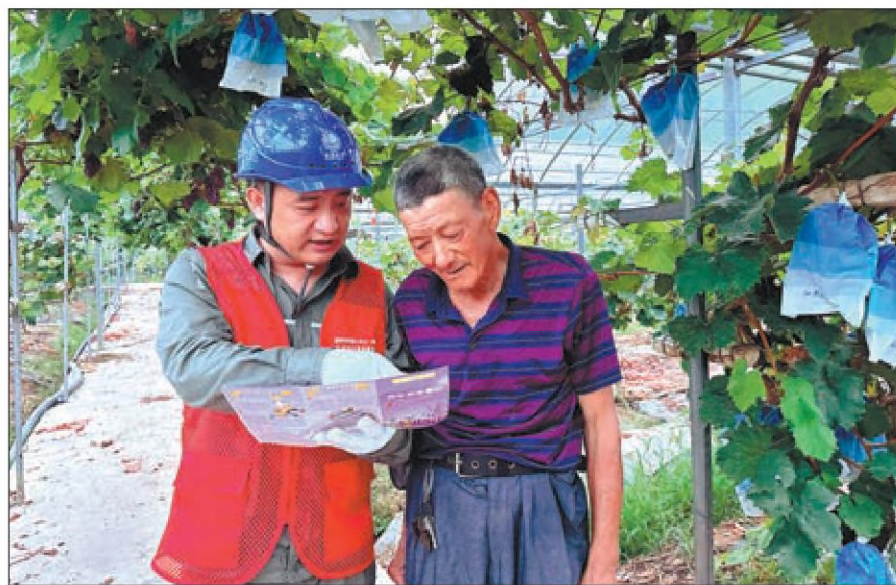
An employee (left) of State Grid Wenzhou Electric Power Co addresses a farmer's queries at a vineyard in Tashi, a village in Wenzhou, Zhejiang province. As power use peaks in the scorching summer, the company sent employees to agricultural areas to enhance awareness of safe electricity use, and assist in harvests.