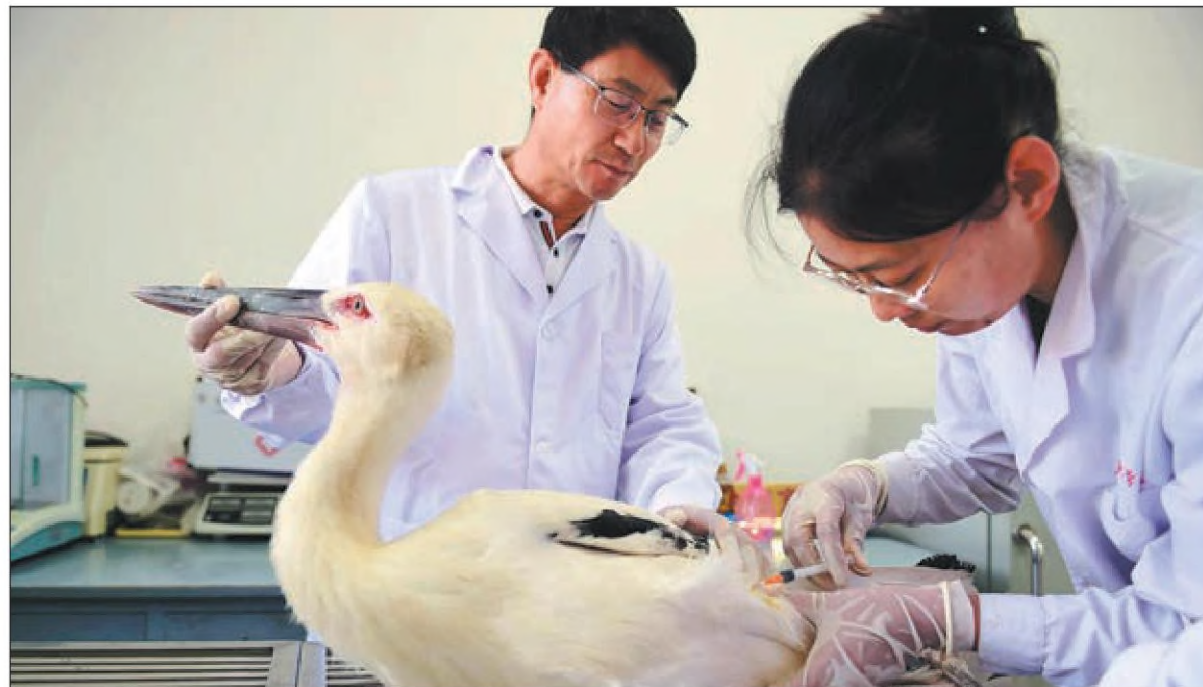
Experts treat a sick Oriental white stork chick at Cangzhou City Wildlife Rescue Center in Cangzhou, Hebei province, on Tuesday. Cangzhou is an important habitat for birds migrating along the East Asian-Australasian flyway. It is the breeding season for birds, and staff members at the center have rescued 26 injured birds since June. Once they are rehabilitated, they will be released back into the wild.