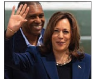
US Vice-President Kamala Harris before boarding Air Force Two as she departs on campaign trip to Milwaukee, Wisconsin, on Tuesday.

Harris has previously served as the San Francisco district attorney, the