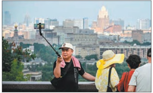
Left: Chinese tourists relax at a resort in Kota Kinabalu, Malaysia, on April 4. Middle: Chinese tourists visit the Erawan Museum in Samut Prakan, Thailand, on March 1. Right: A Chinese tourist takes a selfie at the observation deck of Sparrow Hills in Moscow on July 15.