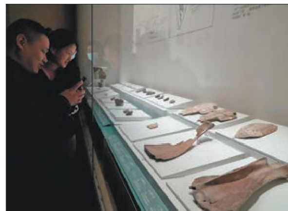
Visitors examine the oracle bones dating back to the late Shang Dynasty exhibited at the Yinxu Museum of Anyang, Henan.