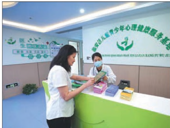
Left: A parent visits the child and adolescent mental health service center in Lin'an District, Hangzhou, Zhejiang province, in May. The center has been helping parents and caregivers develop the knowledge and skills to support children in distress. Right: Students play games in groups to learn about mental health at a primary school in Beijing.

Her depression, though still recurrent, has been significantly ameliorated compared with the most difficult times back in high school. However, her situation and history of adolescent depression are shared by many young people.