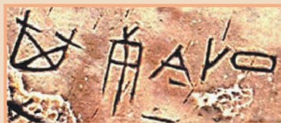
Top: A digital copy of an oracle bone rubbing with enhanced micro-traces. Above: A specific area of a rubbing is digitally enhanced for better clarity.

experts and scholars specialized in reading oracle bone scripts is limited.