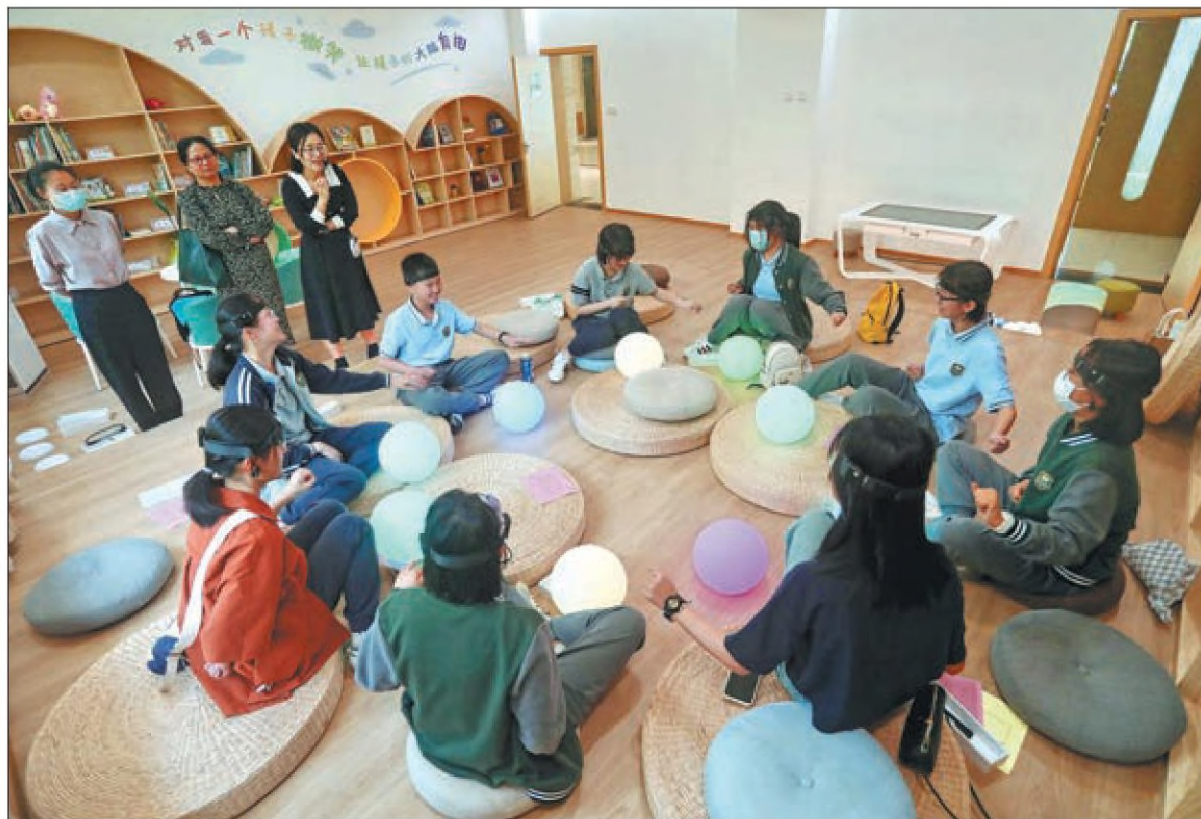
Children wear brainwave devices to monitor their emotional states at a child and adolescent mental health service center in Jiaxing, Zhejiang, in May last year.

Chinese people may be relatively restrained and reserved, and they are somewhat discouraged from expressing emotions, especially negative emotions. They tend to be influenced by their social environment, and they may not be willing or able to find appropriate ways to express these feelings."