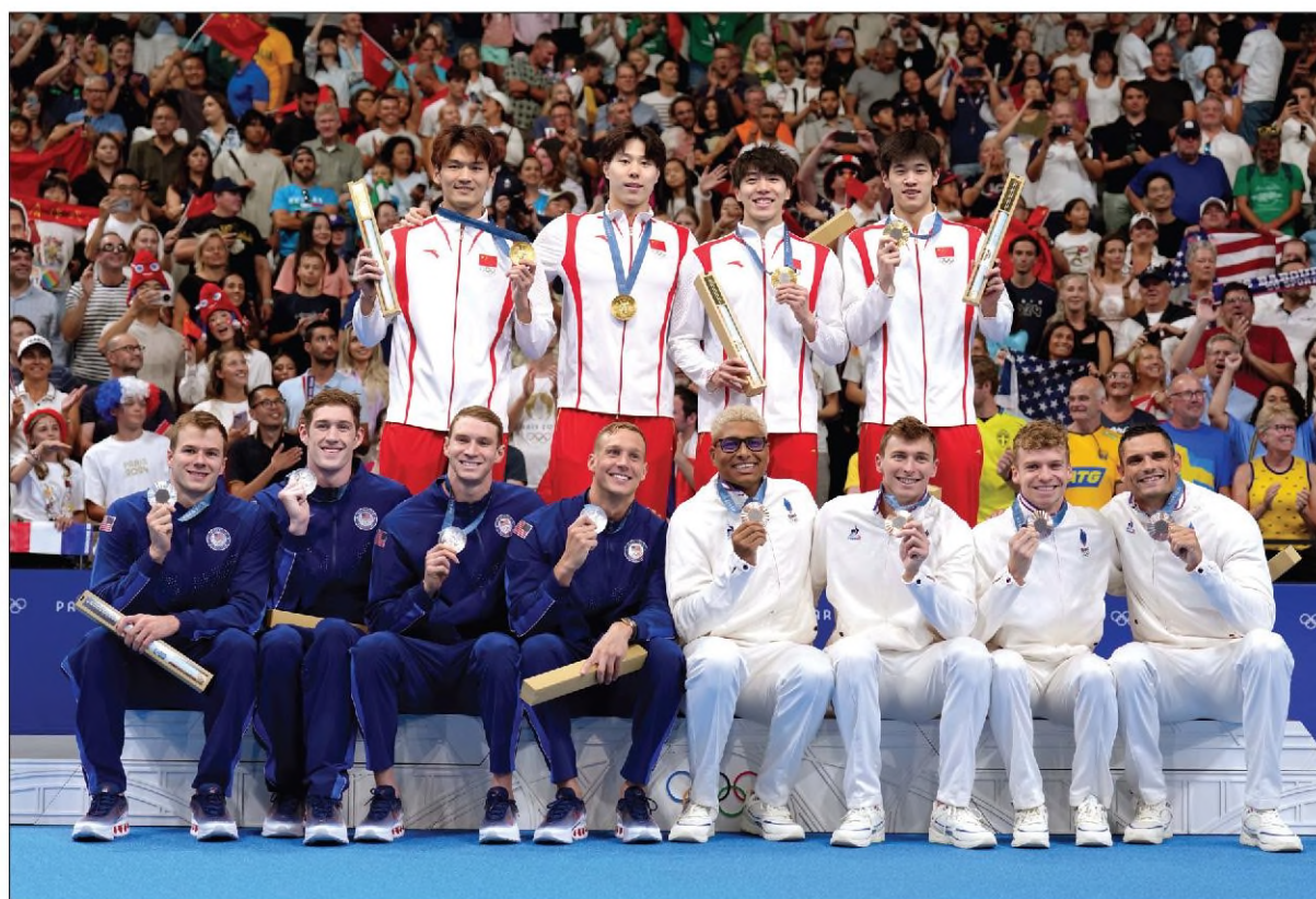
Gold medalists Team China (top), silver medalists Team USA (left) and bronze medalists Team France attend the victory ceremony for the men's 4x100m medley relay in swimming at the Paris 2024 Olympic Games on Sunday.

Qin, who swam the breaststroke leg in the medley, was also crucial in the victory with a time of 57.98