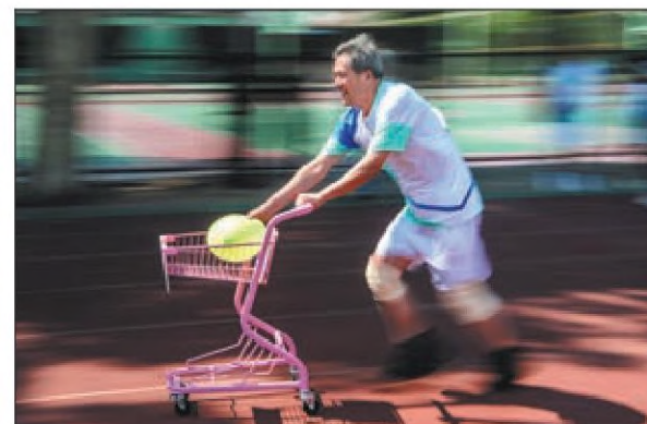
Left: Contestants cheer during the games.