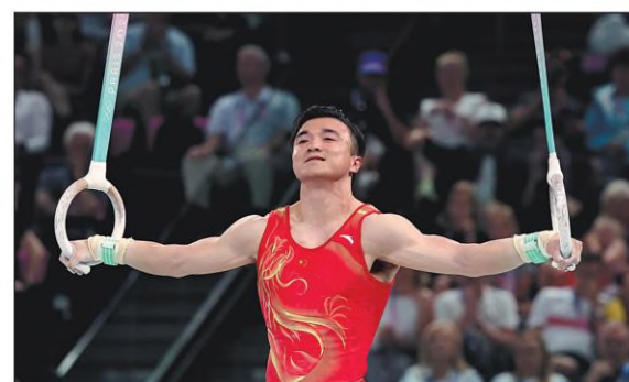
Above: Fan Zhendong celebrates after winning the men's table tennis singles gold on Sunday at the Paris 2024 Olympic Games. Fan beat Sweden's Truls Moregard 4-1 to win his first Olympic gold medal. See more, page 6