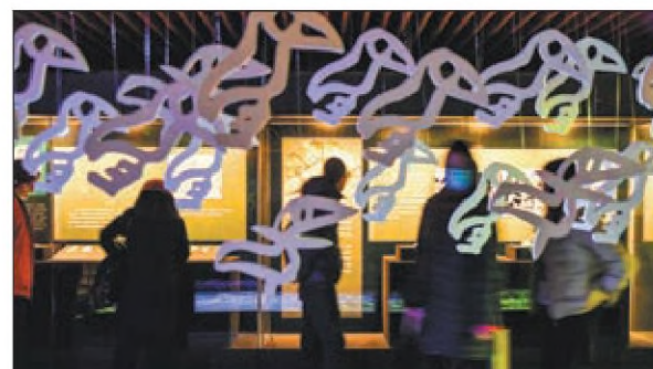
The significance of the oracle bones unearthed from the Yinxu site in Anyang, as well as the evolution of oracle bone scripts, are highlighted at an exhibition featuring major discoveries of ancient documents in the early 20th century, held at the National Museum of Classic Books in Beijing in early 2023.