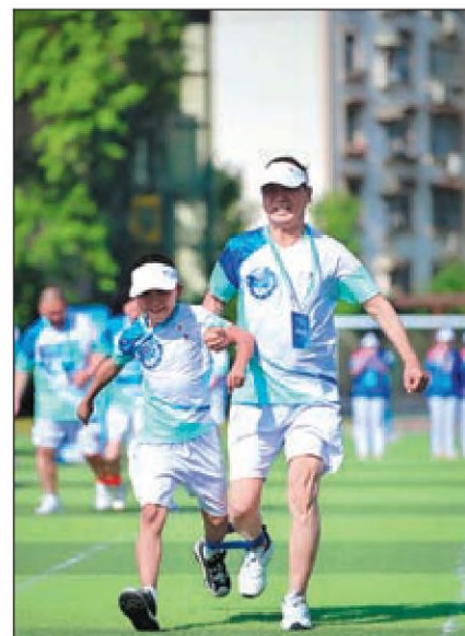
Top: Contestants pull hard during a tug-of-war event at the eighth China Organ Transplant Games in Wuhan, Hubei province, in June. Above: Contestants dash in a three-legged race during the games.