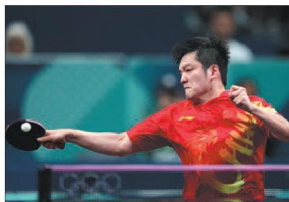
China's Fan Zhendong beats Sweden's Truls Moregard in the 2024 Olympics men's table tennis singles final in Paris on Sunday, completing a prestigious "Grand Slam".

By SUN XIAOCHEN in Paris sunxiaochen@chinadaily.com.cn