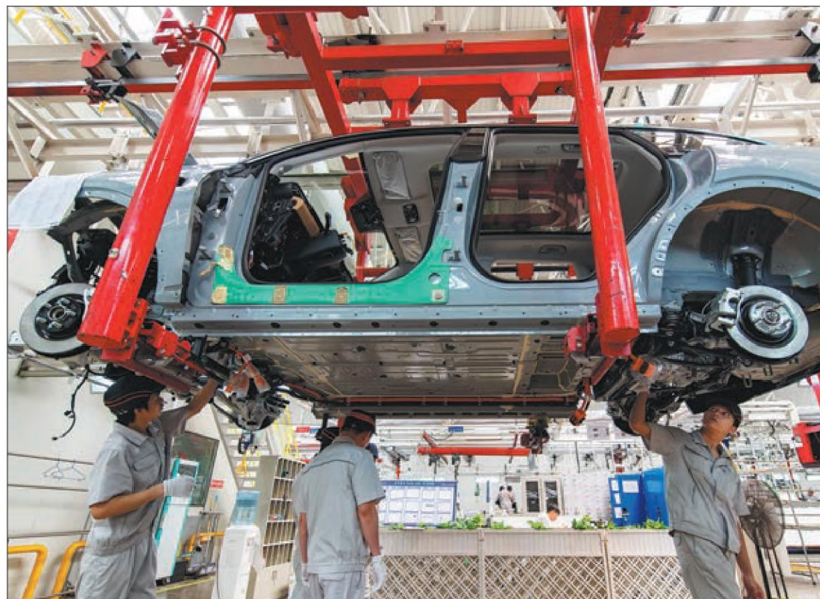
Workers operate on an assembly line of new energy vehicles in Jinhua, Zhejiang province, in July.