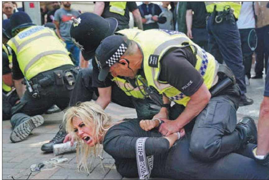
Police officers detain a woman during a protest in Nottingham, England, on Saturday, following the knife attack on July 29 in Southport, in which three young children were killed.