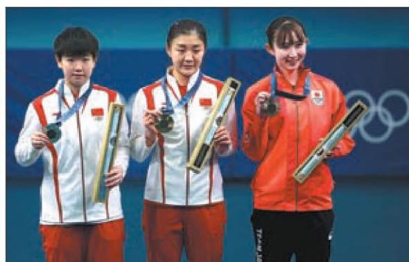
Gold medalist Chen Meng of China (center) is flanked by teammate and silver medalist Sun Yingsha (left) and bronze medalist Hina Hayata of Japan on the podium on Saturday.

History repeated itself for China's defending table tennis champion Chen Meng, as she beat teammate Sun Yingsha 4-2 to win the women's singles gold medal at the Paris Olympics on Saturday, just as she did three years ago at the Tokyo Games.