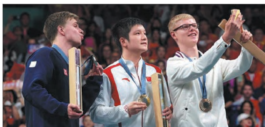
Bronze medalist Felix Lebrun of France (right) takes a selfie on the podium with silver medalist Truls Moregard of Sweden (left) and gold medalist Fan Zhendong of China.

After Fan outplayed Lebrun to advance to the men's singles final on Friday, social media users