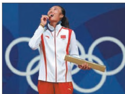
Left: Zheng falls to the ground in celebration after winning the 2024 Olympics women's singles tennis gold medal in Paris on Saturday. Right: A delighted Zheng smiles on the podium.

Navarro of the United States in the round of 16 and former world No 1 Angelique Kerber of Germany in the quarterfinals, before challenging reigning world No 1, Poland's Iga Swiatek, a four-time major winner at Roland Garros, in the semifinals.