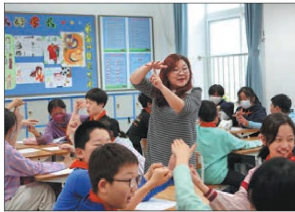
Left: A teacher gives a psychology lesson to students at a primary school in Beijing in April, using games to enhance the students' self-awareness and empathy toward others. Right: Students participate in sandplay therapy in a psychological counseling room at a middle school in Huzhou, Zhejiang province, in October.