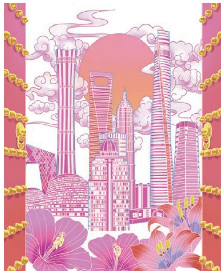
JIN DING / CHINA DAILY

Here lies a crucial observation: while rising economic nationalism may have caused