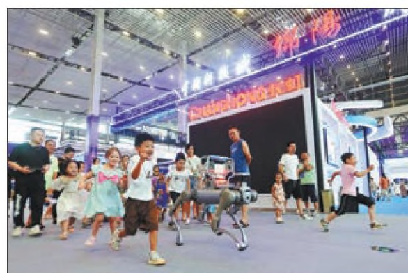
Top: An employee tests LED lights at a tech company in Ruichang, Jiangxi province. Middle: A property construction site in Yantai, Shandong province. Above: Kids race with a robot dog during an expo in Mianyang, Sichuan province.

efforts to support the ailing sector took time to revive demand.