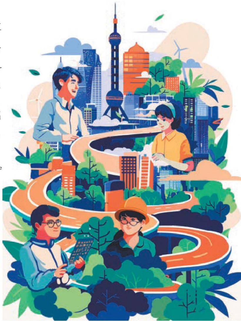
MA XUEJING / CHINA DAILY

Domestically, the resolution adopted at the plenum details a raft of key initiatives focused on elevating governance to a new level in response to the people's rising need for a better life and the changing global dynamics. Taking cognizance of the "increasing uncertainties and unpredictable factors" impacting national development, China's efforts to strengthen its economic resilience and promote innovation are understandably set to take the centre stage in the next phase of development.