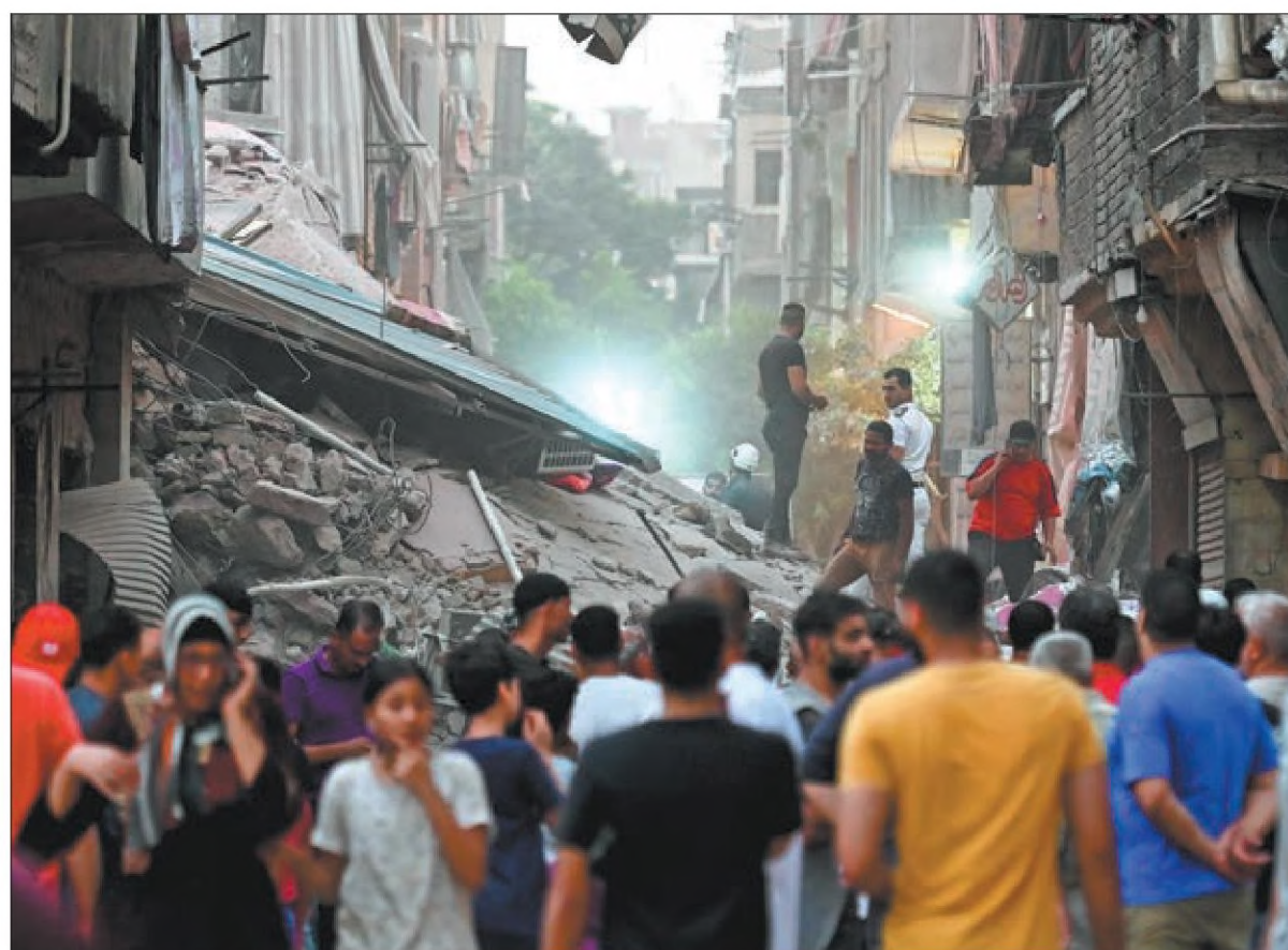
Security and emergency personnel search for survivors in the rubble of a collapsed five-story residential building on Saturday in Cairo, Egypt. At least one person was killed and seven others wounded in the incident. The collapse was reportedly caused by an illegal expansion carried out by a ground-floor resident who demolished a wall inside the apartment.