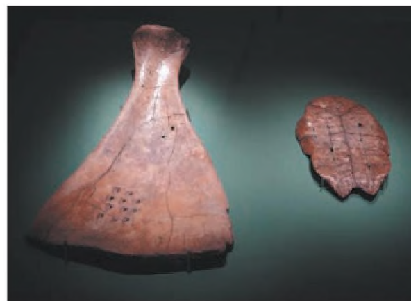
Late Shang Dynasty (c. 16th century-11th century BC) oracle bones exhibited at the newly built Yinxu Museum in Anyang of Henan province.