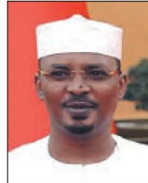
Mahamat Idriss Deby Itno

President Xi Jinping and Chad's President Mahamat Idriss Deby Itno announced on Tuesday the elevation of bilateral relations to a strategic partnership.