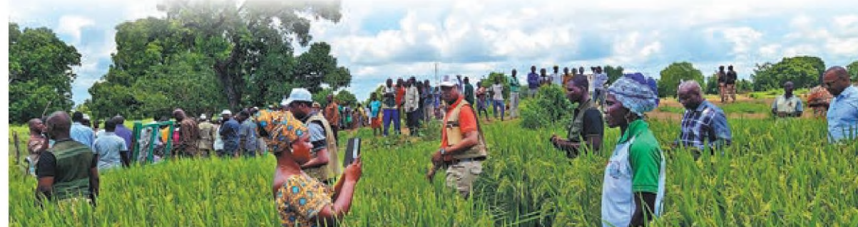
Chinese experts demonstrate how to plant water-saving and drought-resistant rice at a field in Burkina Faso in 2022.

This has greatly enriched the "grain bags" and "grocery baskets" of the African people and promoted African agricultural modernization, she added.