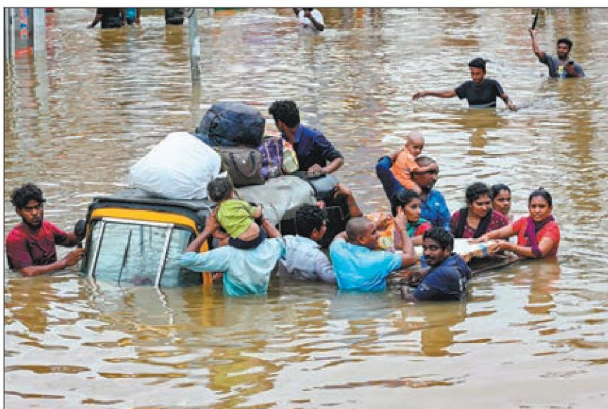
People carry their belongings as they wade through a flooded street after heavy monsoon rains in Vijayawada, India's Andhra Pradesh state, on Monday. Intense monsoon rains and floods in the country's southern states have killed at least 33 people, with thousands rescued and taken to relief camps, disaster officials said.