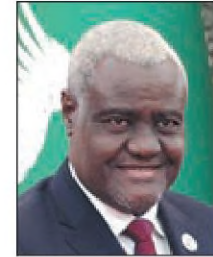
Moussa Faki Mahamat

President Xi Jinping reaffirmed on Tuesday China's support for the African Union to play a greater role in promoting China-Africa friendship, saying that the country is ready to take the 2024 FOCAC Summit as an opportunity to deliver more cooperation achievements.