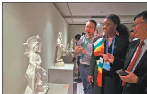
Tatenda Mavetera, Zimbabwe's minister of information, communications and technology and postal and courier services, tours an exhibition of stone sculptures at the China Millennium Monument Art Museum in Beijing on Tuesday. The exhibition features 100 sculptures from China and Zimbabwe.