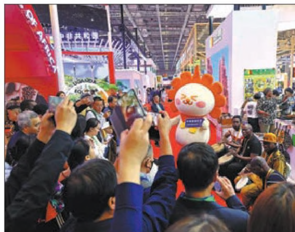
From left: African drummers perform at the sixth China International Import Expo in 2023. Benin pineapples are a standout success at the CIIE 2023.

Past CIIEs have served as a launchpad for African products in the Chinese market. Exhibitors have showcased an array of products, from agricultural commodities like coffee, tea and cocoa to artisanal