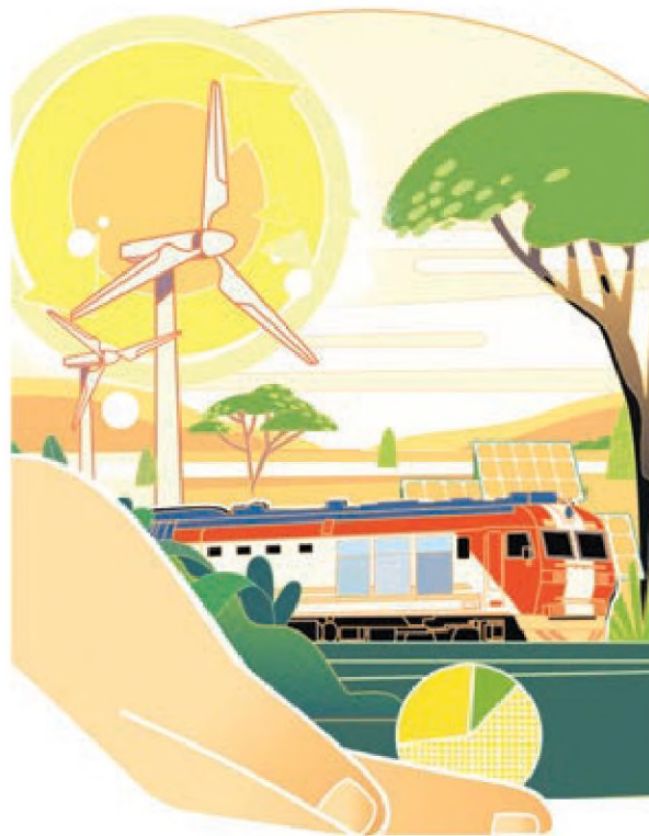
SHI YU / CHINA DAILY

Take South Africa as an example. As of 2023, the proportion of coal power in South Africa was as high as 80 percent. Factors such as aging and backward power infrastructure and the serious debt problem at ESKOM, South Africa's state-owned electricity utility, have brought great challenges to South Africa's power supply and energy security. The dominance of coal power cannot be altered rapidly. As projected by South Africa's Just Energy Transition Investment Plan (2023-27), nearly $98 billion is needed for a just energy transition there. In comparison, developed countries have committed about $11.6 billion in JETP, of which concessional loans and commercial loans account for about 80 percent, and