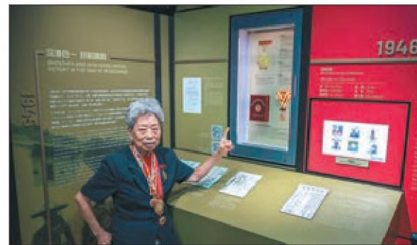
A visitor poses for photographs before the unveiling ceremony of the Hong Kong Museum of the War of Resistance and Coastal Defence on Tuesday.

Particularly, it sheds light on the Hong Kong Independent Battalion of the Dong Jiang Column — a guerrilla force tasked by the Communist