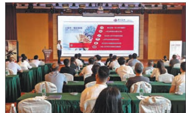
A conference to promote the cross-border use of the renminbi is held in Lusaka, Zambia, in September 2023.

CIPS can also team up with other cross-border clearing systems such as INSTEX in Europe so that a safer and more inclusive cross-border payment and clearing network can be built, which will also be conducive to the further internationalization of the RMB, he said.