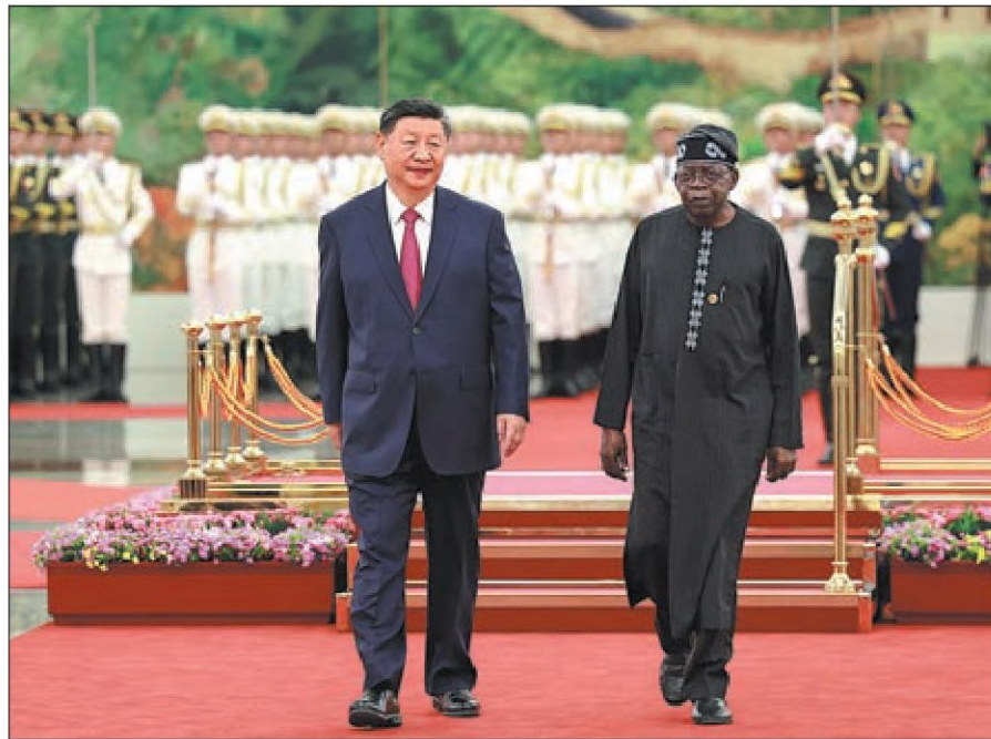
President Xi Jinping hosts a welcoming ceremony on Tuesday for visiting Nigerian President Bola Tinubu at the Great Hall of the People in Beijing before their meeting. After their talks, the two leaders witnessed the signing of cooperation documents related to the Belt and Road and other matters.