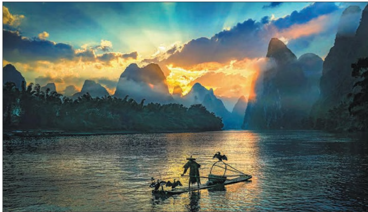
A fisherman sails a raft in a river in Guilin, Guangxi Zhuang autonomous region. Guilin Karst has been included in the list of "The Second 100 IUGS Geological Heritage Sites" by the International Union of Geological Sciences.