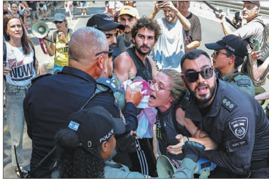
Police officers scuffle with a protester as families and supporters of Israeli hostages held by Hamas in the Gaza Strip hold a rally calling for their release in Tel Aviv on Monday.

This will help highlight the realities of those most affected by conflict in the discussions and improve coordination among stakeholders, she said.