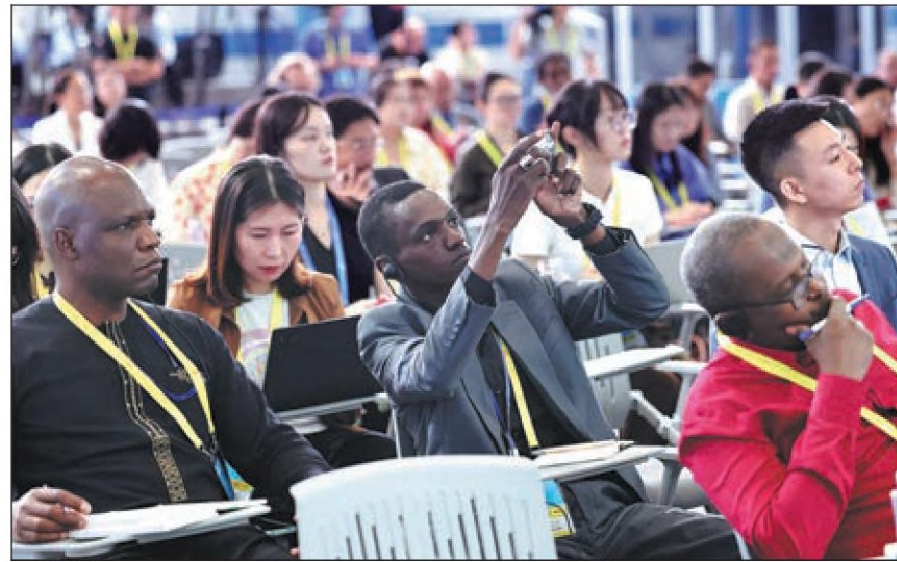
Journalists attend a news conference ahead of the 2024 Summit of the Forum on China-Africa Cooperation in Beijing on Tuesday.