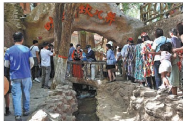
Visitors line up to enter a scenic spot with the Karez system in Turpan, Xinjiang Uygur autonomous region, in June.

Positioned at the junction of northern and southern China, Hanyin's regional rainfall is insufficient to sustain necessary water flow in terraced fields throughout the year. To address the problem, ancient farmers built dams and