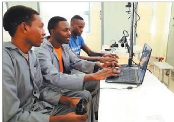
Students operate robotic arms at the Integrated Polytechnic Regional College-Musanze, a public higher learning institution in Musanze town of northern Rwanda, on April 15.

These graduates showcase advanced skills acquired at the workshop, enabling them to proficiently operate robots and excel in their respective fields.