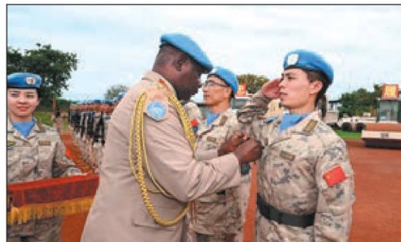
Chinese peacekeepers in South Sudan are awarded the UN Peace Medal of Honor at a ceremony at the Super Camp of Wau on Oct 28.