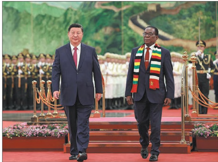
President Xi Jinping hosts a welcoming ceremony on Tuesday for visiting Zimbabwean President Emmerson Mnangagwa at the Great Hall of the People in Beijing. Mnangagwa is on a state visit to China and will attend the 2024 Summit of the Forum on China-Africa Cooperation in Beijing.

GLOBAL EDITION 中国日报 WEDNESDAY, SEPTEMBER 4, 2024