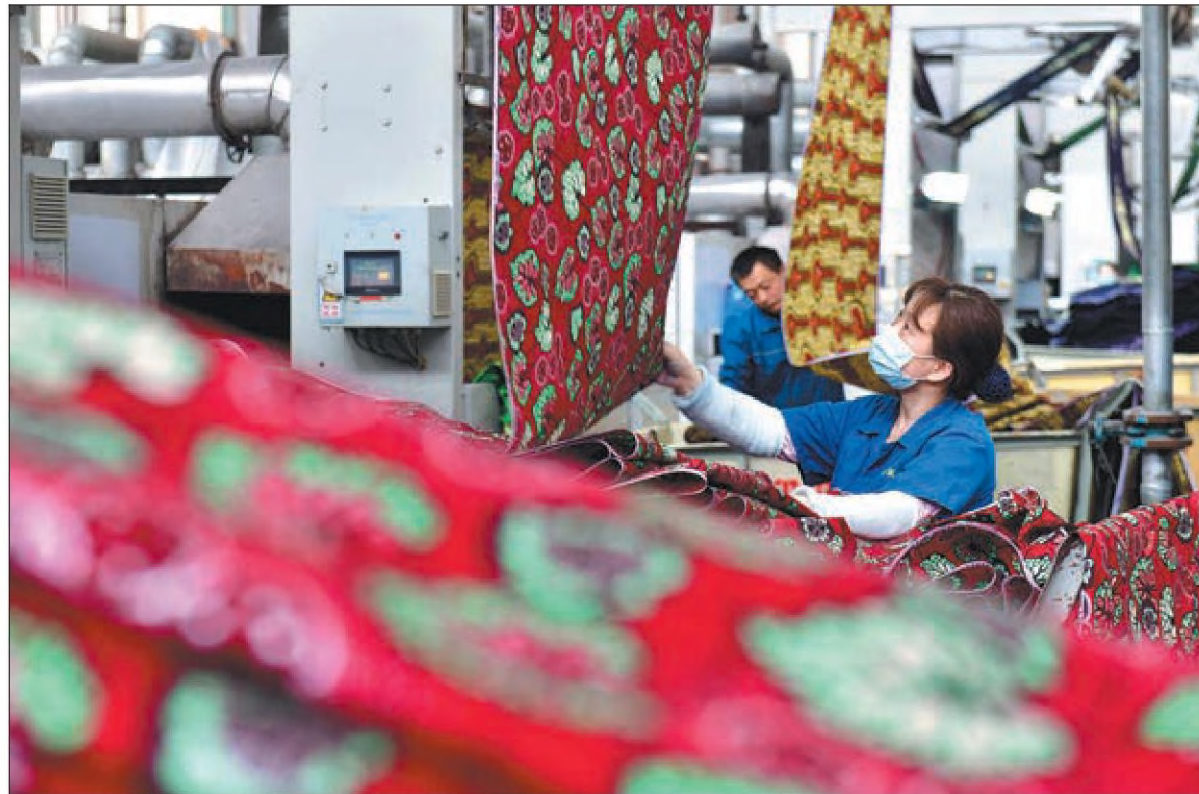
Employees work on Africa-bound fabric products at a textile company in Binzhou, Shandong province.

China mainly exports steel, computers, construction machinery, trains, trucks and buses, building materials, manufacturing equipment, electronics, pharmaceuticals and medical equipment, garments