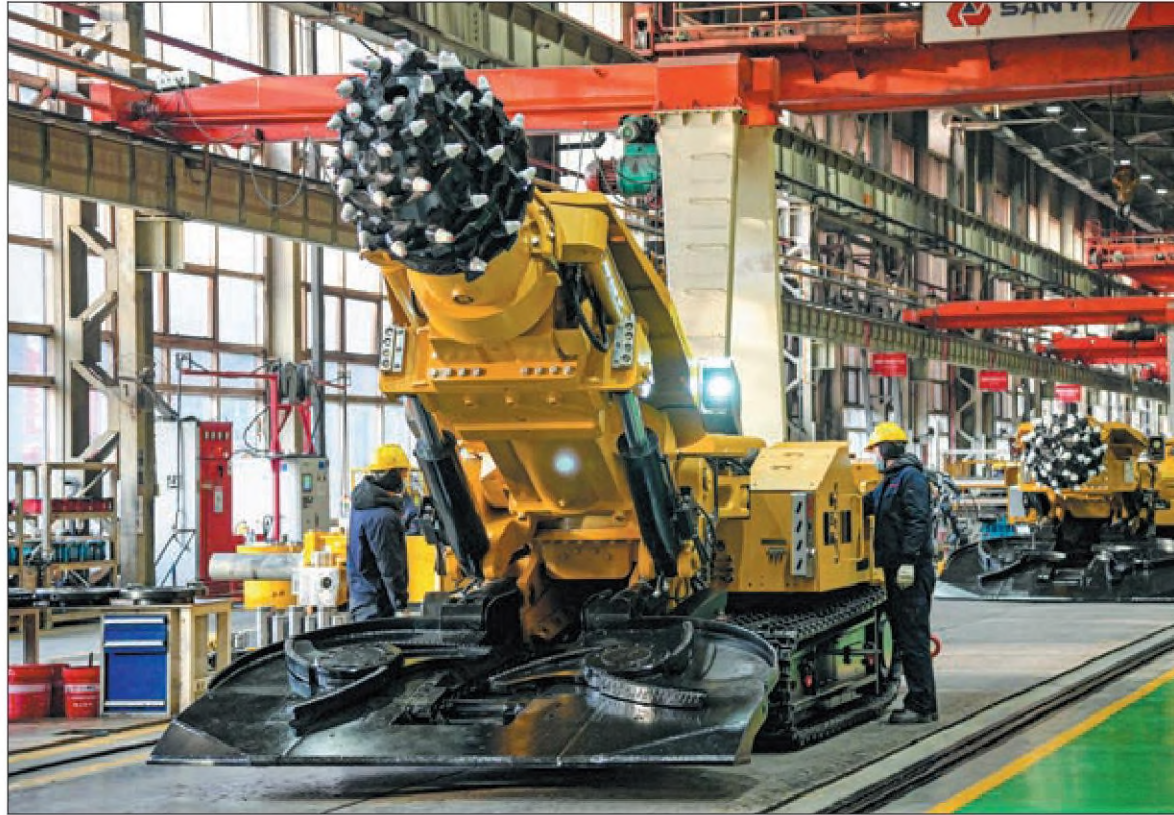
Workers operate an assembly line of smart excavators at Sany's factory in Shenyang, Liaoning province, in February 2023.