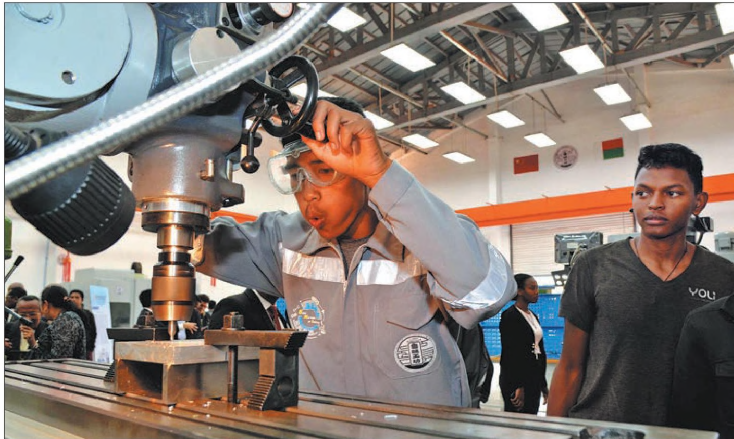
Students from the University of Antananarivo operate machines at the Luban Workshop in the capital of Madagascar on April 26.