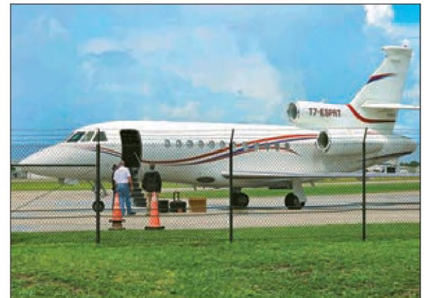
Venezuelan President Nicolas Maduro's aircraft is seen in Fort Lauderdale, Florida, on Monday, after being seized by US law enforcement officials.

Meanwhile, the US State Department offered a reward of up to $15