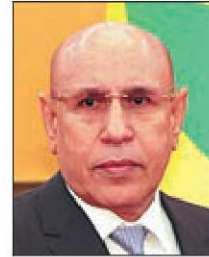
Mohamed Ould Cheikh Ghazouani

President Xi Jinping and visiting Mauritanian President Mohamed Ould Cheikh Ghazouani jointly announced the elevation of bilateral relations to a strategic partnership during their meeting in Beijing on Tuesday.