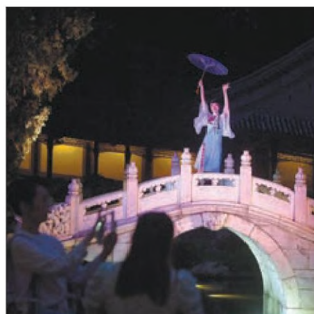
A weekend performance featuring folk music in the evening at Beihai Park.