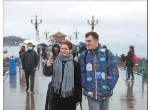
Two Russian students visit Zhanqiao Pier, an iconic scenic area in Qingdao, on Dec 14, 2023.