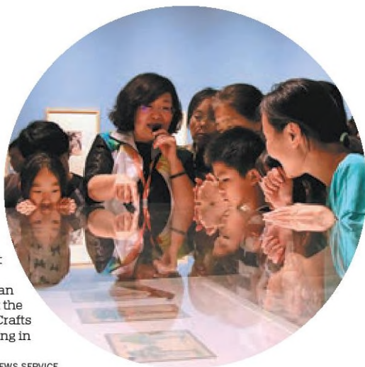
A guide explains an artwork in an exhibition about the Mogao Grottoes during an evening event at the China Arts and Crafts Museum in Beijing in early August.