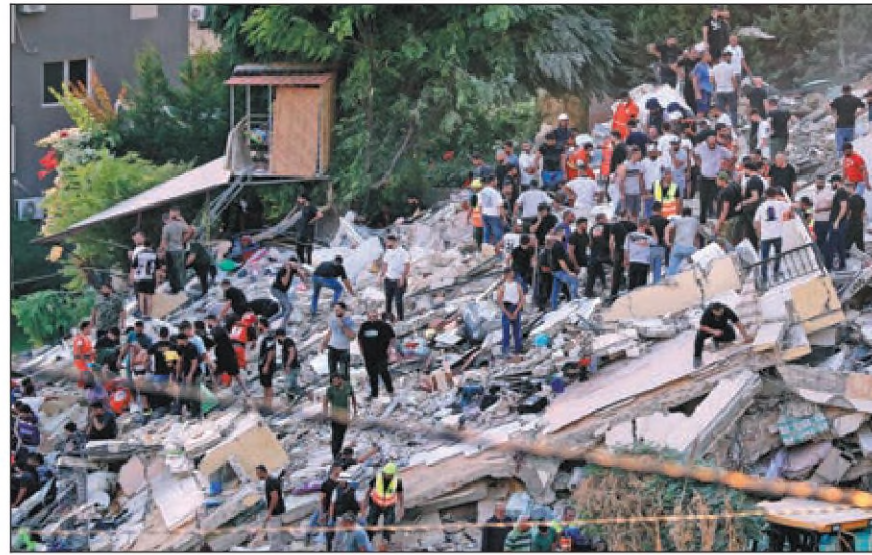
People and rescue workers search for victims after an Israeli airstrike hit two buildings, in a neighborhood east of the southern port city of Sidon, Lebanon, on Sunday.