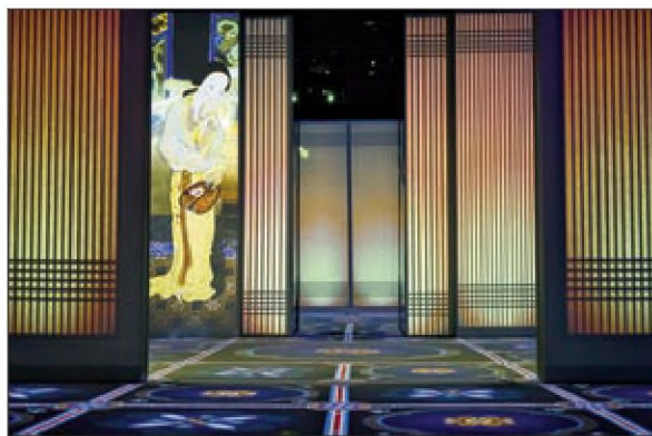
Clockwise from top: An immersive show at Shanghai Museum's new branch enables people to traverse different seasons depicted in Chinese paintings. The exhibition of the Fair Ladies series at Zhejiang Provincial Museum offers an immersive experience. Visitors enjoy a long-screened digital version of a historical painting at Deji Art Museum in Nanjing, Jiangsu province.

5 million visitors. A new digital hall dedicated to a giant bronze tree unearthed at Sanxingdui is planned for next year.