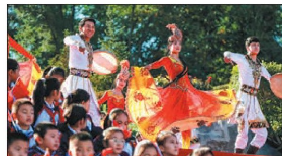
Residents of Urumqi's Shuimogou district take part in an event to celebrate the National Day holiday at Shuita Mountain Park in the Xinjiang Uygur autonomous region on Monday.