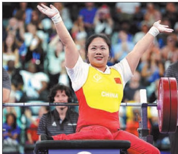
Tan Yujiao of China celebrates clinching gold in the 2024 Paris Paralympics women's 67kg powerlifting on Sept 7.

"It's a cry against my challenging fate, a shout for lifting the weight of my dreams," she explained.