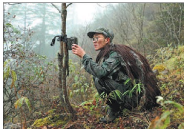
Left: Two patrollers record the location of an infrared camera for convenient retrieval. Middle: A patroller logs data about the bamboo forests. Right: A patroller monitors recordings from an infrared camera installed in the mountains.