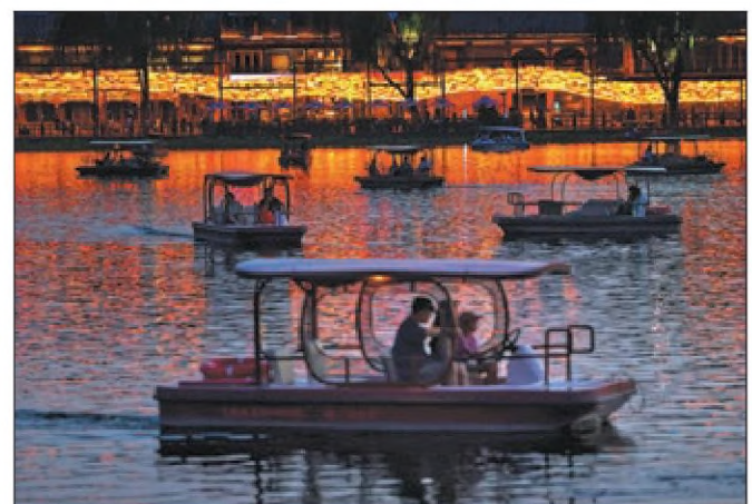
Residents and tourists pedal boats across Shichahai Lake this summer.