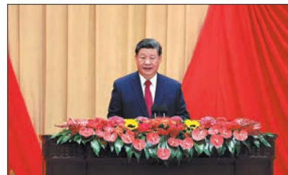
President Xi Jinping delivers a speech on Monday at a grand reception at the Great Hall of the People in Beijing to celebrate the 75th anniversary of the founding of the People's Republic of China.