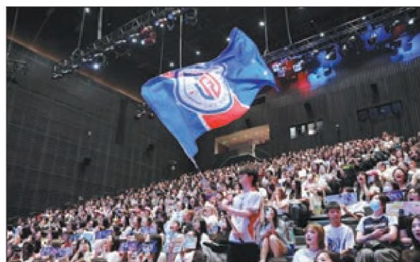
The audience cheers for players from LGD Gaming club during King Pro League Summer 2024 on Aug 14 in Hangzhou.

Contact the writers at qiuquanlin@chinadaily.com.cn