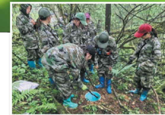
Above: The newly discovered species Impatiens yingjingensis (Balsaminaceae) in the mountains of Daxiangling in Ya'an, Sichuan province. Left: A team of patrollers monitors the impact on reptiles and other small animals as wild pandas tread the forests. Right: Patrollers trek through frigid conditions to investigate the wild panda population.

On a typical day, they head for the mountains at 8 am and don't return until night. They keep records of what the cameras capture and any other observations they make about the mountains.