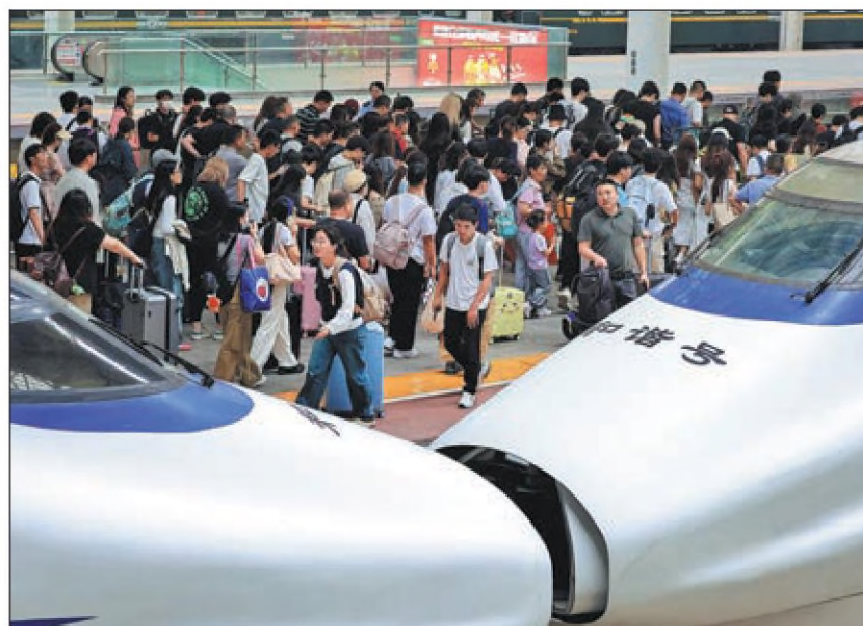
Passengers crowd Nanjing Railway Station in Jiangsu province, on Monday. Trains are expected to make 175 million trips nationwide during the 10-day National Day holiday travel rush.

"China has clearly been focusing on building an ecological civilization by putting a lot of resources in the sector," he said. "That is one of the key reasons we believe the continuous modernization of China will present a huge opportunity to the world."