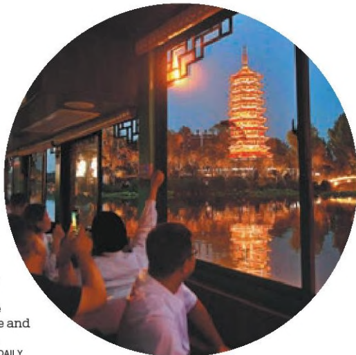
Tourists enjoy the view on a boat during a night tour of the Guihe River organized by the Badaling Culture and Tourism Group.