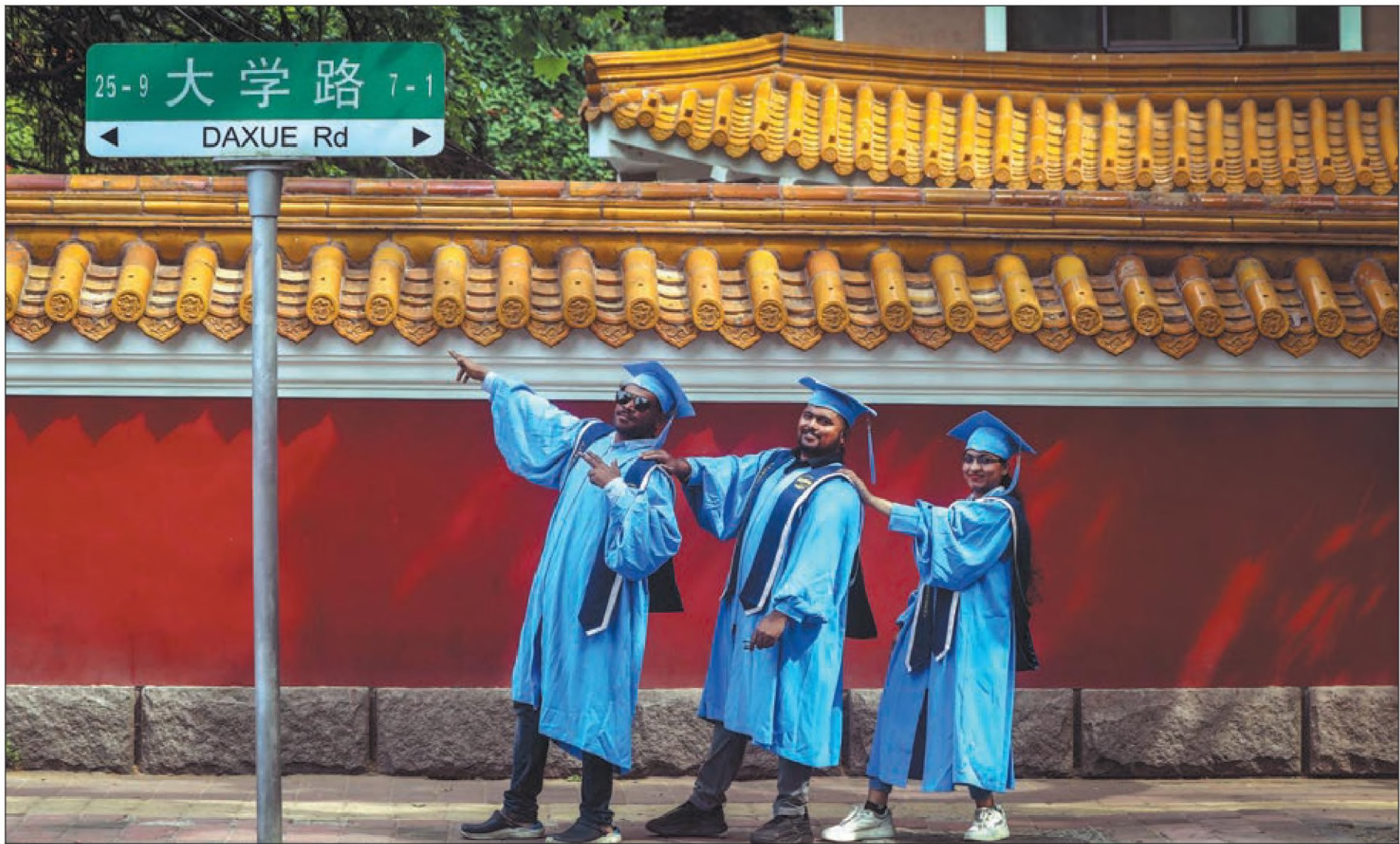
Three Indian students from Qingdao University pose for a commemorative photo at the popular Daxue Road wall before their graduation on June 11, 2024.

Q ingdao, a welcoming coastal city, attracts international students from countries such as Russia, India, and Ukraine, who come to study diverse majors including Chinese, theater and medicine. Immersing themselves in local traditions, they learn martial arts and enjoy Tsingtao Beer.