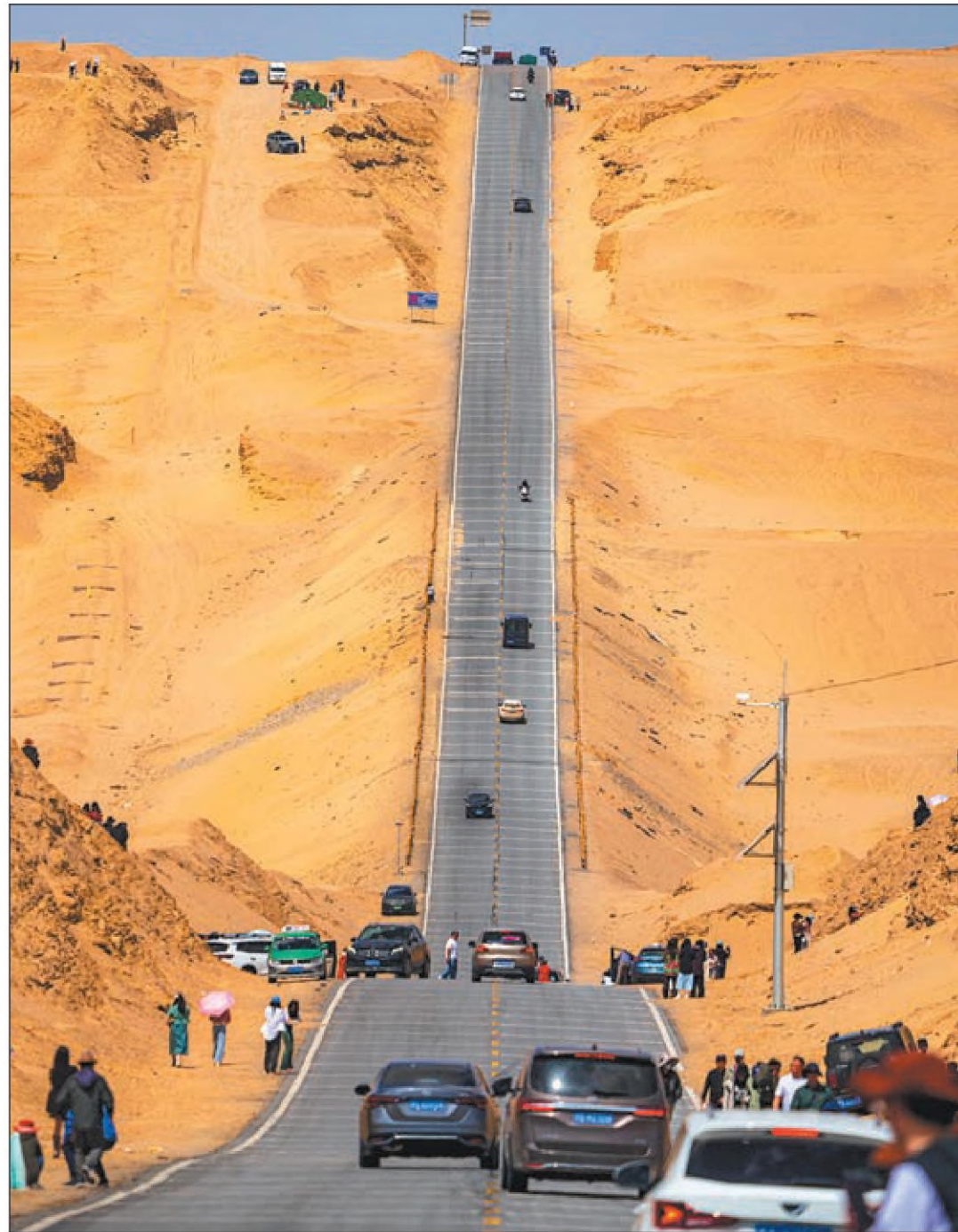
A section of U-shaped road in Golmud, Qinghai province, is popular among self-driving passengers.

"Anji is a place that we have been coming back to for vacations. It's quite convenient to drive there from Suzhou, with beautiful scenery along the way. Parking lots of local hotels are equipped with charging stations for new energy vehicles,