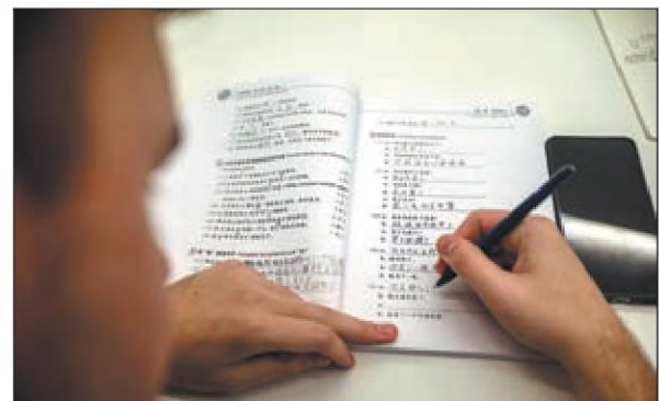
A Russian student studies Chinese in Qingdao on Dec 14, 2023.