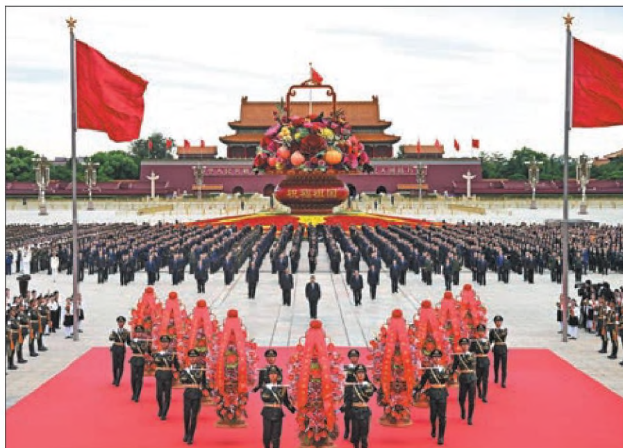
Top: President Xi Jinping walks in tribute around the Monument to the People's Heroes at Tian'anmen Square in Beijing on Monday at an event to mark Martyrs' Day, which is annually observed one day before National Day.