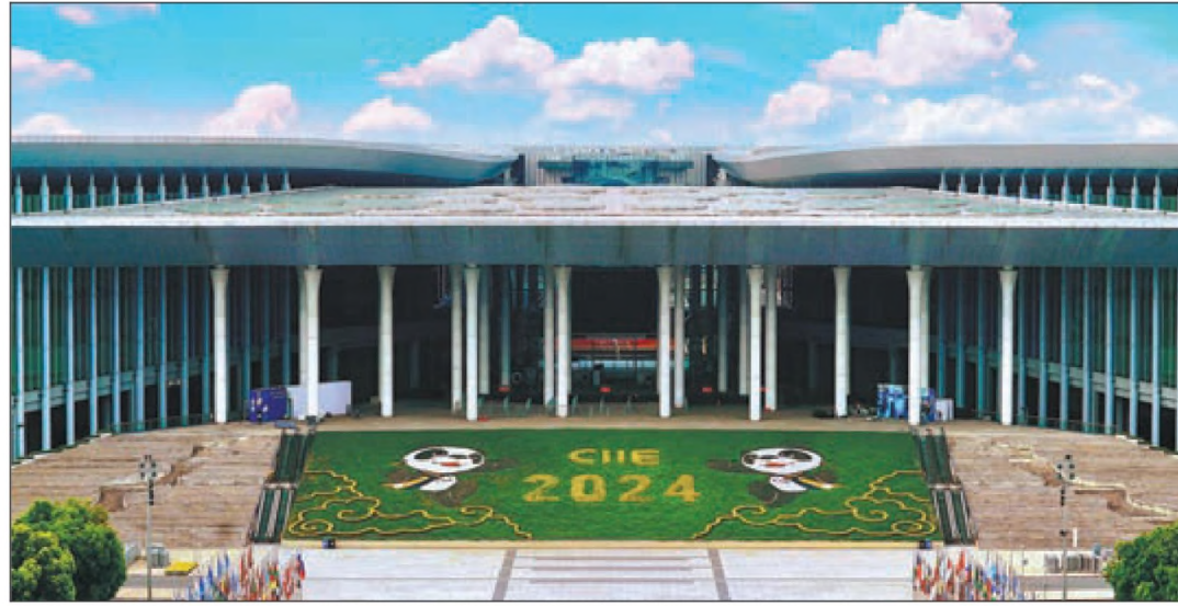
The South Square at the National Exhibition and Convention Center (Shanghai), where the seventh CIIE will be hosted.

The 2024 edition is set to welcome more than 70 countries and international organizations, surpassing last year's participation. First-time participants such as Norway, Slo-