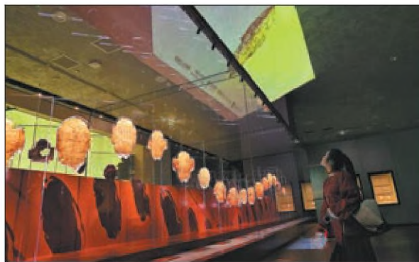
From left: Immersive technologies have been used in ongoing exhibitions in museums, including one about Sichuan province's Sanxingdui Site held at the Capital Museum East Branch in Beijing; an exhibition about figure paintings across the ages collected by the Palace Museum in the capital; and an oracle-bone exhibition at Yinxu Museum in Anyang, Henan province.