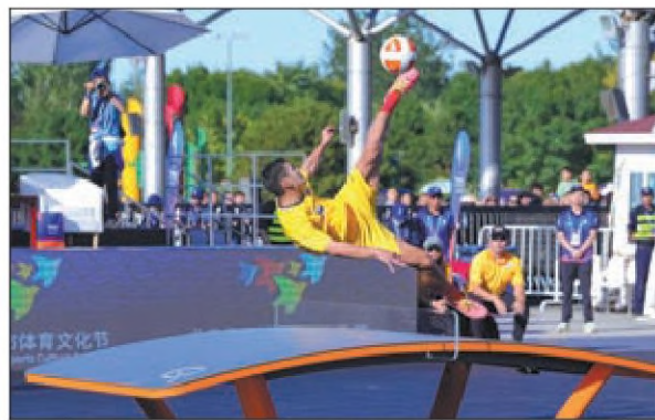
Phakpong Dejaroen of Thailand in action at the Teqball World Series Beijing on Sept 22.