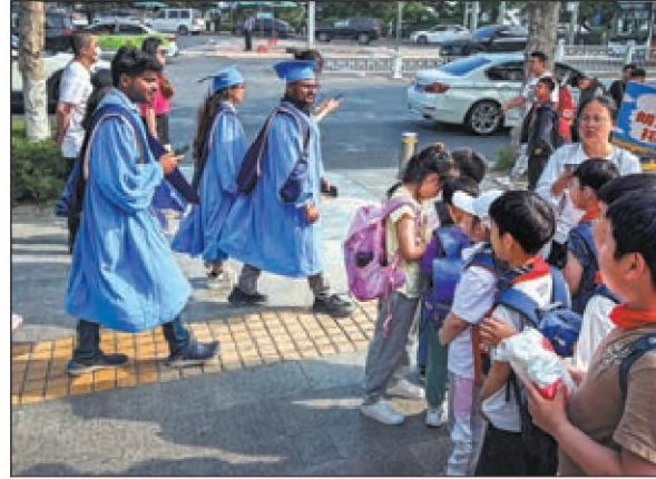
Indian students catch the attention of primary school students while crossing a road on way to their graduation ceremony in Qingdao on June 11, 2024.