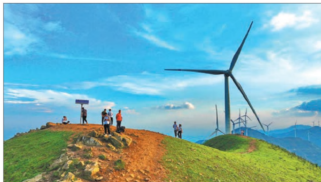
Tourists enjoy a scenic spot in Ganzhou, Jiangxi province.