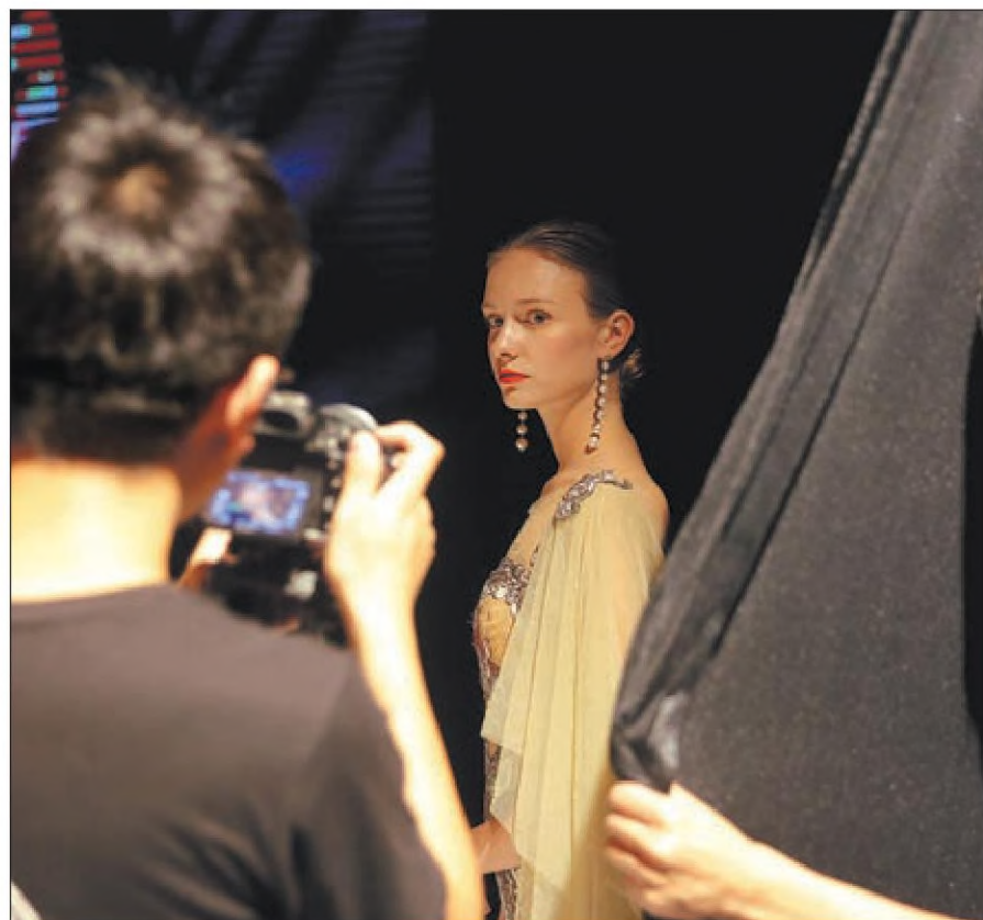
A Russian girl studying in Qingdao spends her weekends working as a fashion model on June 17, 2017.

As they approach graduation, aspirations take shape — some dream of pursuing careers in medicine or engineering, while others seek to bridge cultural gaps through language and art. Having forged strong connections and enjoyed personal growth through their cultural exchanges, many choose to stay on in this vibrant city. Every corner of this city is imbued with the dreams and hopes of those who choose to call it home, if only for a little while.