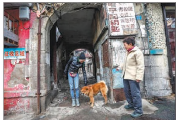
A foreign student pats a local resident's dog while strolling through the old town on Dec 20, 2015.