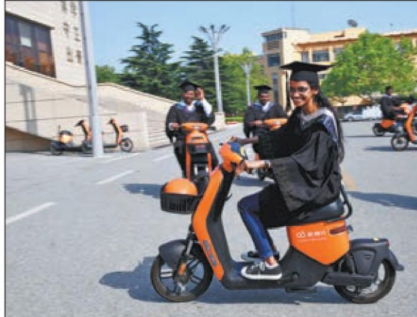
Students ride e-bikes to get their graduation photographs clicked on the campus of a university in Qingdao on June 17, 2024.