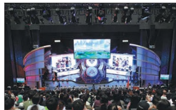
Players compete during King Pro League Summer 2024, the highest Honor of Kings league tournament, on Aug 17 in Hangzhou.