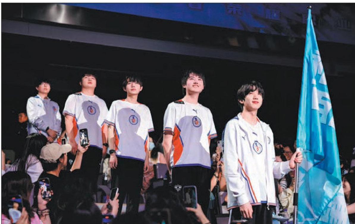
Members of LGD Gaming club enter the arena of King Pro League Summer 2024 in Shanghai on Aug 29.

China's younger generation is setting the pace as Honor of Kings and other online battle games take the world by storm