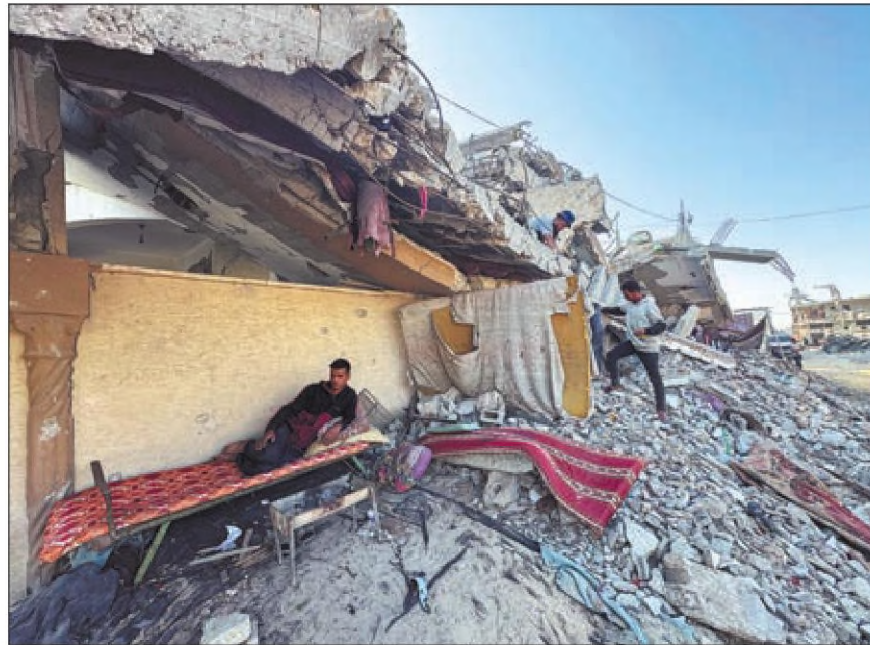
A Palestinian man rests in front of the ruins of his house, which was destroyed in an Israeli military offensive, in Khan Younis, southern Gaza Strip, on Monday.

"The rules of safety and security will open ground toward implementing sustainable urban development in Palestine which is in consensus with the objective of the UN," he said.