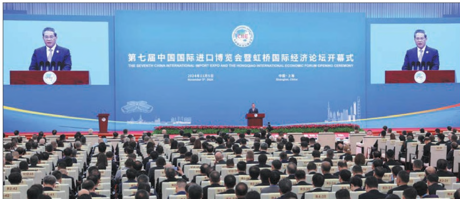
Premier Li Qiang delivers a keynote speech on Tuesday during the opening ceremony of the Seventh China International Import Expo and the Hongqiao International Economic Forum in Shanghai. The expo, which runs through Sunday, has attracted about 3,500 exhibitors from 129 countries and regions.

GLOBAL EDITION 中国日报 WEDNESDAY, NOVEMBER 6, 2024