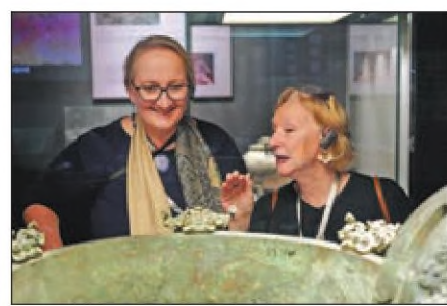
Left: Participants of the "Exploring China" Henan Tour admire a bronze ware at Henan Museum in Zhengzhou city. Right: Experts attending the first World Conference of Classics visit Jinsha Site Museum in Chengdu, Sichuan province, on Monday.

from his Chinese doctoral student in London and his brother, a Chinese language translator who often travels to China for work. Both suggested that given his passion for history, archaeology and art, he would find his visit to Henan particularly captivating, which he does.