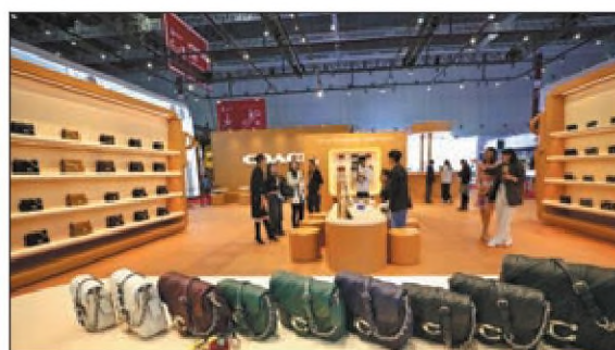
Consumer products on display at the ongoing China International Import Expo in Shanghai.

This agreement further strengthens cooperation between the two companies in natural gas. Natural gas is an important enabler for realizing China's energy transition and dual carbon goals, Niu said.