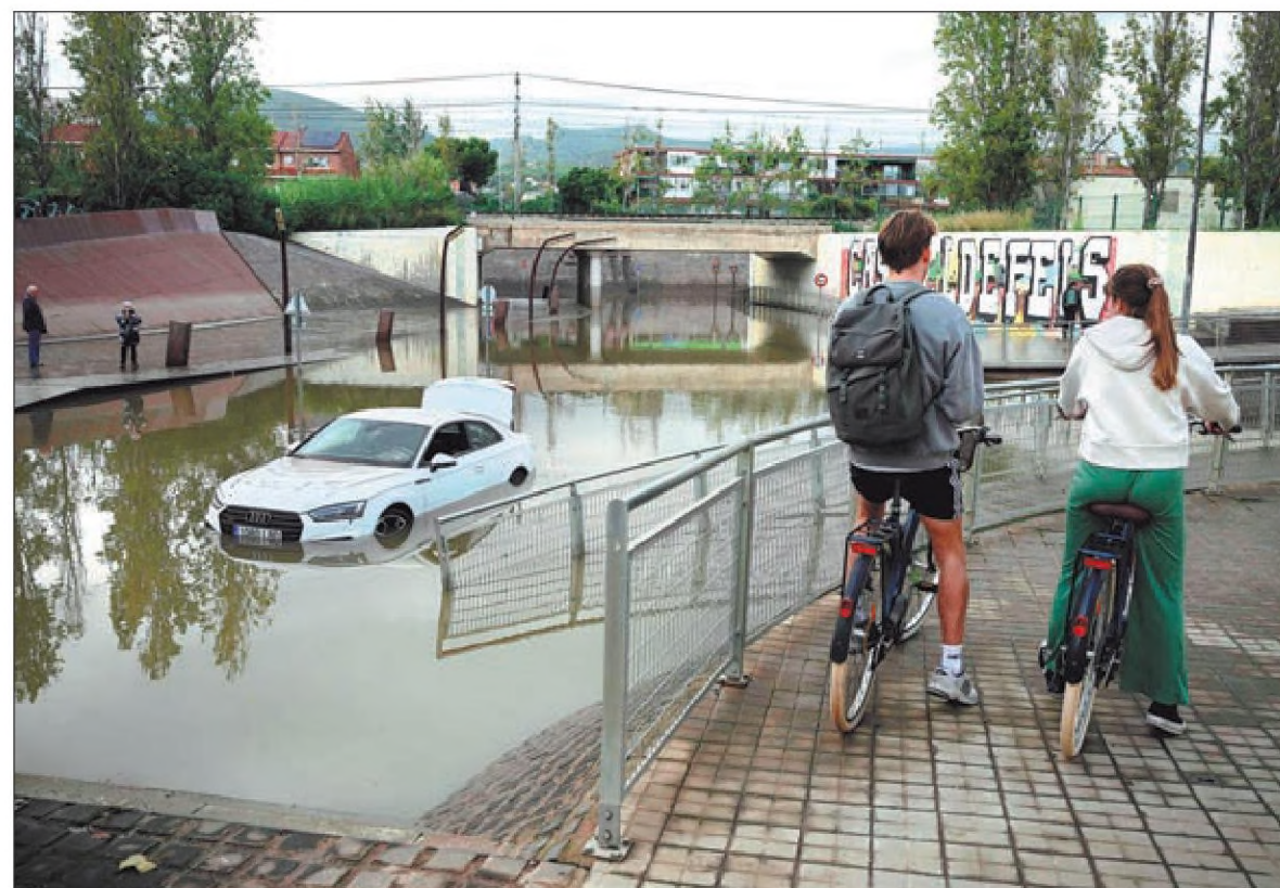
A car lies partially submerged in floodwaters in the Barcelona suburb of Castelldefels on Monday after torrential rains drenched Catalonia. Spanish authorities remained on highest alert as rain pounded the northeast of the country, barely days after severe flash floods killed 218 people in the Valencia region. Telephone alerts urged residents to practice utmost caution.