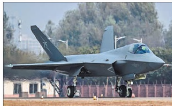
A file photo released on Tuesday shows a J-35A stealth fighter jet taxiing on a runway.

In addition to the J-35A, the J-20 and Russia's Sukhoi Su-57 are also set to take part in the coming Zhuhai event. If that happens, it will be the first time in the world that three models of stealth combat jets appear in the same show.