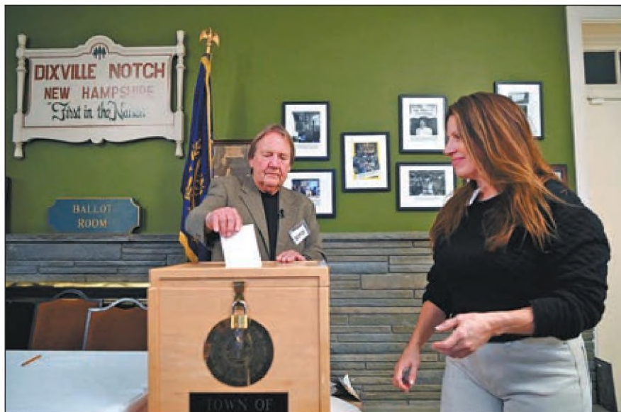
A moderator helps a voter (right) cast her ballot for the 2024 presidential election in Dixville Notch in New Hampshire, northeastern United States, on Tuesday. Six registered voters in the tiny town voted early Tuesday morning, marking the official start of Election Day.

A Des Moines Register poll over the weekend had Harris leading in