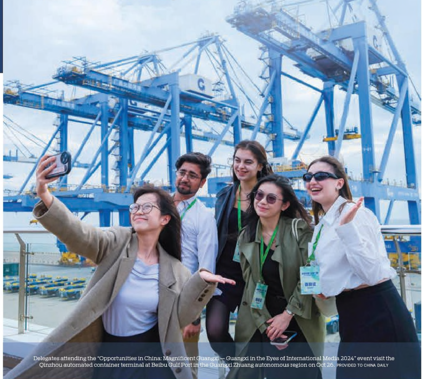
Delegates attending the "Opportunities in China: Magnificent Guangxi — Guangxi in the Eyes of International Media 2024" event visit the Qinzhou automated container terminal at Beibu Gulf Port in the Guangxi Zhuang autonomous region on Oct 26.

Gen Z delegates from around the world explore Guangxi's lesser-known cities, experiencing their rich cultural heritage, modernization efforts, and commitment to environmental protection.