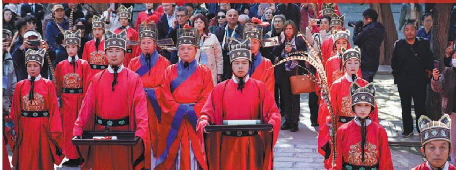
Above: Classical studies scholars from China and overseas participate in a ceremony to pay homage at the Temple of Confucius in Qufu, Shandong province, on Tuesday. Below: Visitors look at a statue at an exhibition to mark the inaugural World Conference of Classics, The Countless Aspects of Beauty in Ancient Art , jointly organized by the National Museum of China and the Hellenic National Archaeological Museum that opens in Beijing on Wednesday.

Beijing event to examine legacy of ancient civilizations and their relevance to the modern day, Fang Aiqing reports.