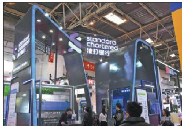
Standard Chartered's booth during a supply chain expo in Beijing in December 2023.