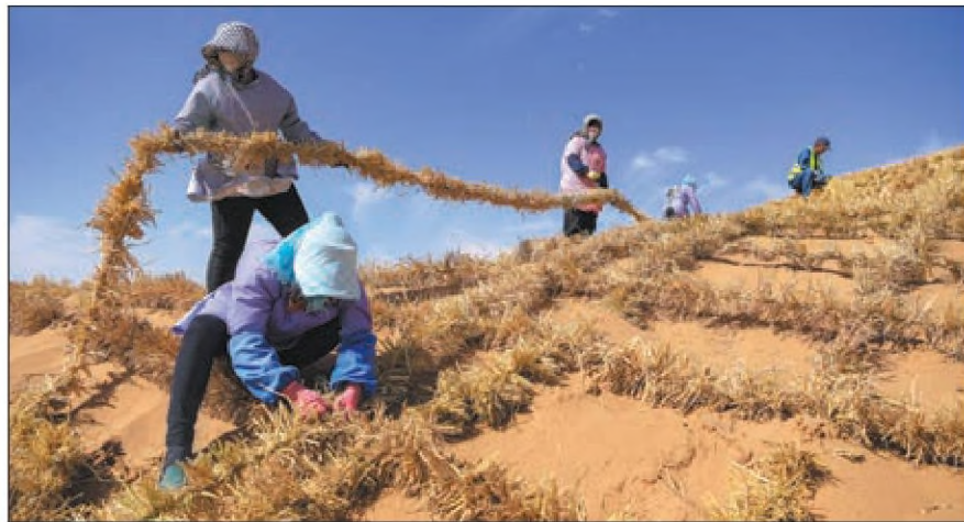
Workers plant grass grids for sand control in the Tengger Desert in Zhongwei, Ningxia Hui autonomous region, on May 30.