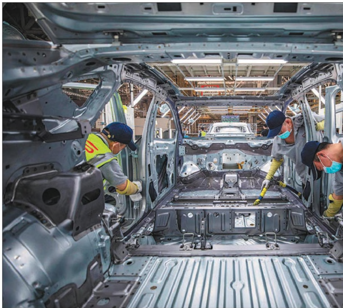
Employees work on a Volkswagen smart production line in Hefei, Anhui province, in September.