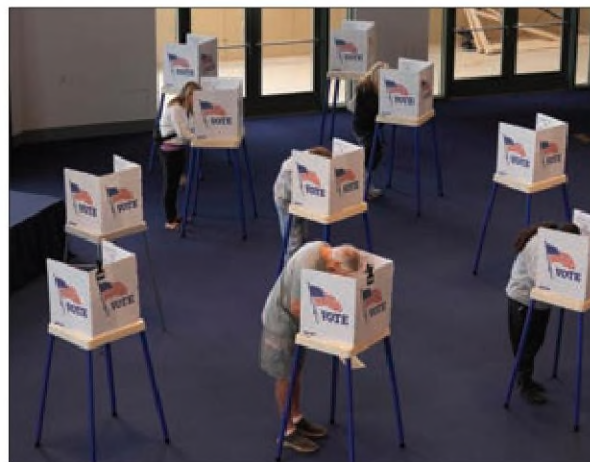
Voters work on their ballots at a polling place at the Ronald Reagan Presidential Library on Election Day, Tuesday in Simi Valley, California.