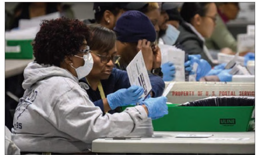
Philadelphia County board of elections staff process mail-in ballots at the ballot counting election warehouse on the outskirts of Philadelphia on Tuesday.