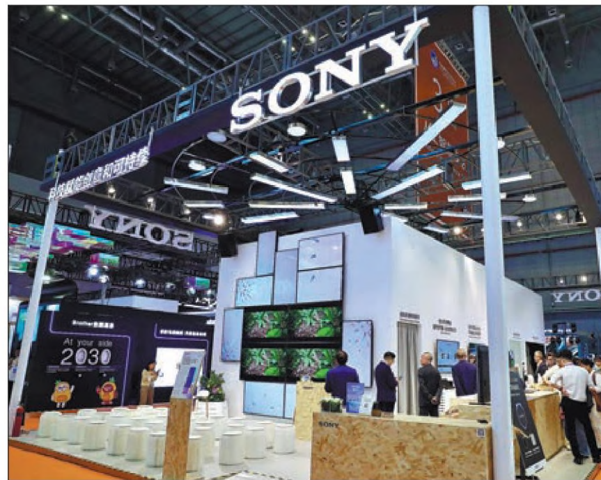
A view of Sony's booth at the 7th China International Import Expo in Shanghai.