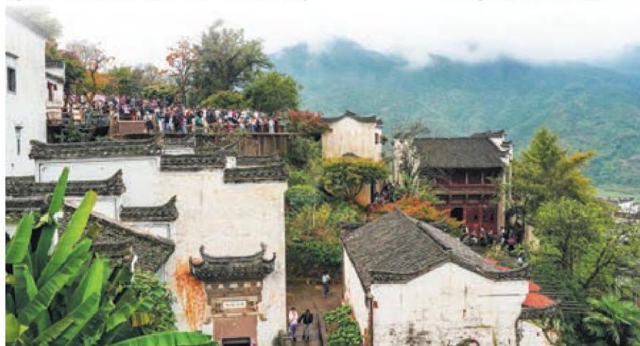
Tourists visit an ancient village at a scenic area in Wuyuan county, Jiangxi province, in November.