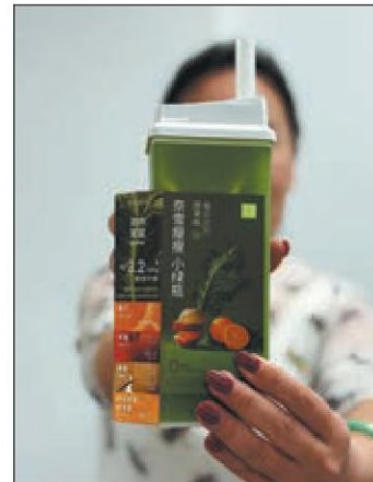
Left: A juice containing kale sold by the tea chain Naixue.

The global vegetable juice market is expected to grow at a compound annual growth rate of 5.8 percent from 2024 to