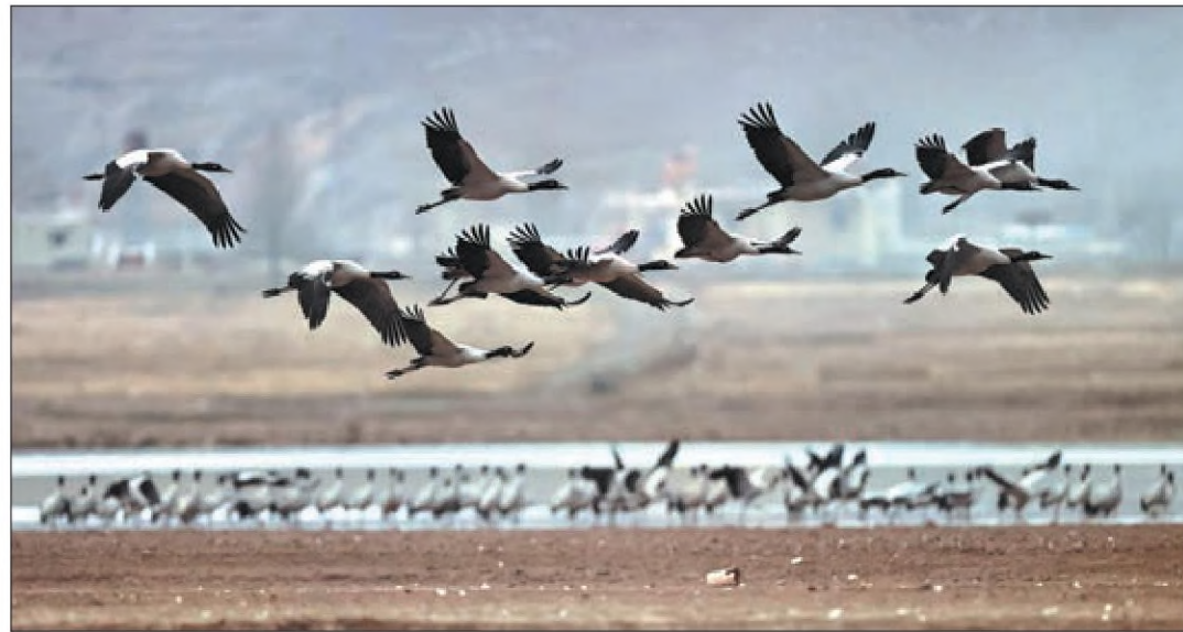
Black-necked cranes winter at a reservoir in Lhundrub county, Lhasa, Xizang autonomous region, on Saturday. When it gets warmer, they will fly to areas including the Siling Lake National Nature Reserve to breed.

In the 1970s, it was estimated that there were fewer than 1,000 in the area.