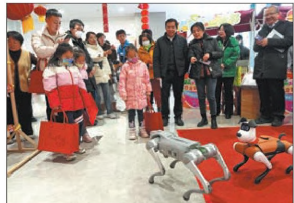
Robotic dogs attract visitors during a recent event in Beijing E-Town.

ing array of AI-driven innovations, robotic dogs make frequent appearances in the public spotlight. Though the quadruped robot sector is still in its nascent commercial phase, an increasing number of Chinese innovators are entering the field, driven by promising market potential.