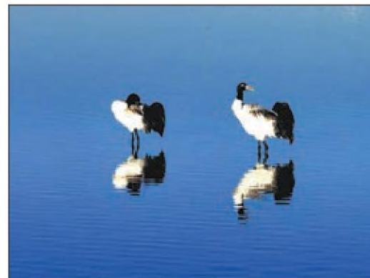
Right: Black-necked cranes winter on Siling Co (Lake) in the Xizang autonomous region.