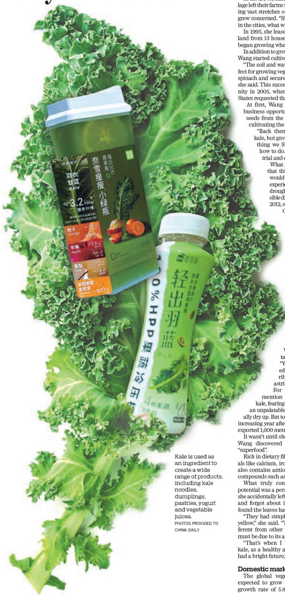
Kale is used as an ingredient to create a wide range of products, including kale noodles, dumplings, pastries, yogurt and vegetable juices.