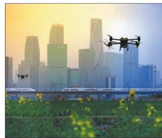
Agricultural drones equipped with high-precision GPS positioning systems and intelligent spray devices soar above wheat fields, spraying pesticides to combat crop diseases and pests in Hangzhou, Zhejiang province, on Tuesday.