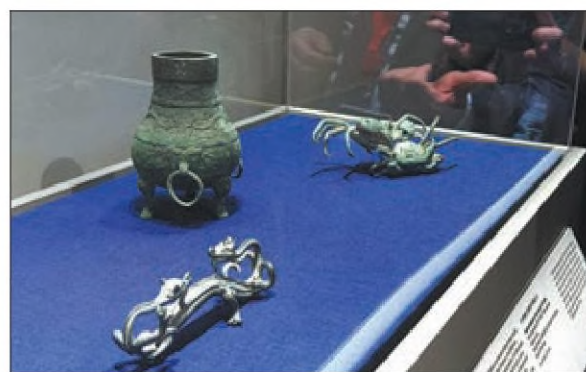
From left: Visitors at the exhibition. A twin dragon brush rest, vessel and crab-shaped bronze, from the Yuan Dynasty (1271-1368).