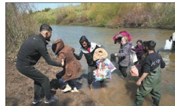
Alawite Syrians wade across the Nahr El Kabir River on Tuesday in Akkar, Lebanon, while fleeing the violence in western Syria, which has left hundreds of Alawites dead.