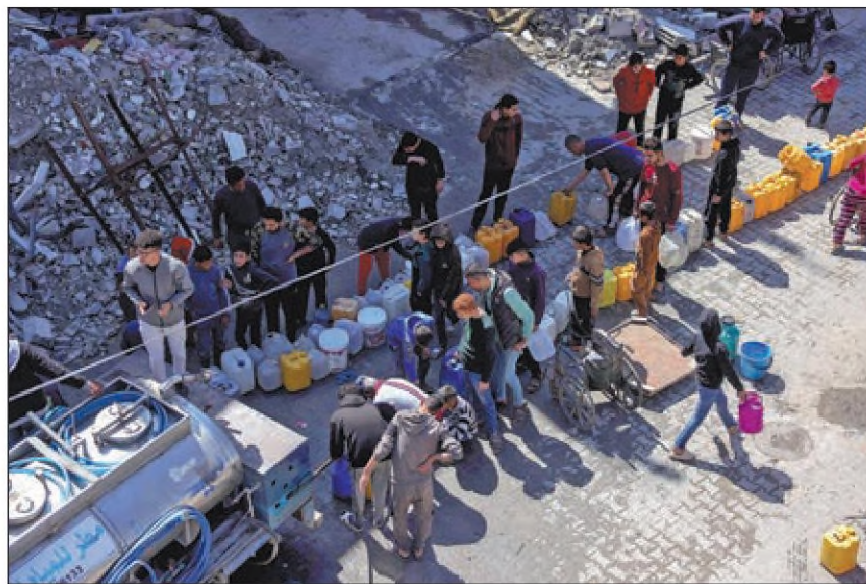
Palestinians wait in line for water next to a distribution truck at a displacement camp west of Jabalia city in the northern Gaza Strip on Tuesday.

Agencies and Xinhua contributed to this story.