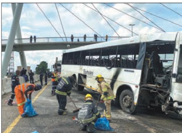
Emergency responders clear the site of a bus accident in South Africa's Gauteng Province on Tuesday. At least 16 people were killed after the bus overturned on a highway in Ekurhuleni, near Johannesburg's OR Tambo International Airport.