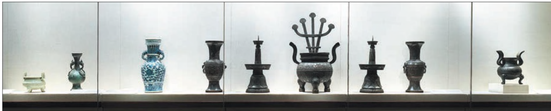
Above: The Shanghai Museum and The Metropolitan Museum of Art collaborated on a new exhibition at The Met, showcasing Chinese bronzes, as well as a selection of paintings, calligraphy, ceramics, and lacquer and jade items. Below: A visitor takes a photo of a bronze artifact during the ongoing exhibition, Recasting the Past: The Art of Chinese Bronzes, 1100-1900.