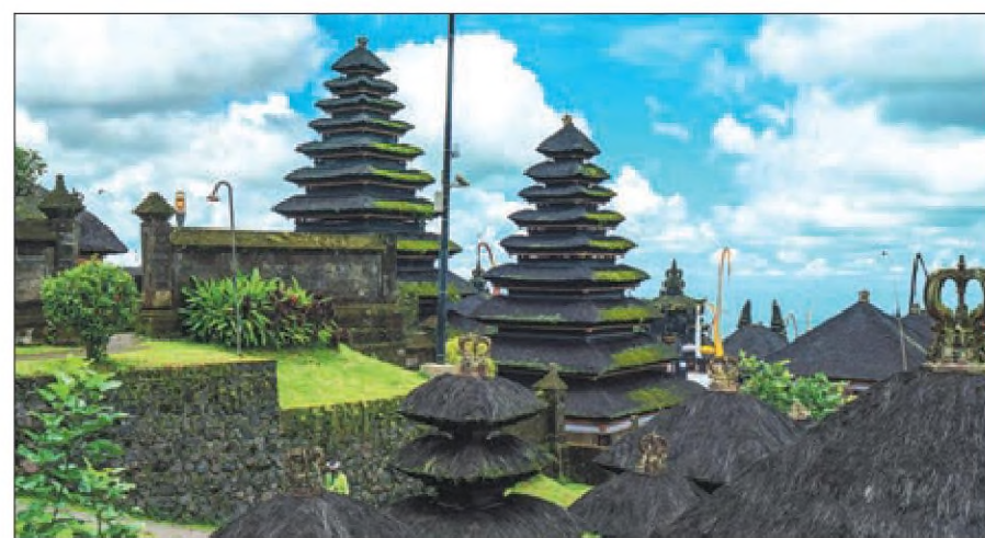
Besakih Temple in eastern Bali, Indonesia.

"We want assertiveness (from the local government) and we will be glad to accept legal foreign workers to partner with Indonesians," he said, adding he called for the author-