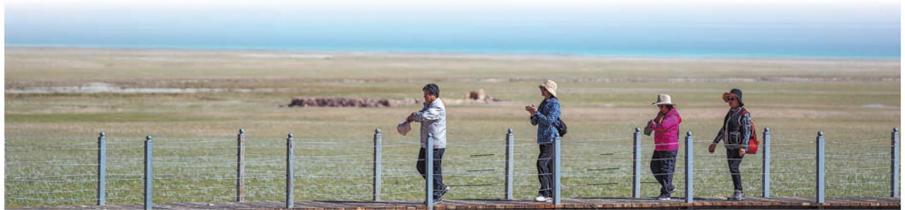
Tourists walk a raised path by the Siling Co (Lake) in the Xizang autonomous region in June. The lake and its surrounding natural reserve serve as an important habitat for black-necked cranes.

Shi Yudie, Zhang Lina and Yang Meiduo contributed to this story.