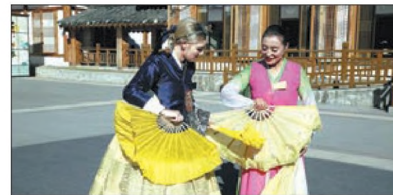
A foreign tourist learns a traditional dance of the Korean ethnic group at a tourist site in the Yanbian Korean autonomous prefecture, Jilin province.

Contact the writers at zhouhuiying@chinadaily.com.cn