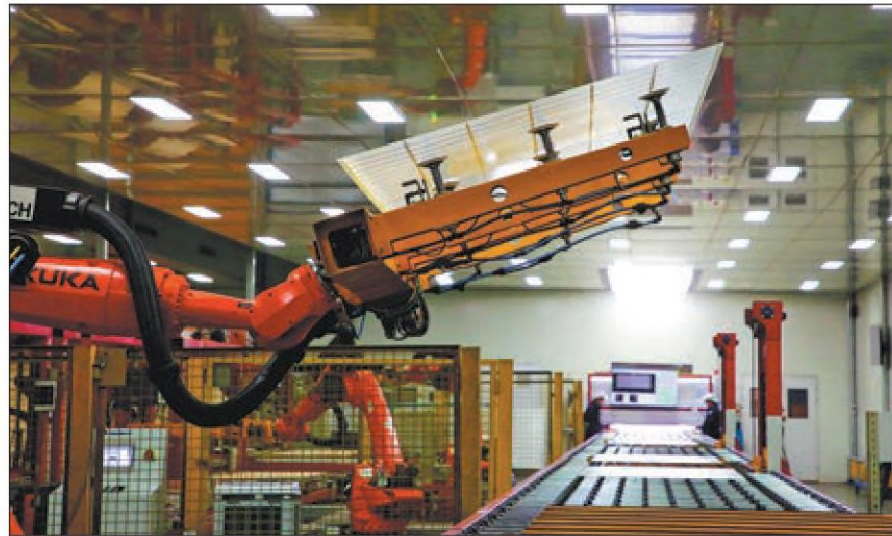
A solar-panel component production line at a private company in Shizuishan, Ningxia Hui autonomous region.