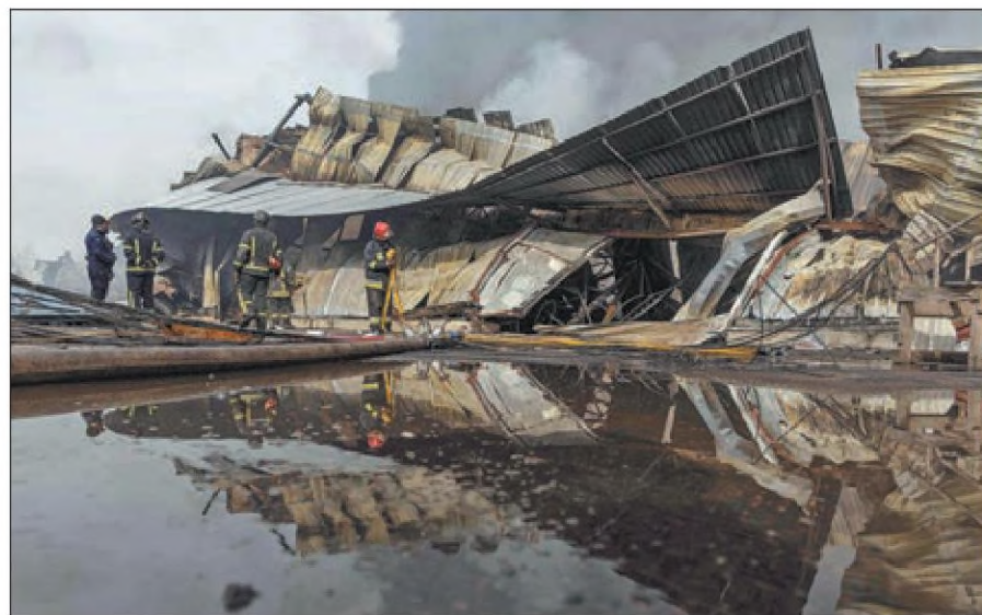
Top: Investigators inspect the damage to an apartment building on which a downed Ukrainian drone fell in Sapronovo village, outside Moscow, Russia, on Tuesday. Russia shot down over 300 drones in the biggest Ukrainian attack on its capital, in which three people were killed and 18 injured. Above: Firefighters work to extinguish a blaze on Tuesday following a strike on the outskirts of Odesa, Ukraine. The overnight strike on the port city killed four people and damaged a cargo ship. The country's air force said that Russia had launched 126 drones and one ballistic missile.