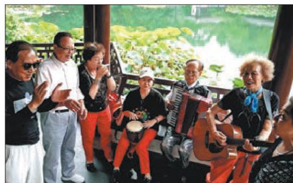
Members of the band rehearse at Qu Yuan Fenghe Park in Hangzhou.