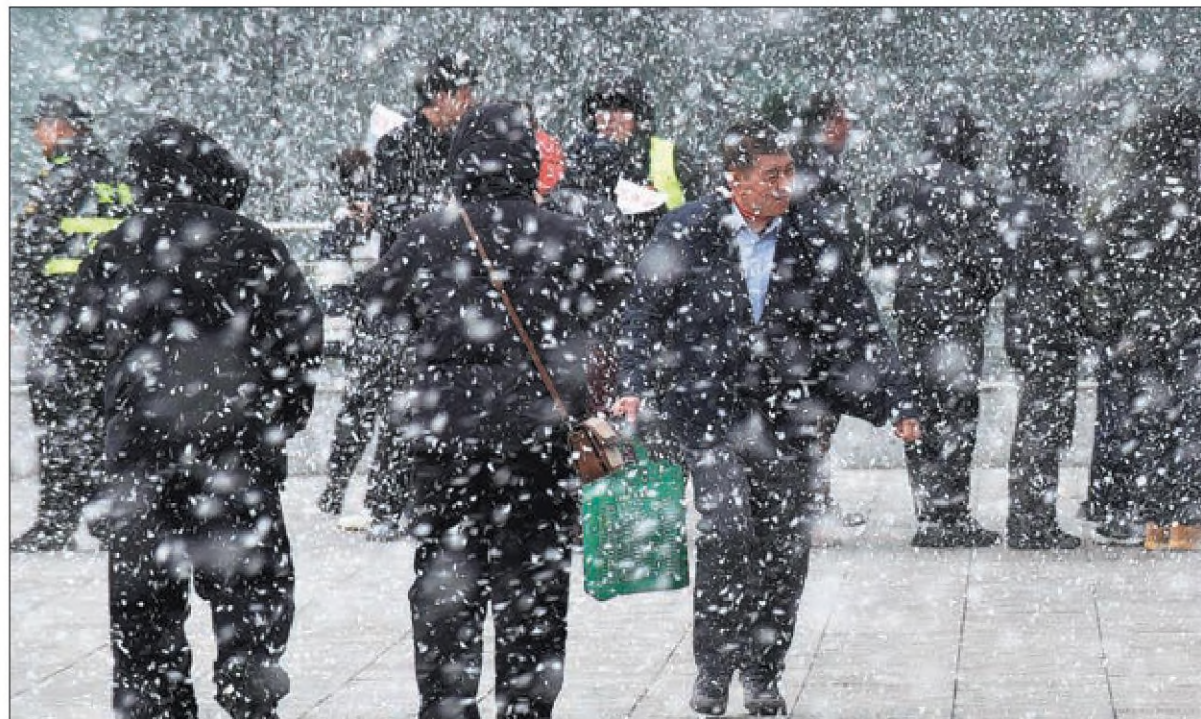
People forge ahead despite being caught off guard by a short but intense sudden snowfall outside the Harbin International Convention and Exhibition Center in Harbin, Heilongjiang province, on Wednesday. Harbin was hit with snowfall that day following a drop in temperature caused by a cold front.