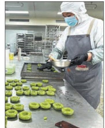
Right: A worker uses kale to make cakes at a workshop in Gaomi, Shandong province.