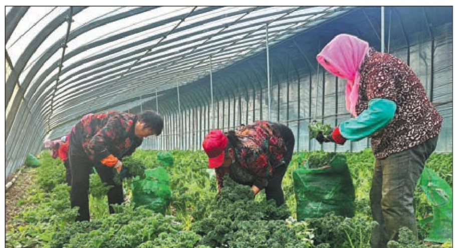
Right: Farmers harvest kale in a greenhouse in Gaomi in March.