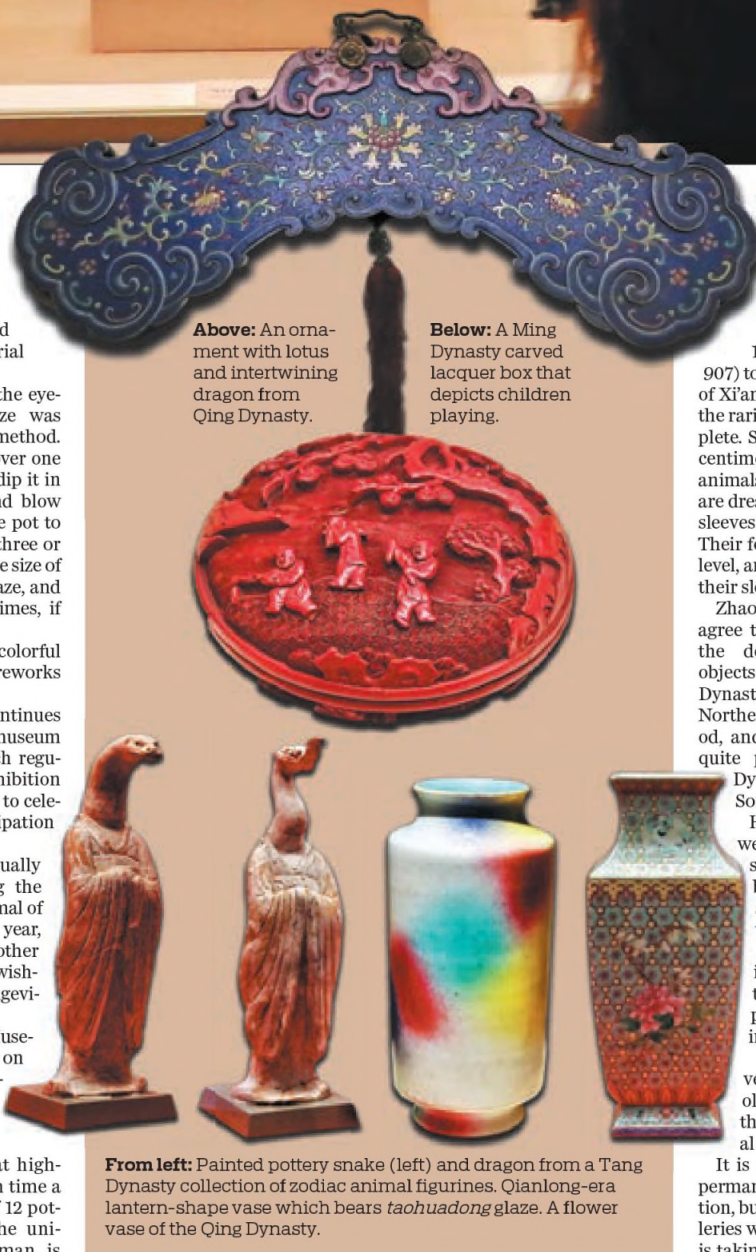
Above: An ornament with lotus and intertwining dragon from Qing Dynasty.

Following a routine that highlights the exhibitions, each time a statue from a collection of 12 pottery zodiac animals in the uniform dress of an ancient man, is