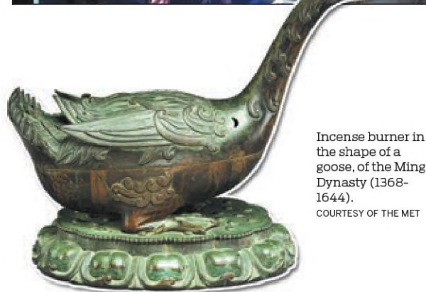
Incense burner in the shape of a goose, of the Ming Dynasty (1368-1644).

um's painting reveals how the incense ducks were depicted in art and in the cultural expressions of the time.