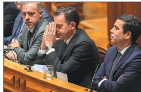
Portuguese Prime Minister Luis Montenegro (center) attends a debate preceding a confidence vote at the Portuguese parliament in Lisbon on Tuesday.