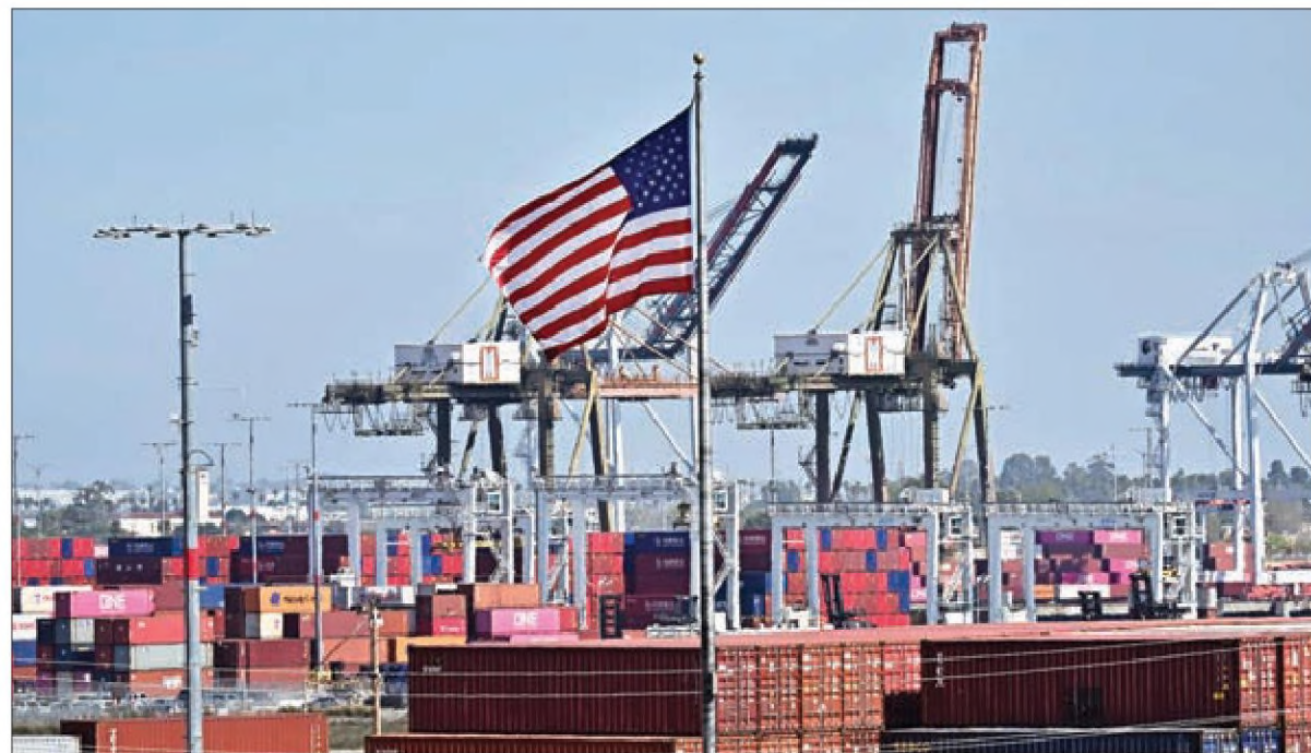
Shipping containers are stacked at the Port of Long Beach in California on March 4.

Since the beginning of his second term, Trump has placed 20 percent tariffs on Chinese imports to the US. He also has threatened to place tariffs of 25 percent and more on goods from Mexico and Canada. But they have