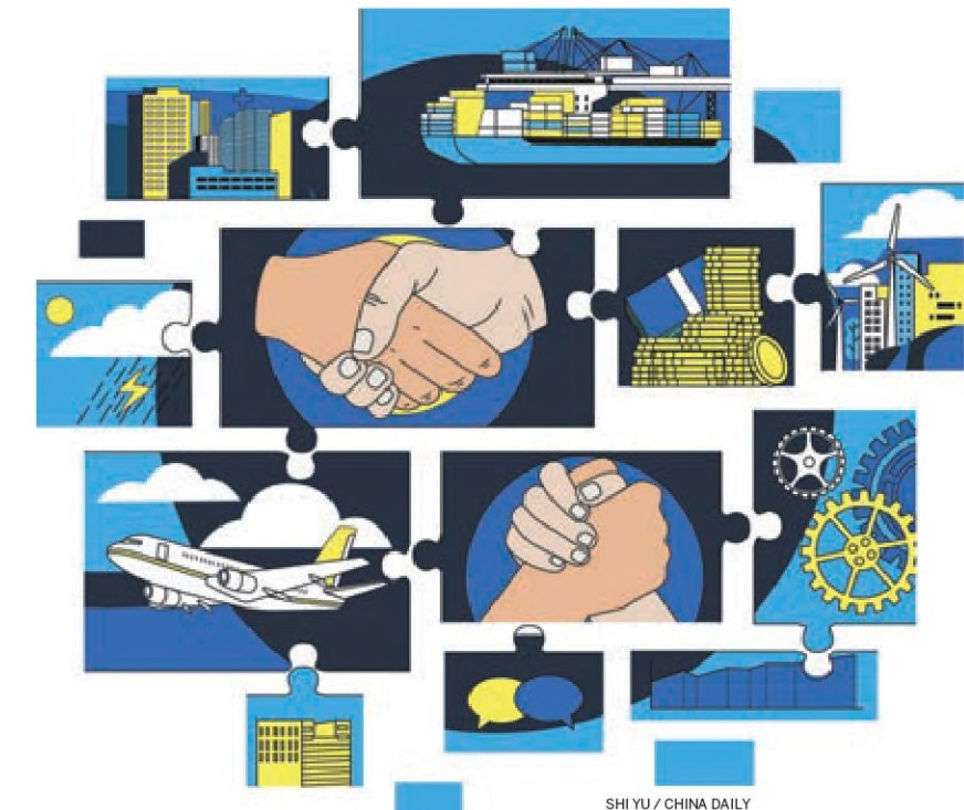
SHI YU / CHINA DAILY

On the one hand, the EU is heavily reliant on its alliance with the US, and on the other, it proclaims itself to be a champion of multilateralism. It is thus stuck in a series of dilemmas: While it pursues strategic autonomy, it is unable to break free from its dependence on the US; it champions multilateralism yet is compelled to follow the US "de-risking" strategy, which goes against the trend of globalization; and while it is struggling to inject new momentum into its sluggish economy, the bloc remains hesitant about deepening cooperation with China in technology and