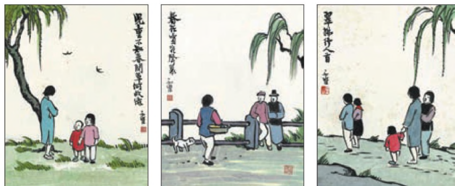
From left: Donated works by Feng Zikai to the China National Academy of Painting include: Not Knowing the Spring Has Come, Spring in the Cries of Flower Sellers, and Willow Sways Across the Hair.