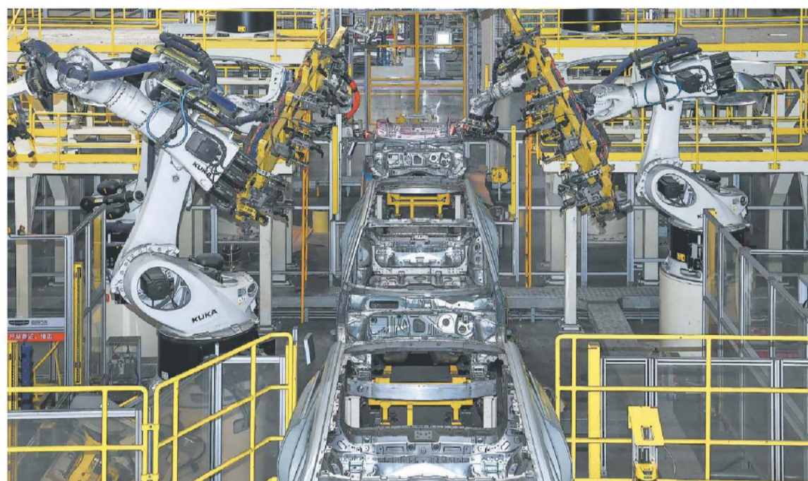
An automated welding line operates at an automobile plant in Baoji, Shaanxi province, on Feb 26.

This supplement is printed and distributed in select areas by the Los Angeles Times Media Group. Received by NSD/EARA Registration Unit 05/20/2025 12:46:14 PM