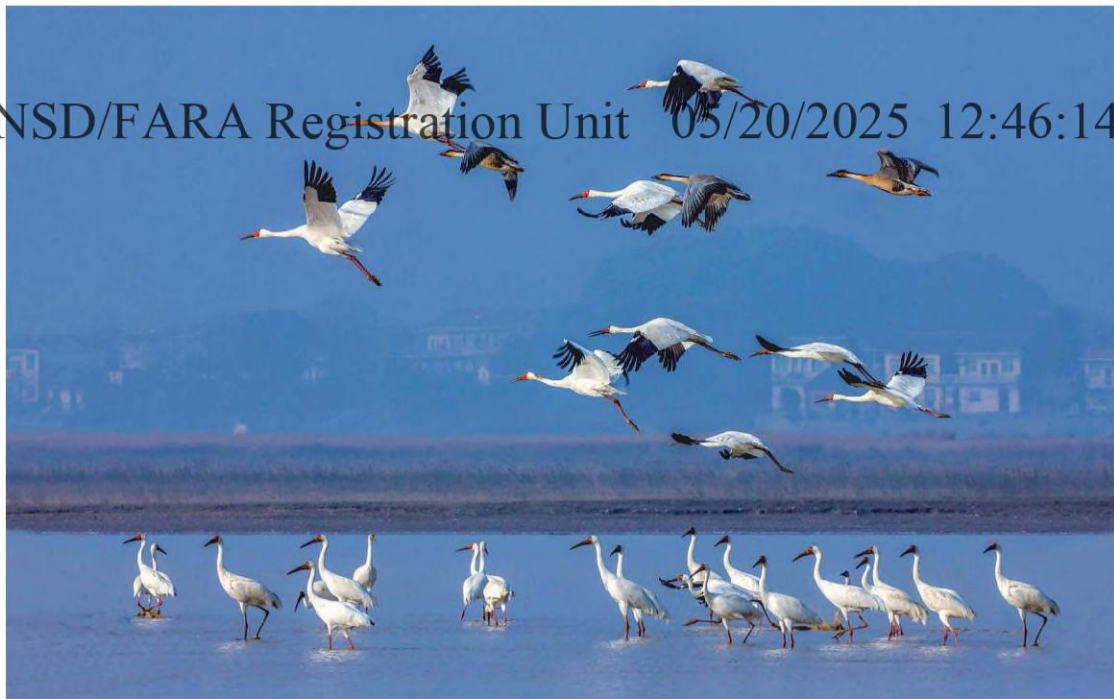
Migratory birds add to the splendor of Poyang Lake in Jiangxi province.