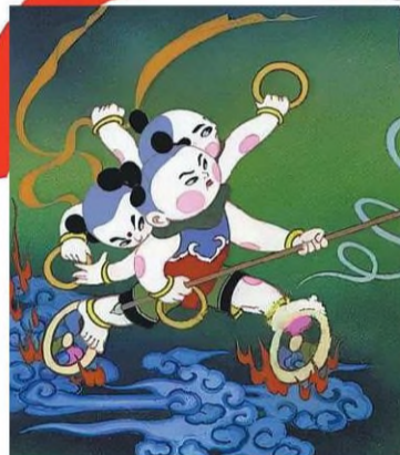
From left: The three-headed Nezha, a character in the 1961 animation Uproar in Heaven.