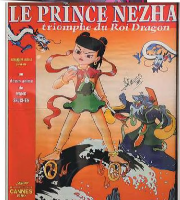
A poster for Nezha Conquers the Dragon King (1979). A drawing of Nezha in a Qing Dynasty (1644-1911) book introducing the characters in Investiture of the Gods.