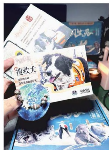
A Chinalife lucky dip for rescue dogs includes a bracelet and a card. By scanning the QR code on the card users can receive a weekly progress report of the rescue dog they are linked to. Animals available for digital adoption at Nanjing Hongshan Forest Zoo in Jiangsu province include red pandas and ring-tailed lemurs.

In this process, animals' data can act as bioindicators, helping