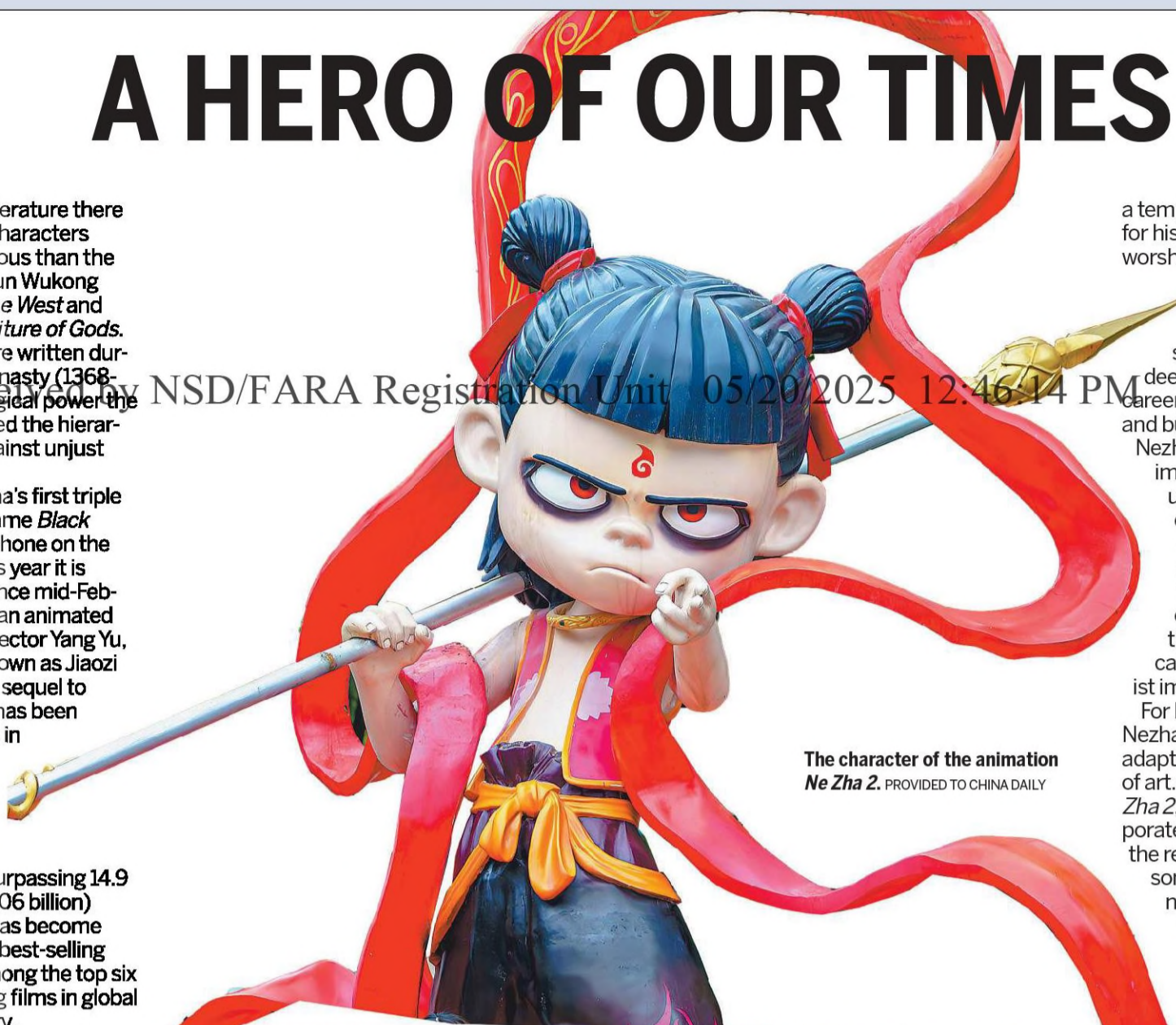
The character of the animation Ne Zha 2.