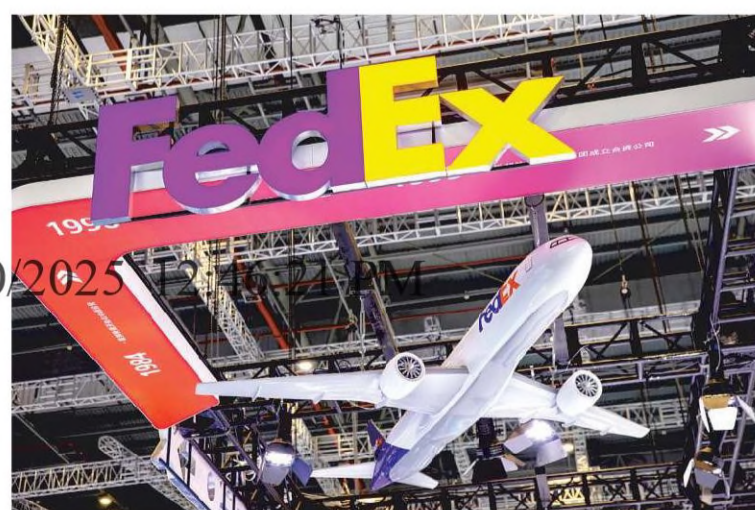
The FedEx booth at the seventh China International Import Expo in Shanghai in November.

These initiatives will improve FedEx's network in China and empower local businesses to capitalize on global trade opportunities with more effi-