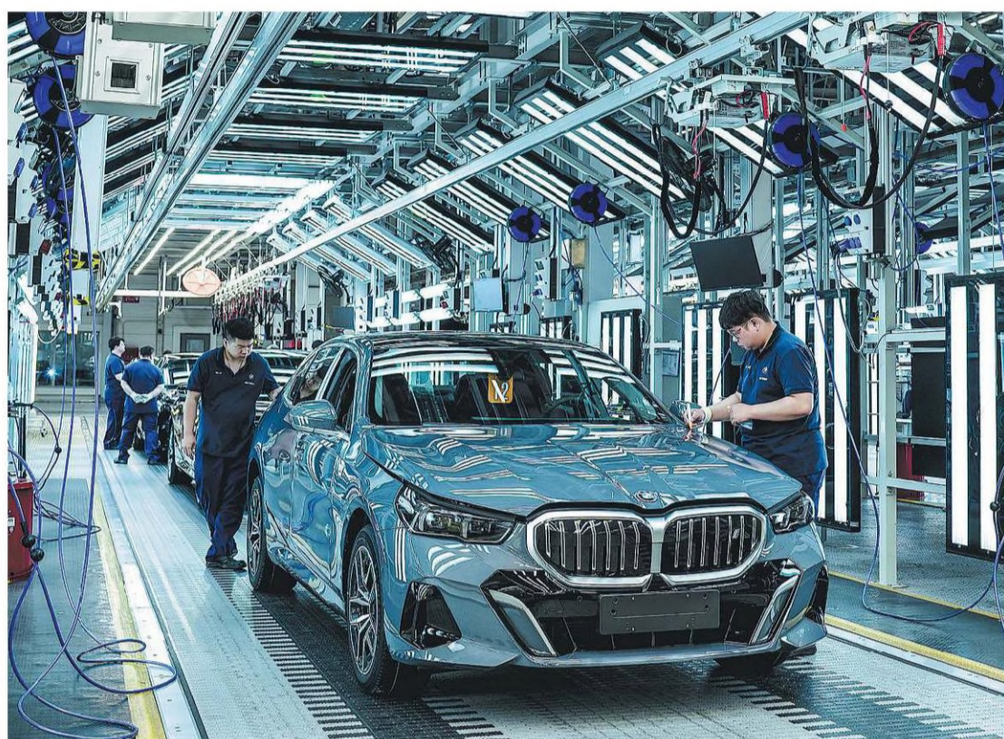
Employees work on a BMW assembly line in Shenyang, Liaoning province.

Another negative list applied in the country's free trade