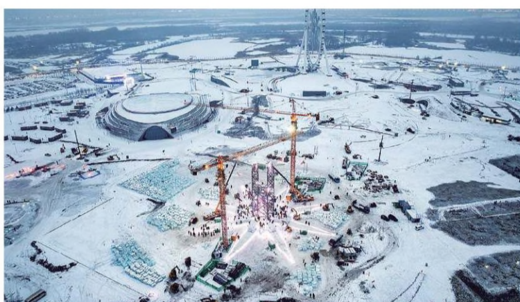
The Harbin Ice and Snow World theme park under construction in late November.

"Tourists from the south seem to be more enthusiastic about skiing, and some indoor