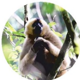
Male (top) and female western black-crested gibbons.

border of Xinping county in Yuxi and Zhenyuan county in Pu'er, with an average altitude of 7,900 feet. According to the station's records, more than 200 species of migratory birds appear in that area each year, including the yellow-breasted bunting.