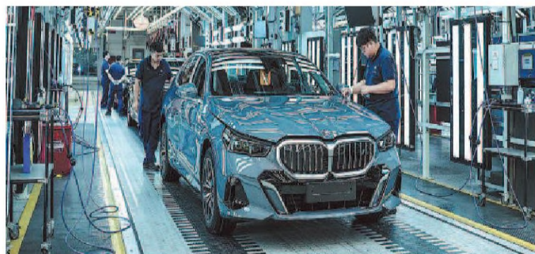
Employees work on a BMW assembly line in Shenyang, Liaoning province.