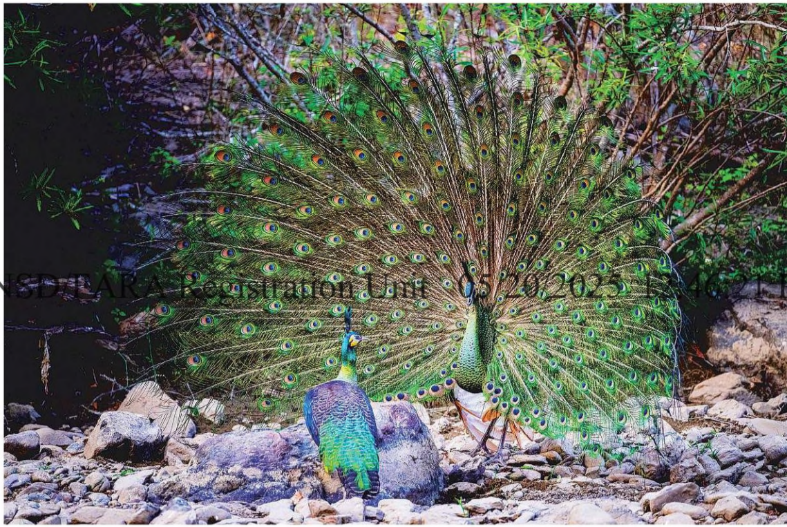
A green peafowl displays its tail feathers.

"After many years of silence, since 2021 it has