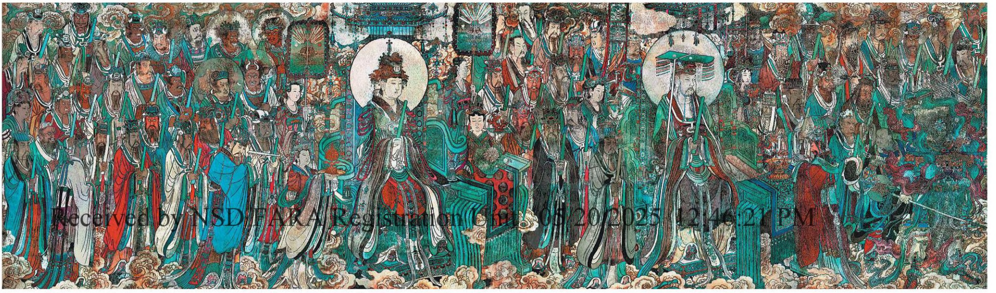
A copy of Chaoyuan Tu , the best-known mural in the Yongle Palace in Yuncheng, Shanxi province.