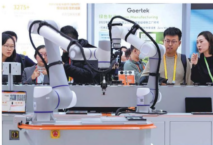
The Apple Inc. booth at the second China International Supply Chain Expo in Beijing in November.

"We will continue to provide consumers here with continuously iterated high-quality products, boost the digital upgrading of industrial and supply chains, and actively support the construction and development of China's infor-