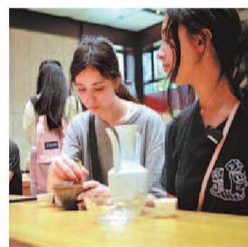
Students from the U.S. at a tea-making event in Zhejiang province.

In 1979 Hubei province and Ohio became the first U.S./China sister province/state relationship, and Nanjing, Jiangsu province, and St. Louis, Missouri, later established the first sister-city rela-