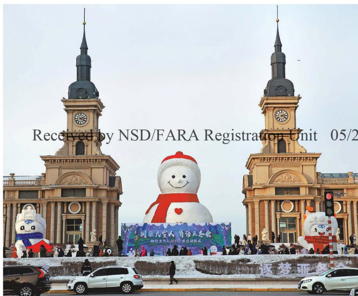
A giant snowman set in Harbin, Heilongjiang province, highlights the city's winter attractions.