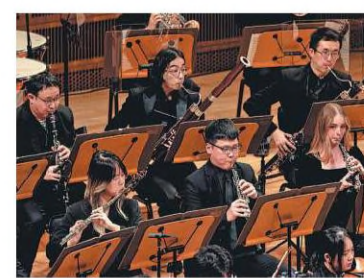
The Tianjin Juilliard Orchestra in concert on Oct 20.