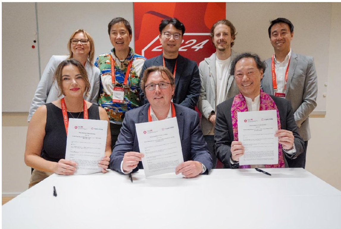
Photo 2: Representatives of InvestHK, CVA and the industry at the MoU Ceremony.