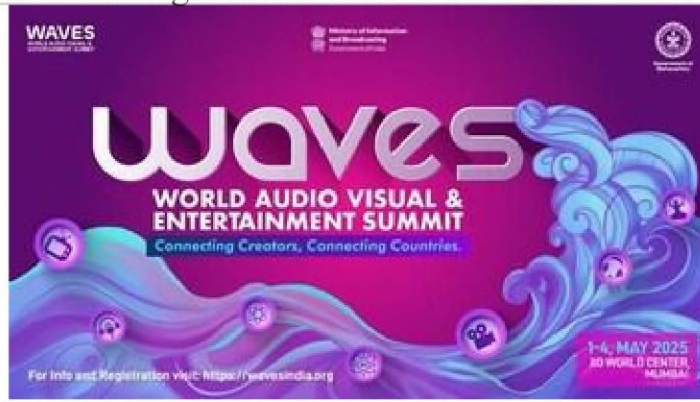
WAVES Summit 2025