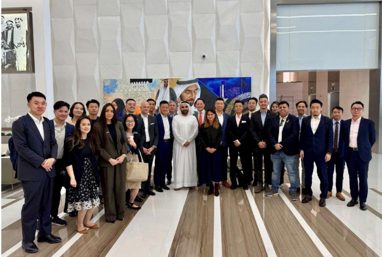
Photo 5: Representatives of InvestHK and delegates participating in a meeting with Mubadala Investment Company at Mubadala Tower in Abu Dhabi on May 15 (Abu Dhabi time).