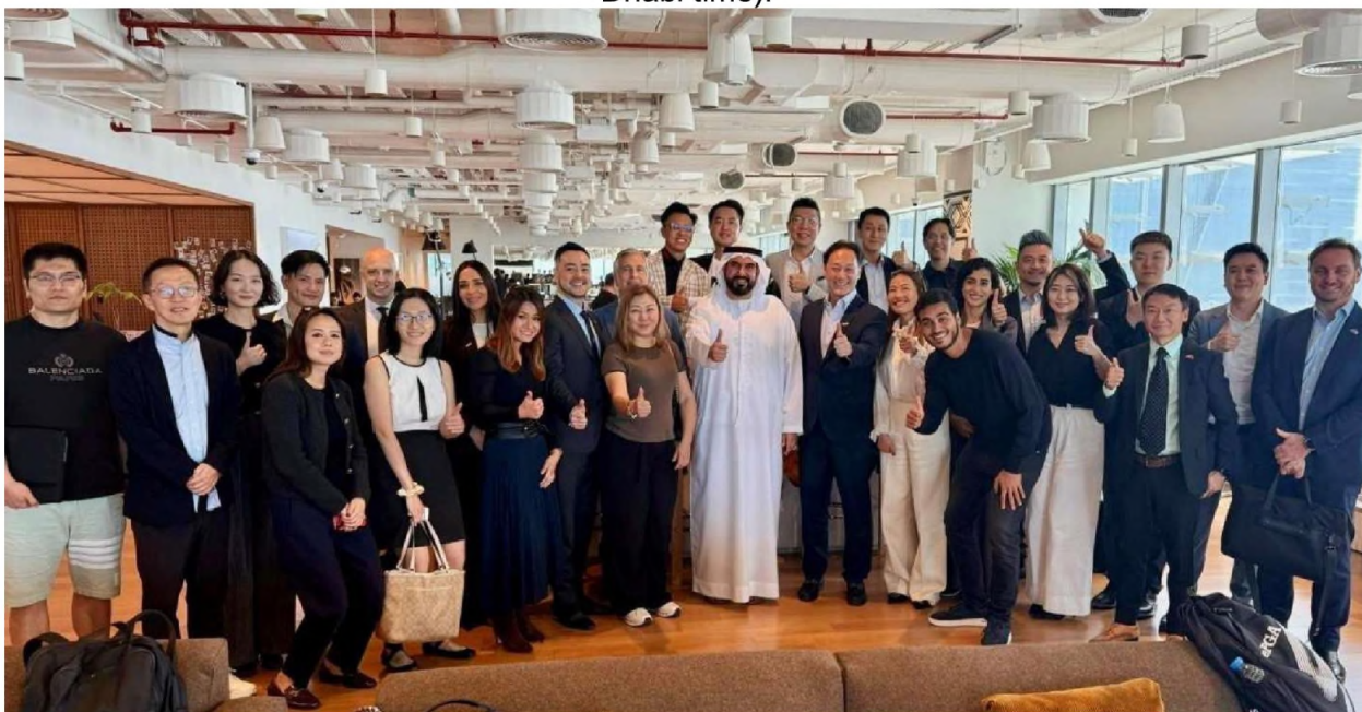
Photo 4: Representatives of InvestHK and delegates participating in a meeting with Hub71 at the Abu Dhabi Global Market on May 14 (Abu Dhabi time).