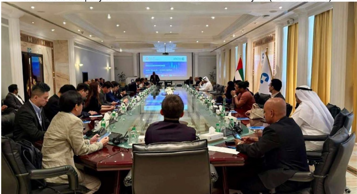
Photo 6: Representatives of InvestHK and delegates participating in a meeting with the Abu Dhabi Chamber of Commerce and Industry and its members, followed by a networking session hosted by the Chamber, on May 15 (Abu Dhabi time).