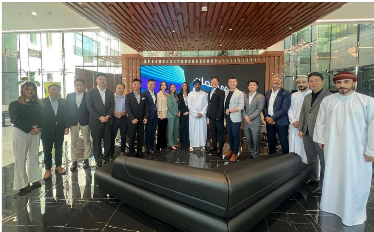
Photo 1: Representatives of InvestHK and delegates participating in a meeting with Invest Oman and Omani stakeholders in Muscat on May 11 (Muscat time).