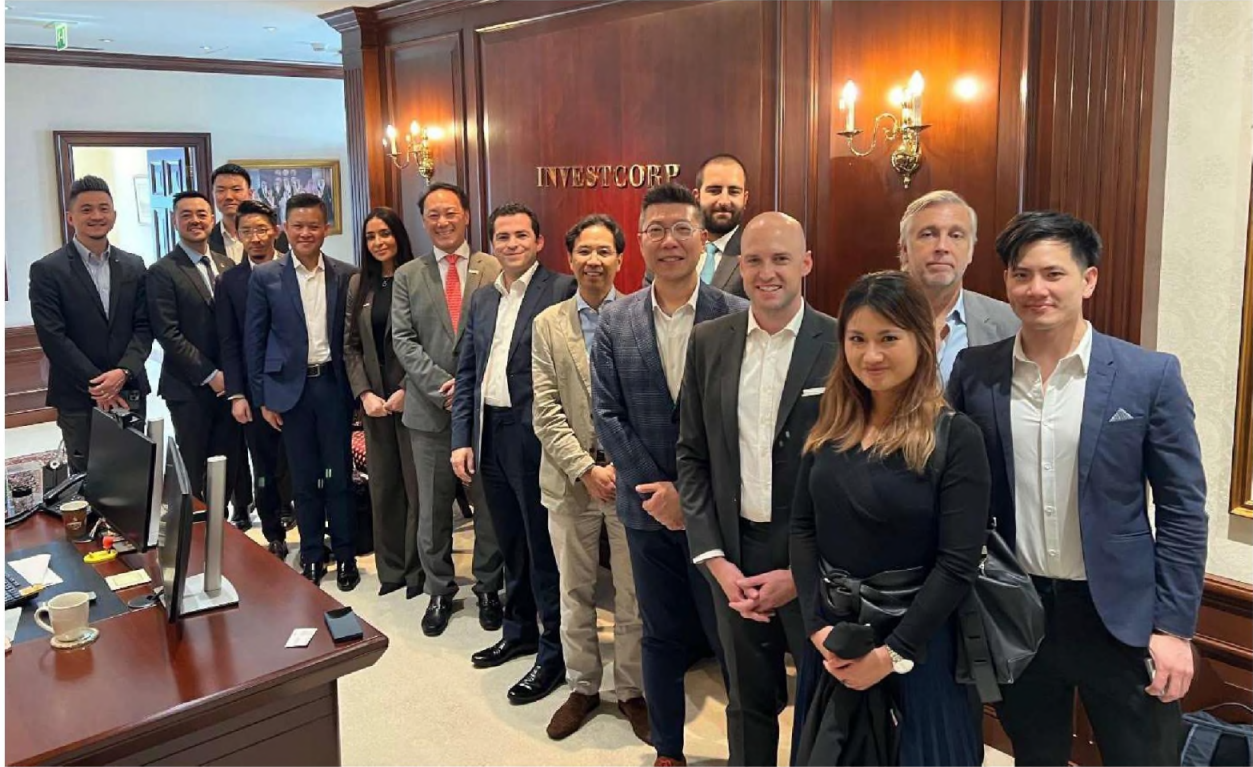
Photo 7: Representatives of InvestHK and delegates participating in a meeting with InvestCorp at their Abu Dhabi office on May 15 (Abu Dhabi time).