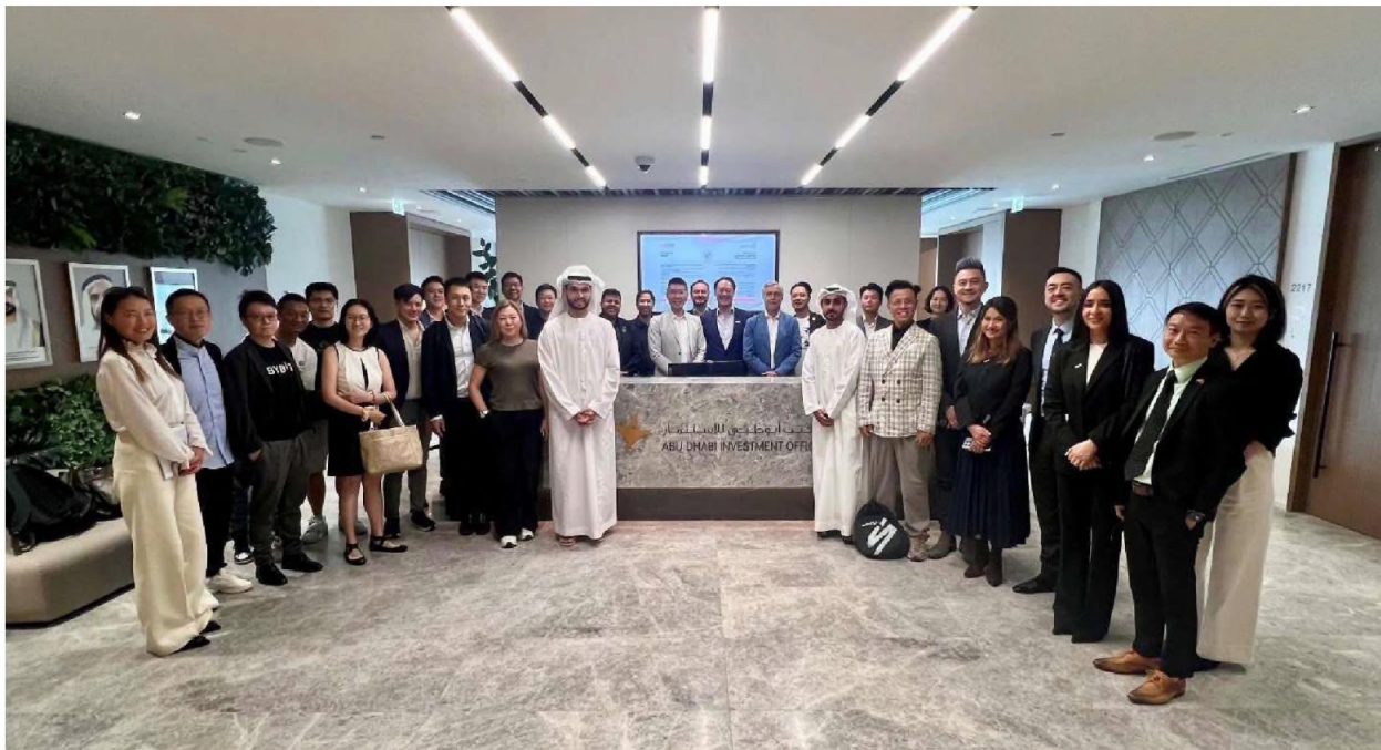
Photo 3: Representatives of InvestHK and delegates participating in a meeting with the Blockchain Centre Abu Dhabi, hosted by the Abu Dhabi Investment Office, on May 14 (Abu Dhabi time).