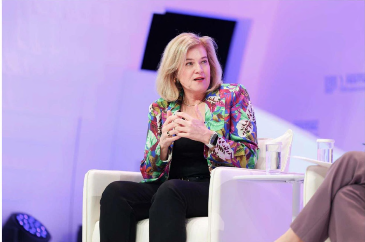
The Hong Kong FinTech Week x StartmeupHK Festival (HKFW x SMUF) 2025 concluded today (November 7). Photo shows the President and Chief Executive Officer of Franklin Templeton, Ms Jenny Johnson, sharing her views at the themed forum at the HKFW x SMUF 2025 on November 3.

HONG KONG FINTECH WEEK STARTMEUPHK FESTIVAL 10th anniversary