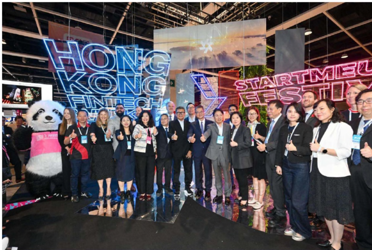
The Hong Kong FinTech Week x StartmeupHK Festival (HKFW x SMUF) 2025 concluded today (November 7). More than 30 Chinese Mainland and international delegations showcased their advanced technologies at the HKFW x SMUF 2025. Photo shows the Financial Secretary, Mr Paul Chan (eleventh right), greeting representatives on November 3.