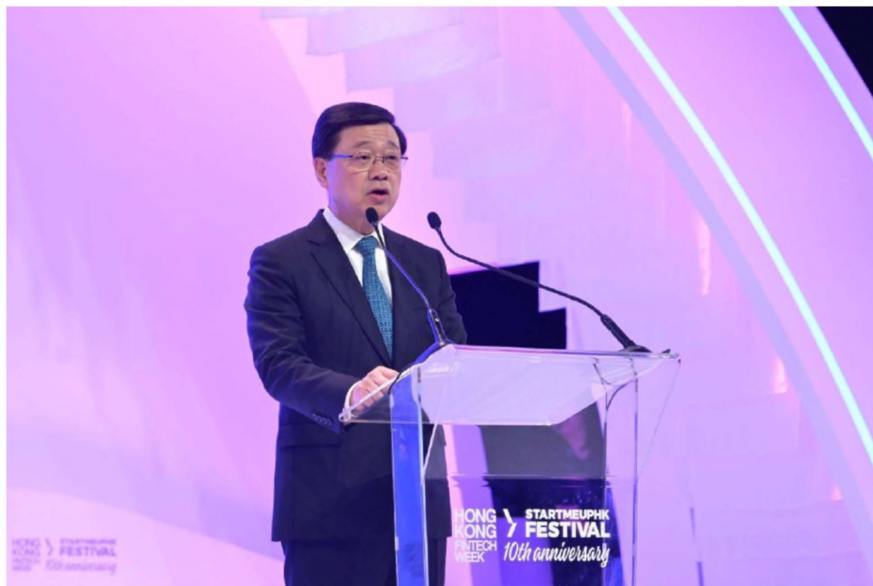
The Chief Executive, Mr John Lee, spoke at the Hong Kong FinTech Week x StartmeupHK Festival 2025 yesterday (November 3).

HONG KONG STARTMEUPHK FINTECH FESTIVAL WEEK 10th anniversary