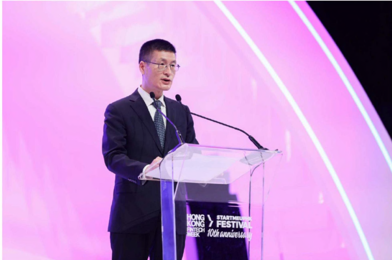
The Hong Kong FinTech Week x StartmeupHK Festival (HKFW x SMUF) 2025 concluded today (November 7). Photo shows Deputy Governor of the People's Bank of China Mr Lu Lei delivering a keynote address at the HKFW x SMUF 2025 on November 3.

HONG KONG FINTECH WEEK STARTMEUPHK FESTIVAL 10th anniversary