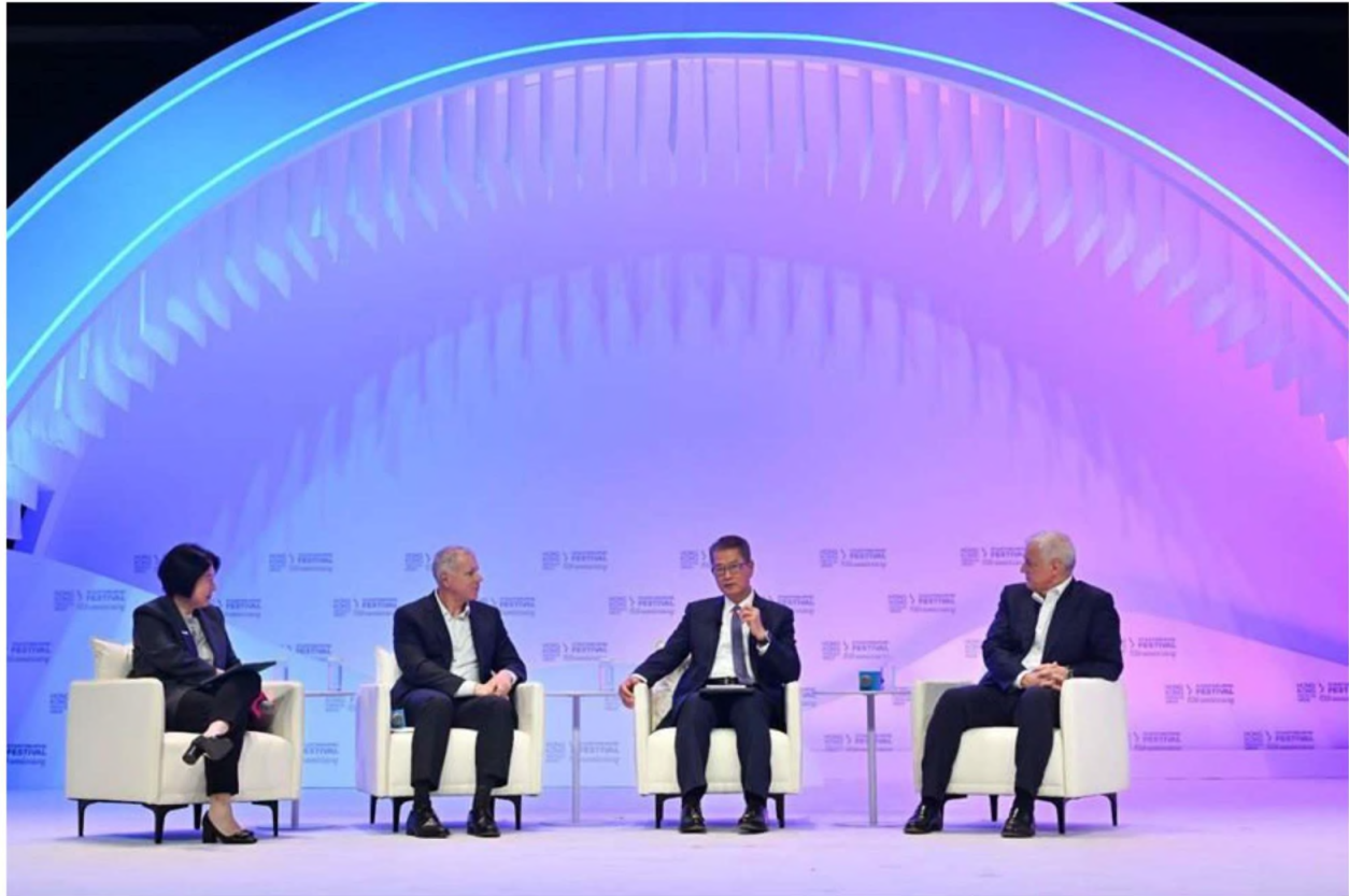
The Financial Secretary, Mr Paul Chan (second right), attended the Hong Kong FinTech Week x StartmeupHK Festival 2025 yesterday (November 3).

HONG KONG STARTMEUPHK FINTECH FESTIVAL WEEK 10th anniversary