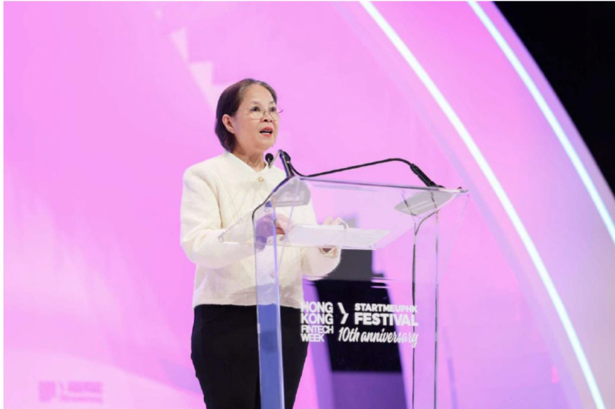
The Hong Kong FinTech Week x StartmeupHK Festival (HKFW x SMUF) 2025 concluded today (November 7). Photo shows the Under Secretary for Environment and Ecology, Miss Diane Wong, delivering a keynote address at the HKFW x SMUF 2025 on November 4.

HONG KONG STARTMEUPHK FINTECH FESTIVAL WEEK 10th anniversary