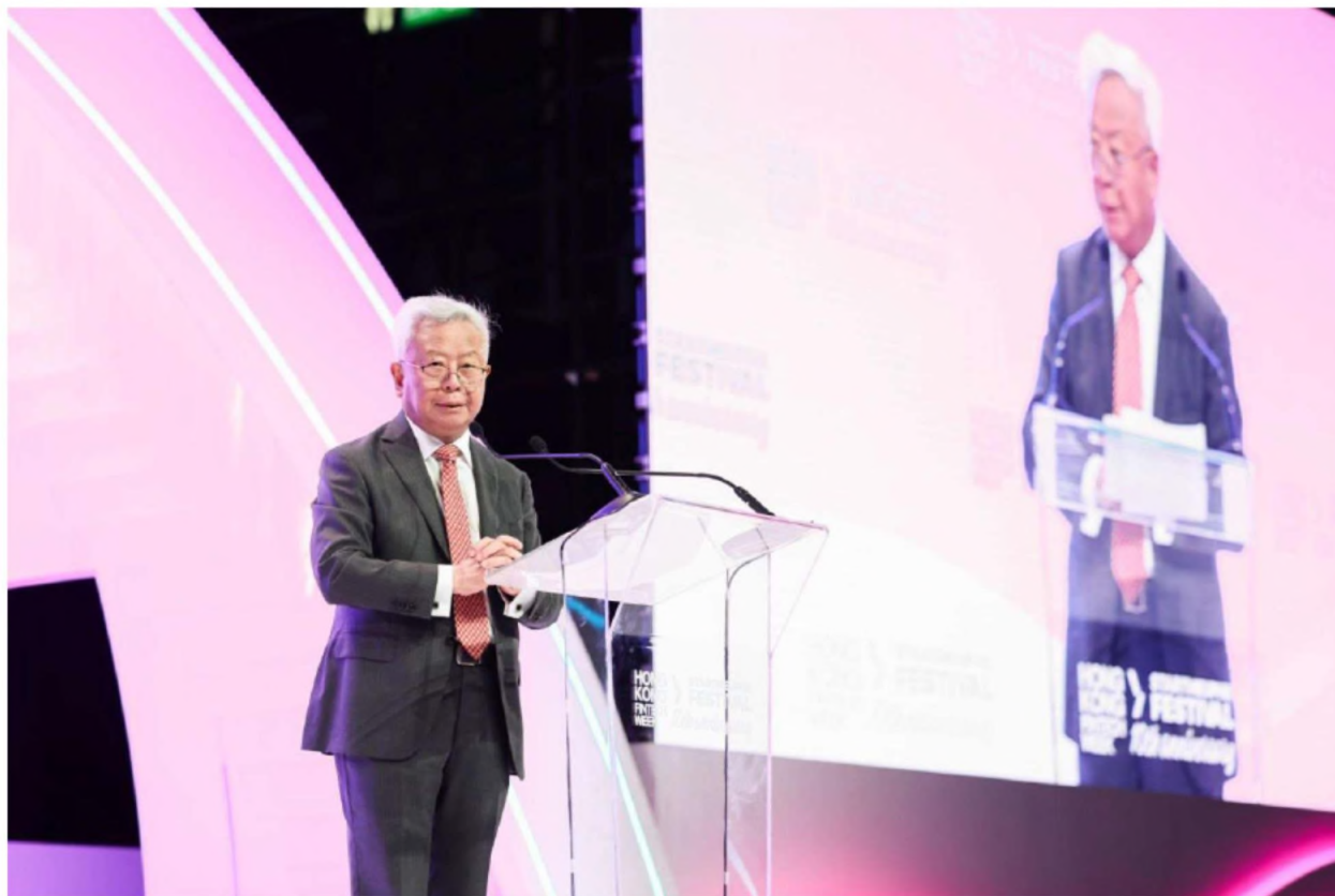
The Hong Kong FinTech Week x StartmeupHK Festival (HKFW x SMUF) 2025 concluded today (November 7). Photo shows the President and Chair of the Board of Directors of the Asian Infrastructure Investment Bank, Mr Jin Liqun, delivering a keynote address at the HKFW x SMUF 2025 on November 3.

HONG KONG FINTECH WEEK STARTMEUPHK FESTIVAL 10th anniversary