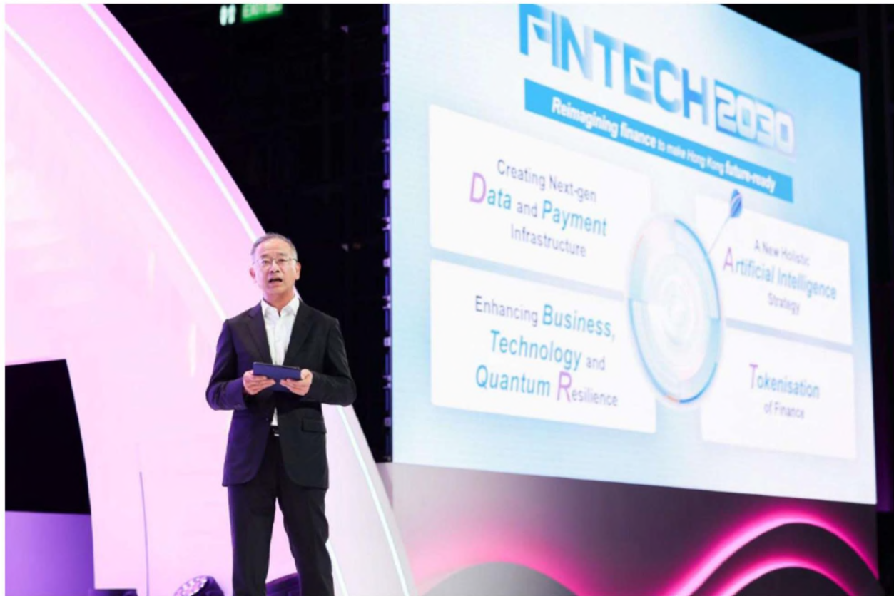
The Hong Kong FinTech Week x StartmeupHK Festival (HKFW x SMUF) 2025 concluded today (November 7). Photo shows the Chief Executive of the Hong Kong Monetary Authority, Mr Eddie Yue, delivering a keynote address at the HKFW x SMUF 2025 on November 3.

HONG KONG FINTECH WEEK STARTMEUPHK FESTIVAL 10th anniversary