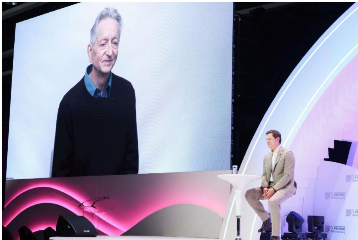
The Hong Kong FinTech Week x StartmeupHK Festival (HKFW x SMUF) 2025 concluded today (November 7). Photo shows Nobel Laureate in Physics, Professor Emeritus of the University of Toronto Mr Geoffrey Hinton sharing views via video conferencing at the HKFW x SMUF 2025 on November 3.