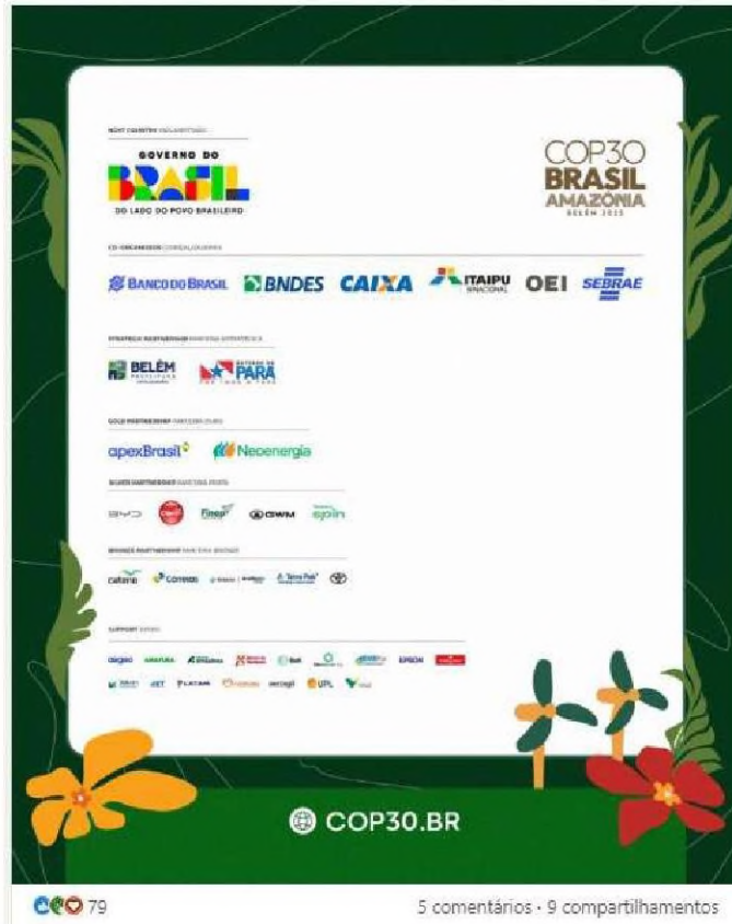
Sponsor thank you post