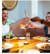
A Weekend of Cocktail Culture in Bermuda