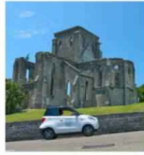
21 Free or Affordable Things to do in Bermuda