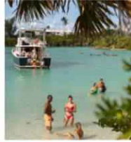
Bermuda's 40 Greatest Outdoor Adventures