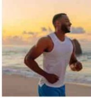
Four-Day Itinerary for the Active Runner