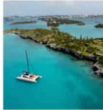
More Than a Pretty Place: Bermuda's Top Summer Adventures