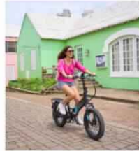
Your Guide to Getting Around Bermuda by Land and Sea