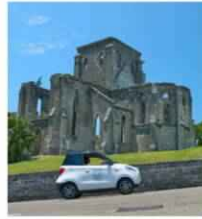
21 Free or Affordable Things to do in Bermuda