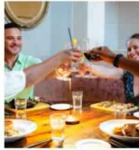
A Weekend of Cocktail Culture in Bermuda