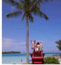
Endless Summer: A Blissful 5-Day Itinerary