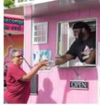
East to West - A Foodie's Guide to What's Good