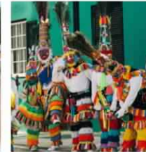
Itinerary: Three Days of Bermuda Culture