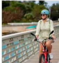
Check Off Your Fall Bermuda Bucket List