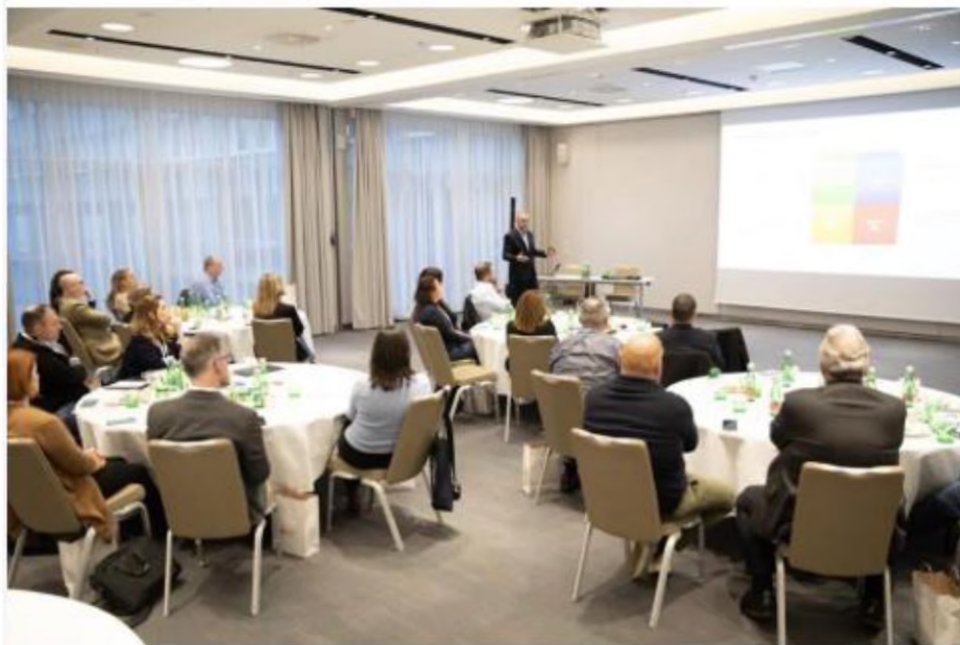
Kenes Group Leadership Summit 2025 - Vienna, Austria

From January 13 to 14, Kenes Group hosted its annual Kenes Leadership Summit 2025 , a traditional gathering of the management board and key partners, including Interplan, Kenes M+, derCampus, and Kenes Asia . The Summit, which fosters collaboration and innovation across the organisation, covered various critical topics shaping the company's strategic direction.