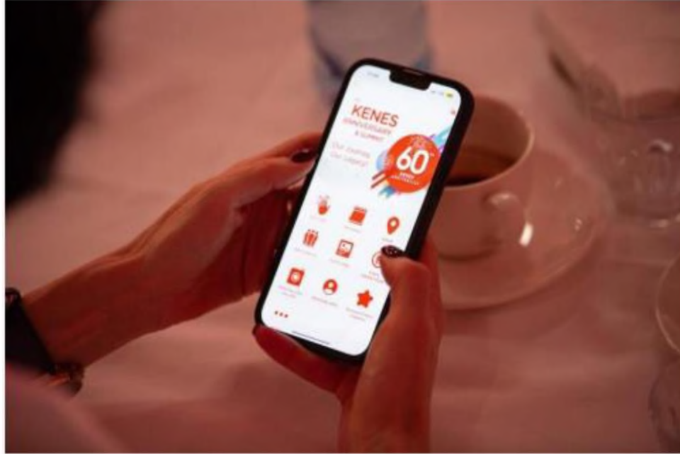
Kenes Group 60th Anniversary and Leadership Summit 2025 - Vienna, Austria