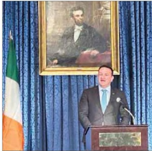
Leo Varadkar speaking in Philadelphia.

But, what does Varadkar mean when he says that the impetus for great change must come from below? Surely he had in mind the efforts of grassroots organizations like Ireland's Future, a cross-party, cross-community organization that promotes the shared responsibility of delivering constitutional change within the