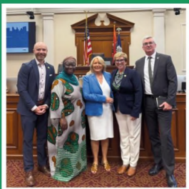
Sinn Féin MP Pat Cullen in Nashville City Hall. Pat is the former head of the largest nurse's union in the world.