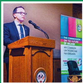
Sinn Féin MP Dáire Hughes speaking at a People's Assembly in Cleveland, OH.