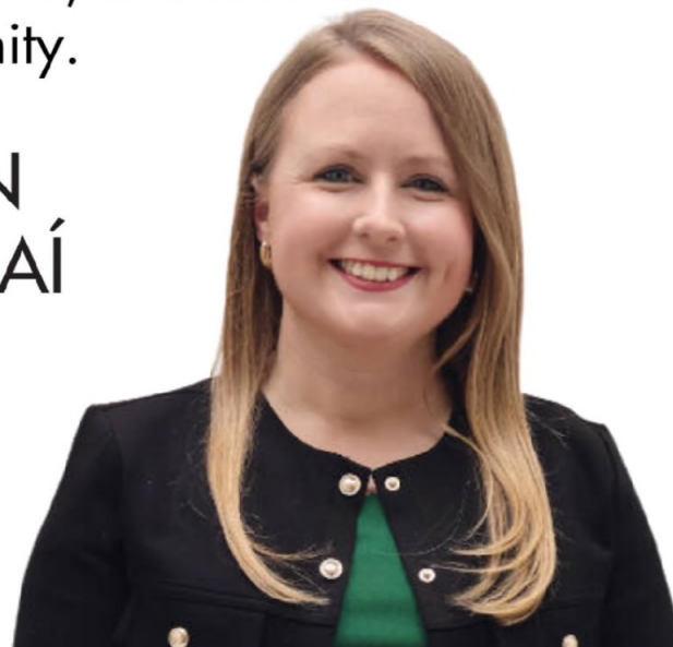
Featuring Mairéad Farrell TD

Catalpa Anniversary Event in New Bedford, MA - October 27, 2025