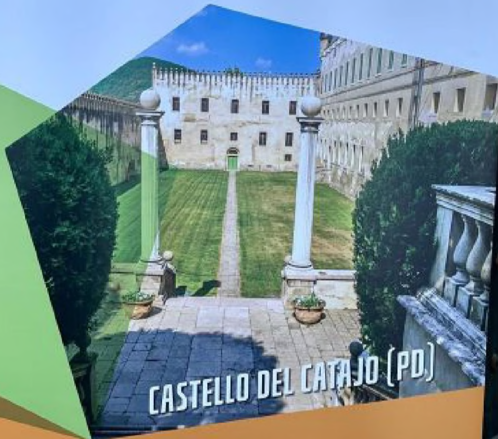
CASTELLO DEL CATAJO (PD)