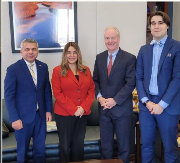
KRG Representative Engagement with US Congress