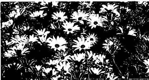
Colombian Flowers The Best in the World | Marco Paíz Colombia Why are Colombian flowers the best in the world? colombia.co

Celebrate #ValentinesDay with an exotic and beautiful colombian flower. #ColombialsSabrosura