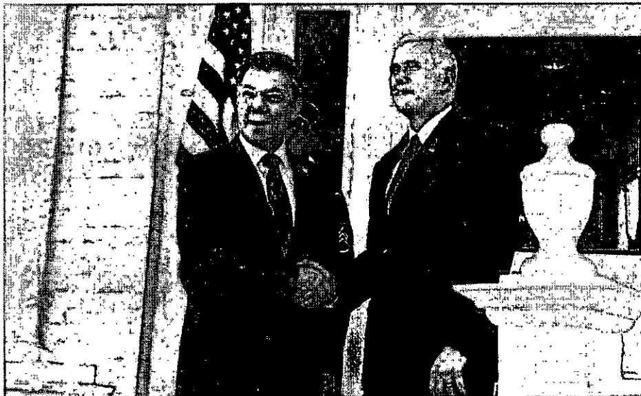
President Santos and Vice President Pence at the U.S. Naval Observatory on May 19, 2017.

Last week, the White House announced that Vice President Mike Pence will visit Colombia as part of his trip to Central and South America, August 13-18. While in Bogotá and Cartagena, the Vice President will meet with President Juan Manuel Santos and other key Colombian government officials.