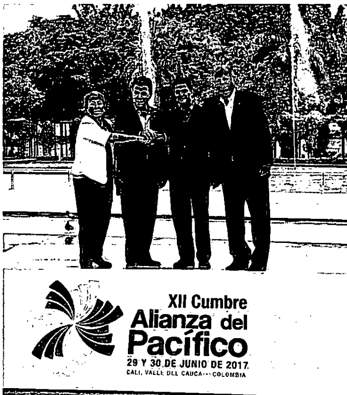
Chilean President Michelle Bachelet, President Santos, Mexican President Enrique Peña Nieto and Peruvian President Pedro Pablo Kuczynski in Cali on June 30, 2017.

Last Thursday and Friday, in the Colombian city of Cali, President Santos hosted his counterparts from Chile, Mexico and Peru for the 12 th Presidential Summit of the Pacific Alliance, during which Colombia assumed the pro tempore presidency of the Alliance, a shifting role among the four countries. The Pacific Alliance is an open and innovative platform for expanding economic integration across Latin America and for making the four countries and the region more competitive in global markets. In addition, the Alliance is advancing cooperation between the four countries in a number of areas, including social and economic development, health, innovation, academic exchanges, climate change and science and technology.