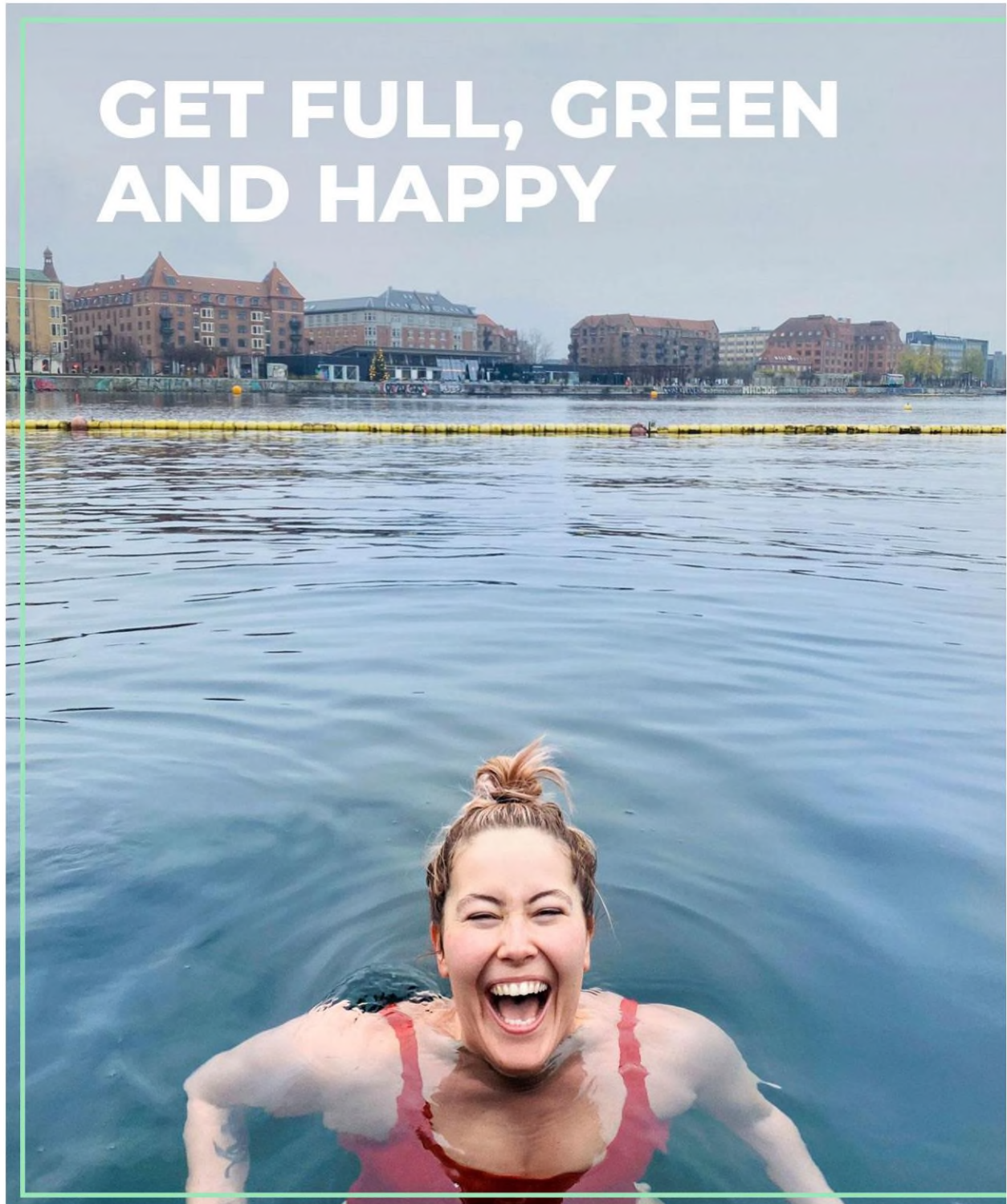
Kalvebod Bølge in Copenhagen.