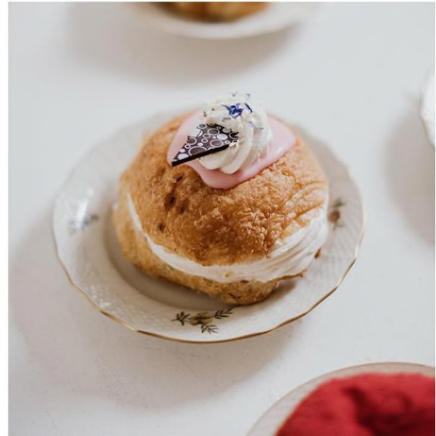
Danish Fastelavnsboller