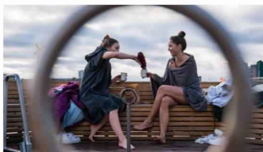
Harbour Bathing

Fill your calendar with heartwarming, experiences that are just around the corner like Winter Jazz , The Copenhagen Light Festival and Winter Pride .