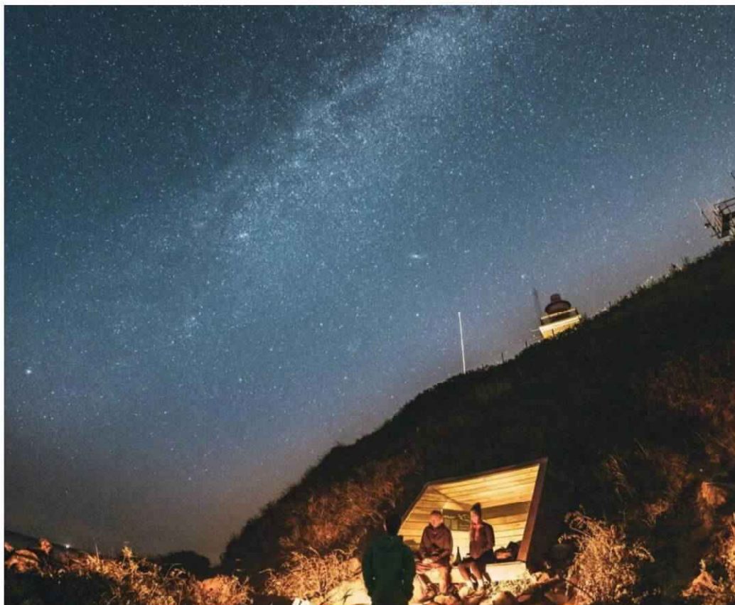
Røsnæs