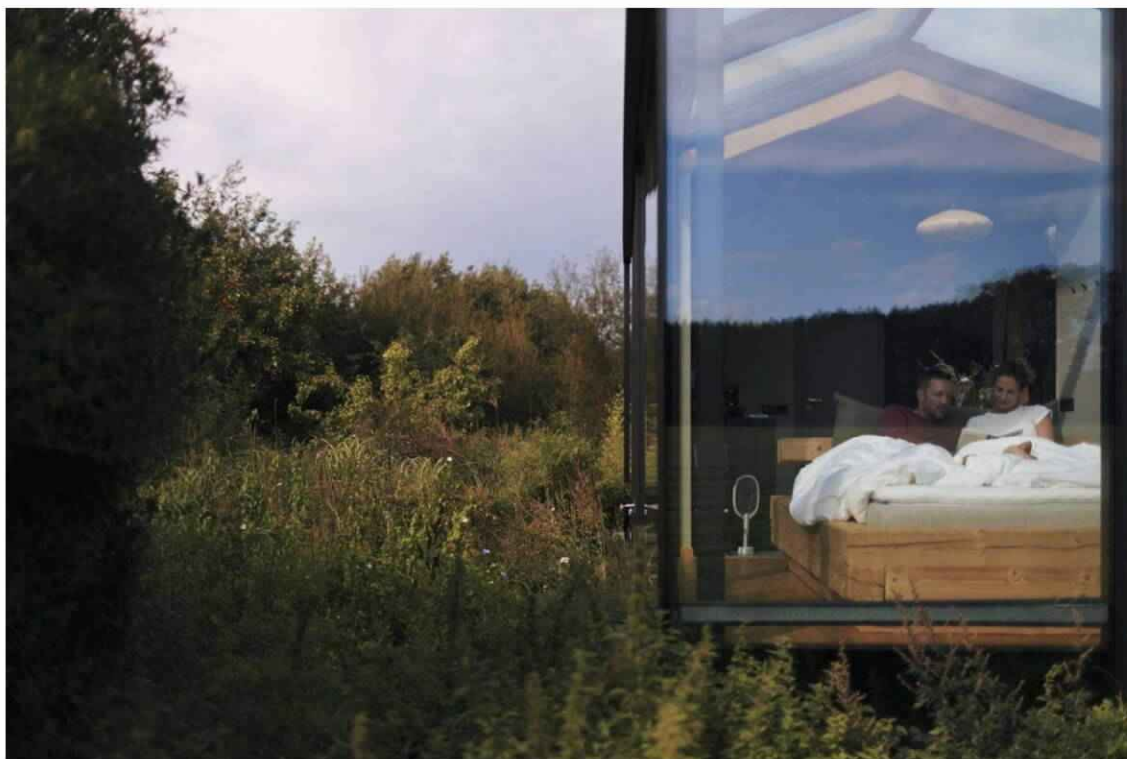
The glass cabin, hidden in the Lolland Alps