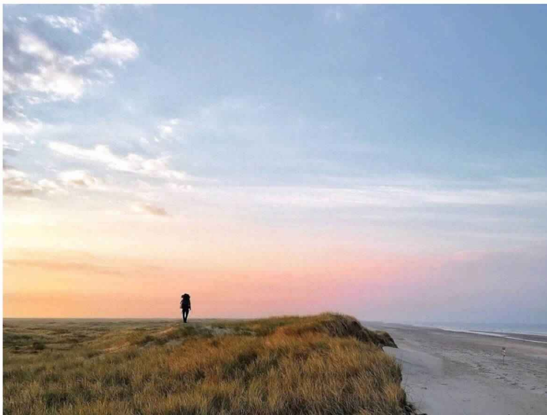
Hiking along Skallingen