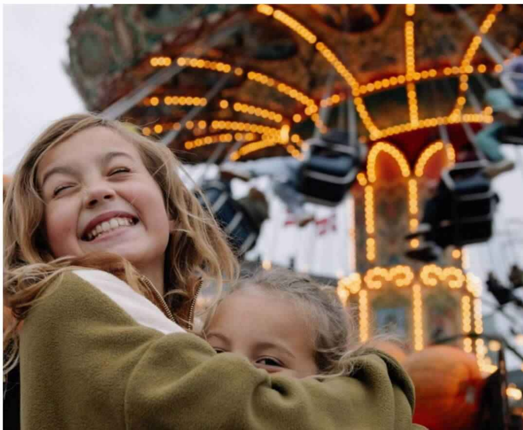
Tivoli

Your guide to glamping and camping in Denmark