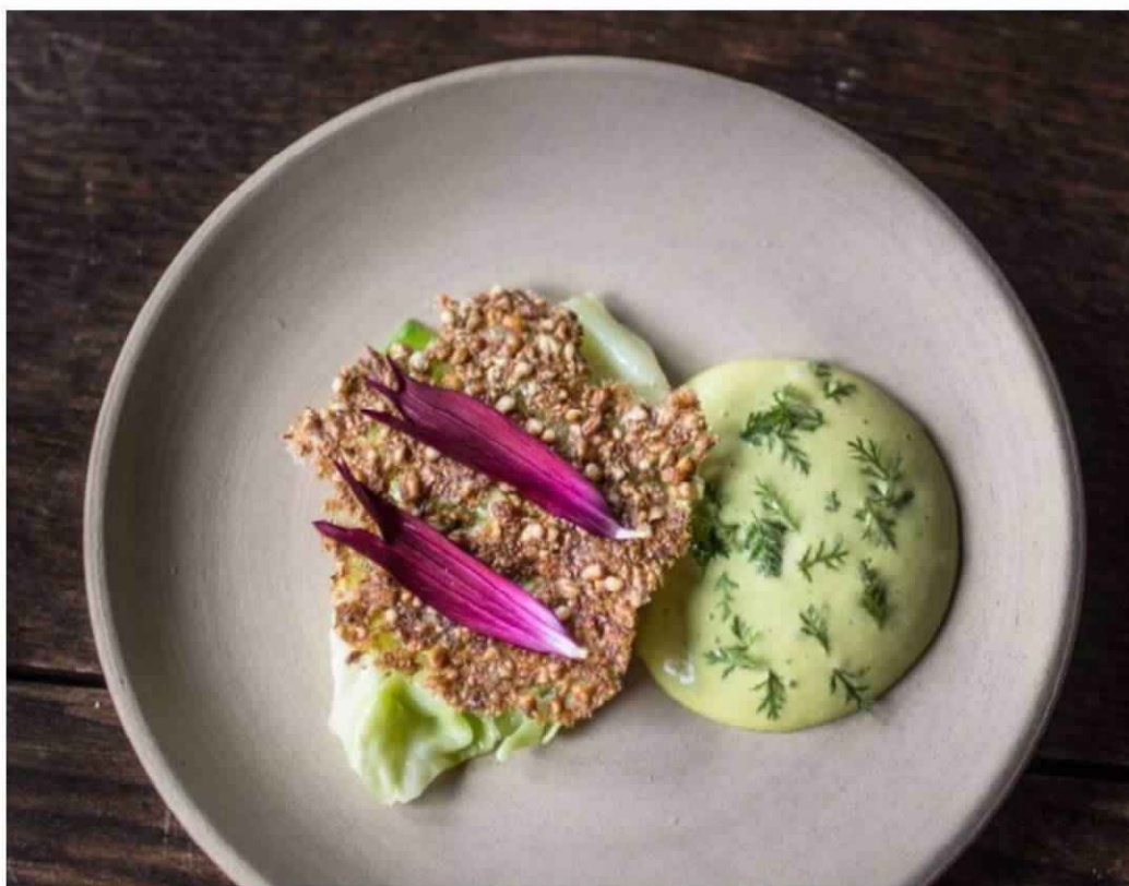
Restaurant Moment

A taste of Danish excellence: Michelin stars, Dining Week & culinary champions