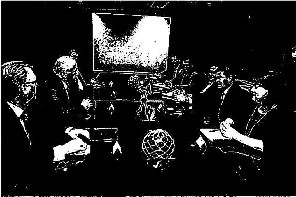
Honduran President Touts Productive Relationship With U.S. in Bilateral Meeting

Following the meeting, President Hernández said the United States and Honduras have a "healthy and productive" relationship.