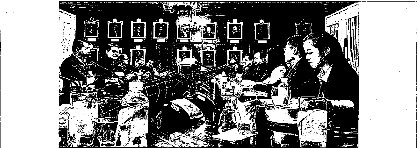
Honduran Employment Zones Draw Interest From International Businesses

Eight international businesses -- Energy Transfer, Port Royal, Lacthosa, Emco Group, Lamericom, Dong Ju, Rapton Mining, and Wonder Foods -- have submitted letters expressing their interest in the ZEDE initiative.