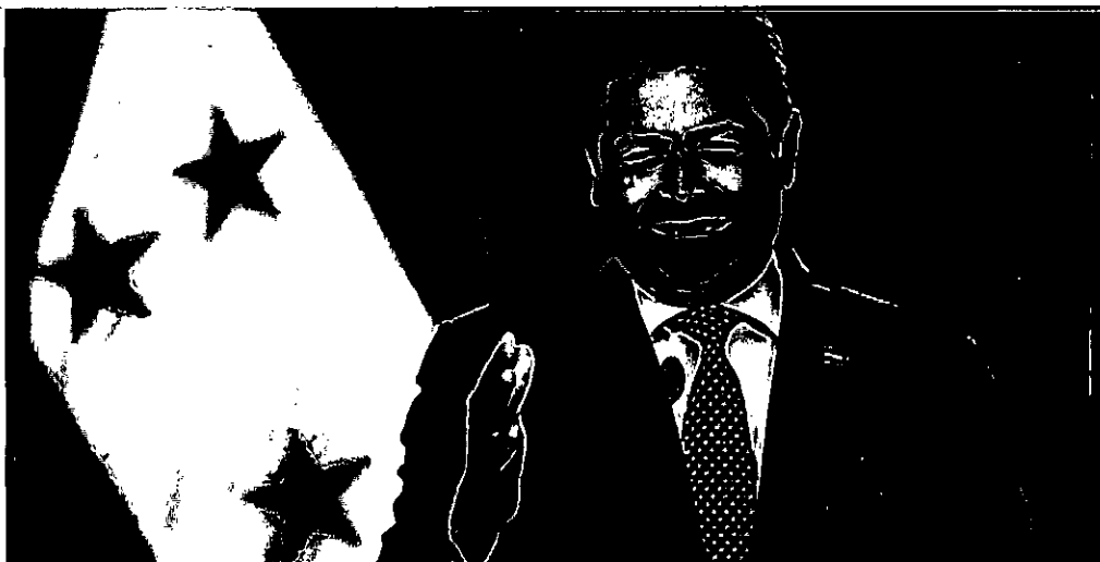
Honduran President Juan Orlando Hernández Addresses the Nation as Official Winner of 2017 Election