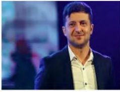
У Зеленского определили, кто станет премьер-министром