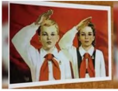
Почему у пионеров в СССР были запрещены рукопожатия