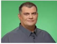
Тяжелая утрата: «Квартал 95» попрощался с Юзиком