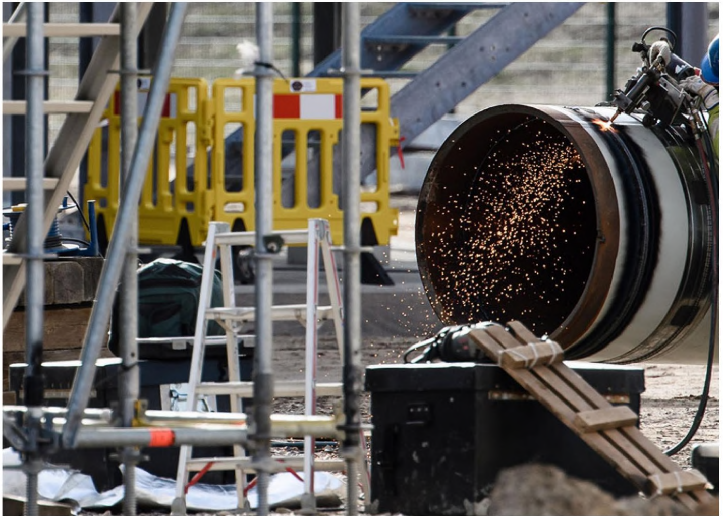
Several European countries have criticized the pipeline, saying it will increase German and EU dependence on Russia for critical gas supplies.

France on Monday urged Germany to scrap a major gas pipeline project with Russia in protest over the detention in Moscow of opposition leader Alexei Navalny.