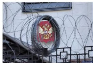
EU imposes Crimea-related sanctions on five persons involved in Russian State Duma elections