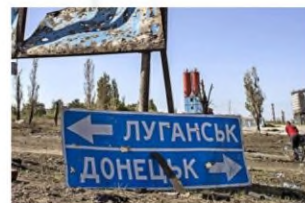
EU foreign ministers call on Putin not to recognize independence of CADLR