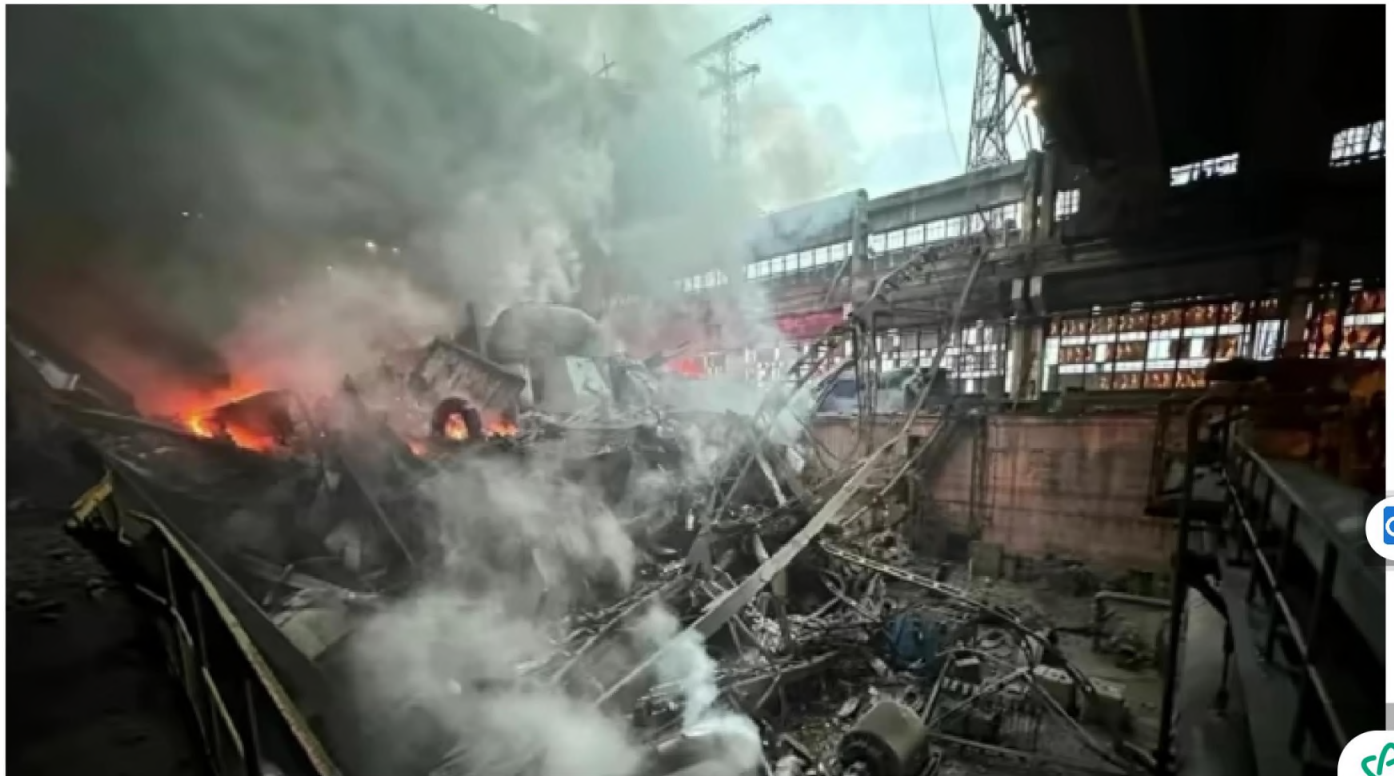
DESTRUCTION AS A RESULT OF THE ATTACKS IN 2023.

ECONOMICCHNA PRAVDA — MONDAY, 3 JUNE 2024, 12:29