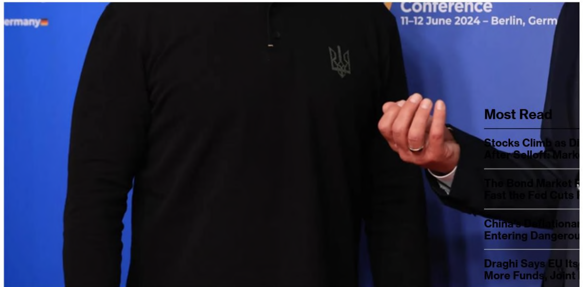
Olaf Scholz and Volodymyr Zelenskiy at the Ukraine Recovery Conference in Berlin, on June 11.

Russia resumed extensive attacks on Ukraine's power network last month, targeting energy facilities. An assault on June 1 prompted authorities to impose more rationing of electricity supplies.