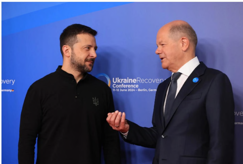
Olaf Scholz and Volodymyr Zelenskiy at the Ukraine Recovery Conference in Berlin, on June 11.