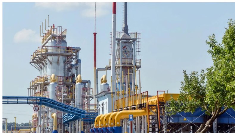
Illustrative purposes only: A picture shows a compressor station of Ukraine's Naftogaz national oil and gas company near the northeastern Ukrainian city of Kharkiv on Aug 5. 2014.

by Kateryna Hodunova July 16, 2024 8:32 PM 2 min read